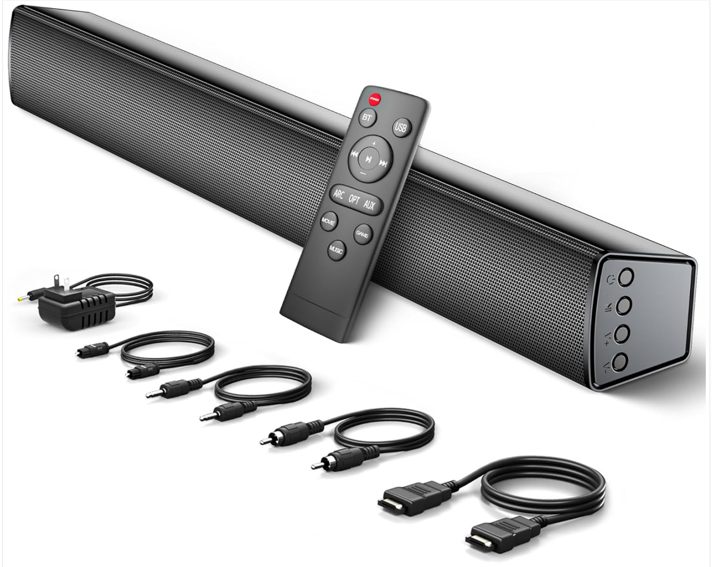
Image: Front view of the Miuscall-C SS1021B Sound Bar, highlighting the speaker grille and the control buttons located on the right side panel.