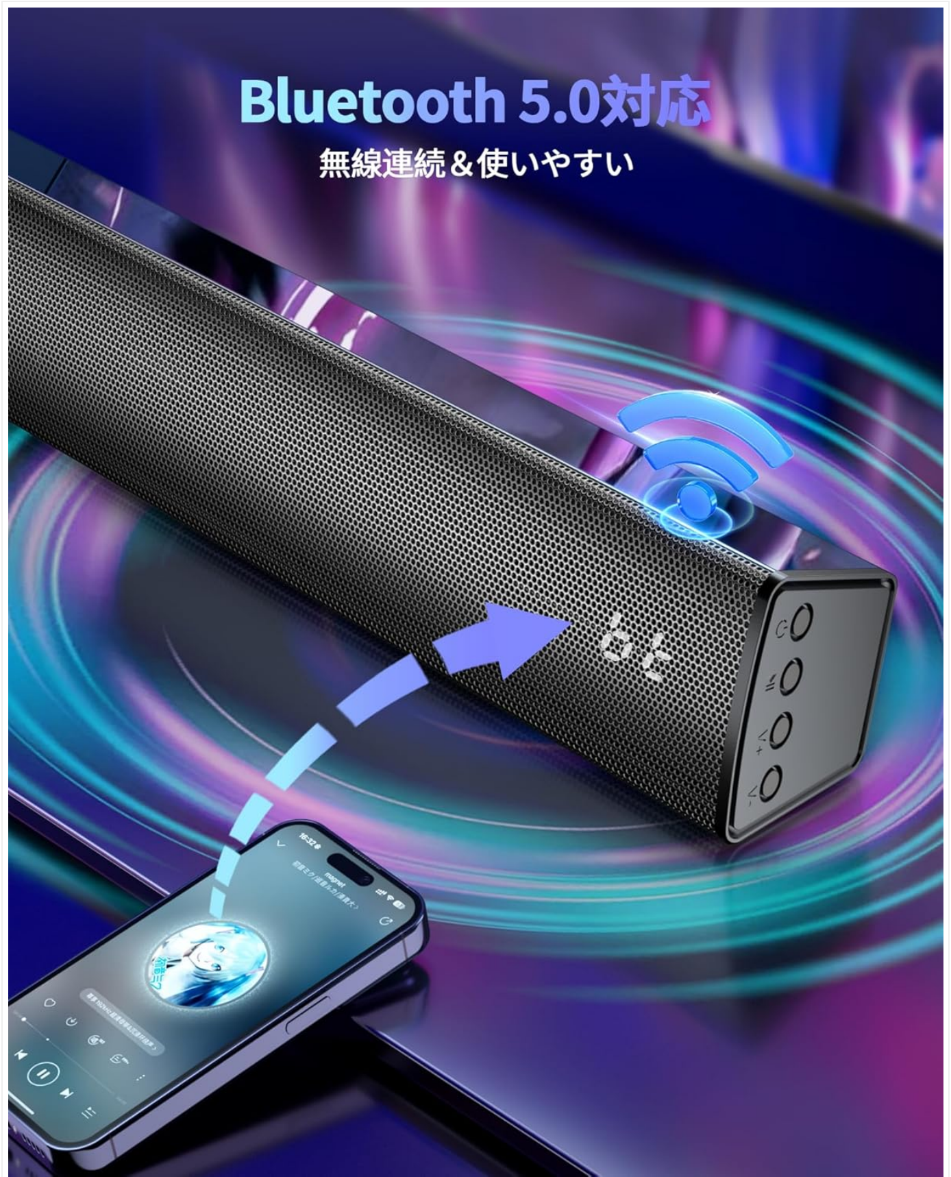
Image: The Miuscall-C SS1021B Sound Bar displaying "bt" on its LED screen, indicating Bluetooth mode, with a smartphone wirelessly connected, illustrating Bluetooth 5.0 compatibility.

The sound bar supports Bluetooth 5.0 with a maximum operating range of 10 meters (33 feet).