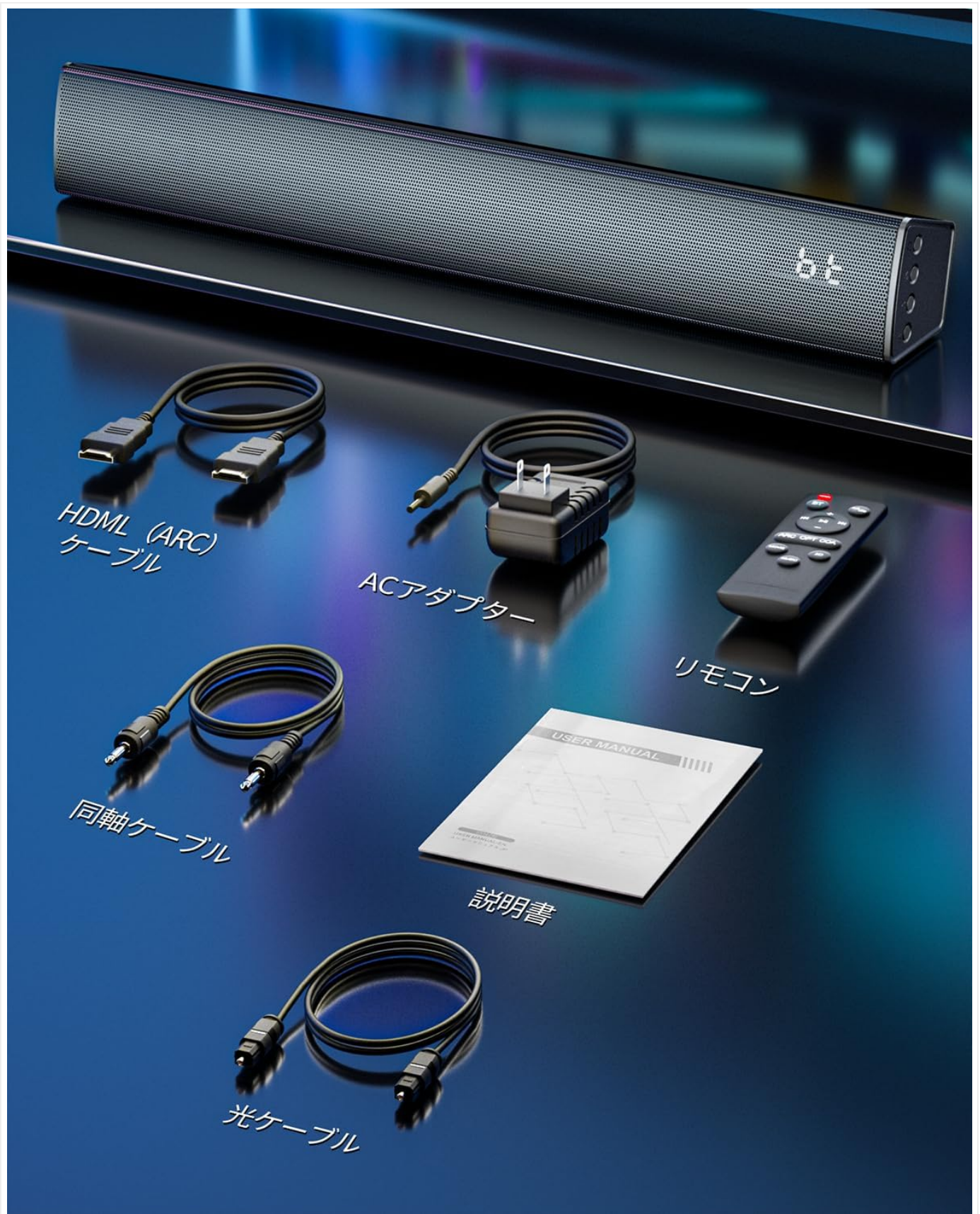
Image: All components included in the Miuscall-C SS1021B Sound Bar package. This includes the sound bar, remote control, power adapter, HDMI (ARC) cable, optical cable, AUX cable, RCA audio cable, and the user manual.