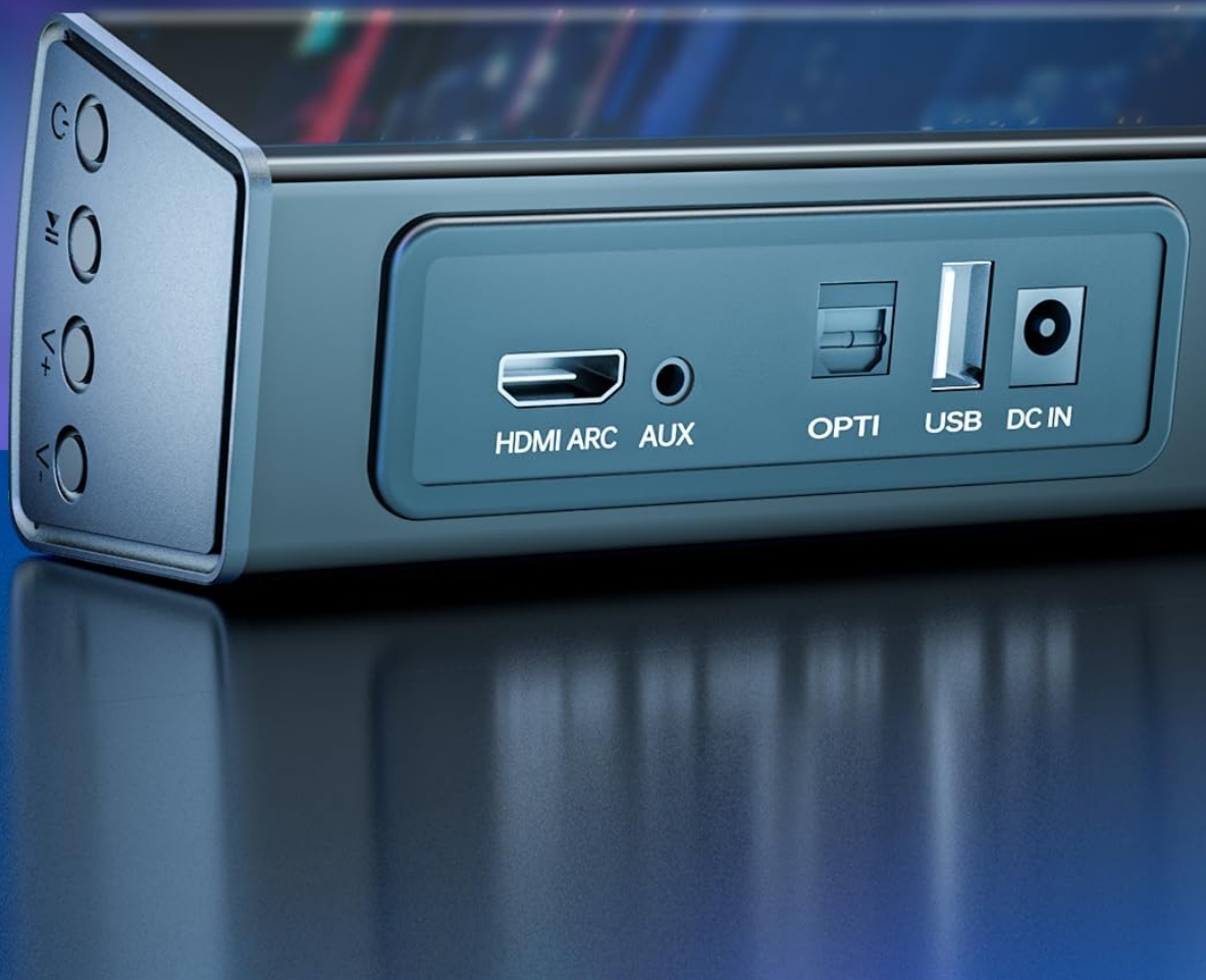
Image: Rear panel of the Miuscall-C SS1021B Sound Bar, showing the input ports: HDMI ARC, AUX, OPTI (Optical), USB, and DC IN for power.