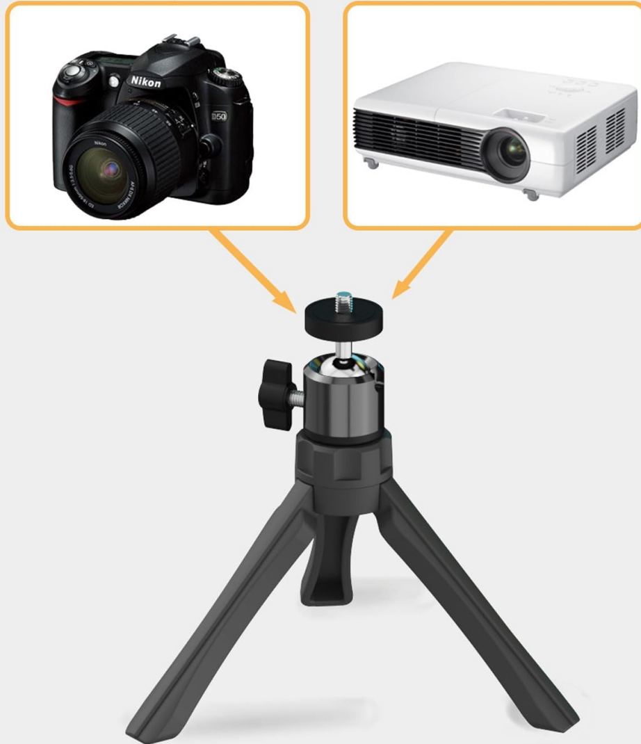
Image: Diagram showing the tripod's compatibility with both cameras and projectors. Note: Camera and projector are not included.