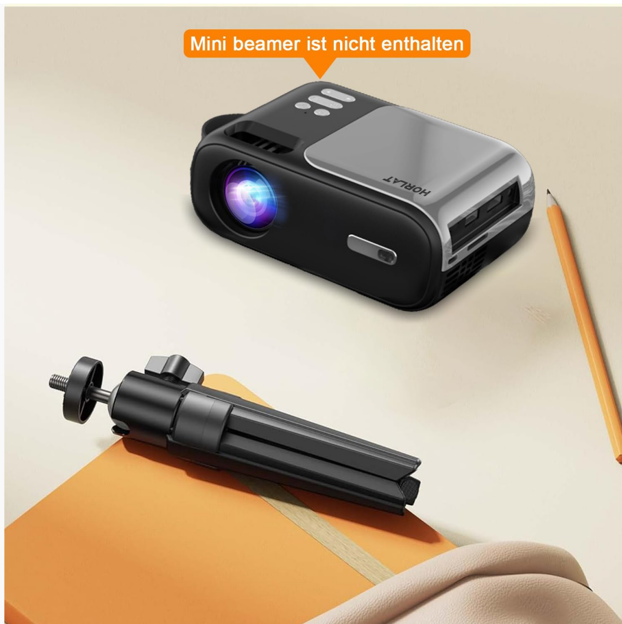
Image: The HORLAT tripod positioned next to a mini projector, illustrating its compact size. Note: The mini projector is not included with the tripod.