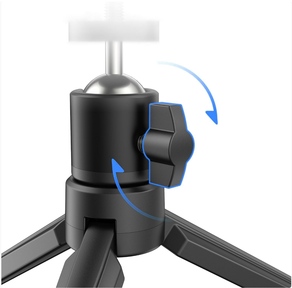
Image: Close-up of the tripod's ball head and adjustment knob, indicating rotational movement. The adjustment knob allows you to loosen or tighten the ball head, enabling 360-degree rotation and tilt for precise angle adjustments.