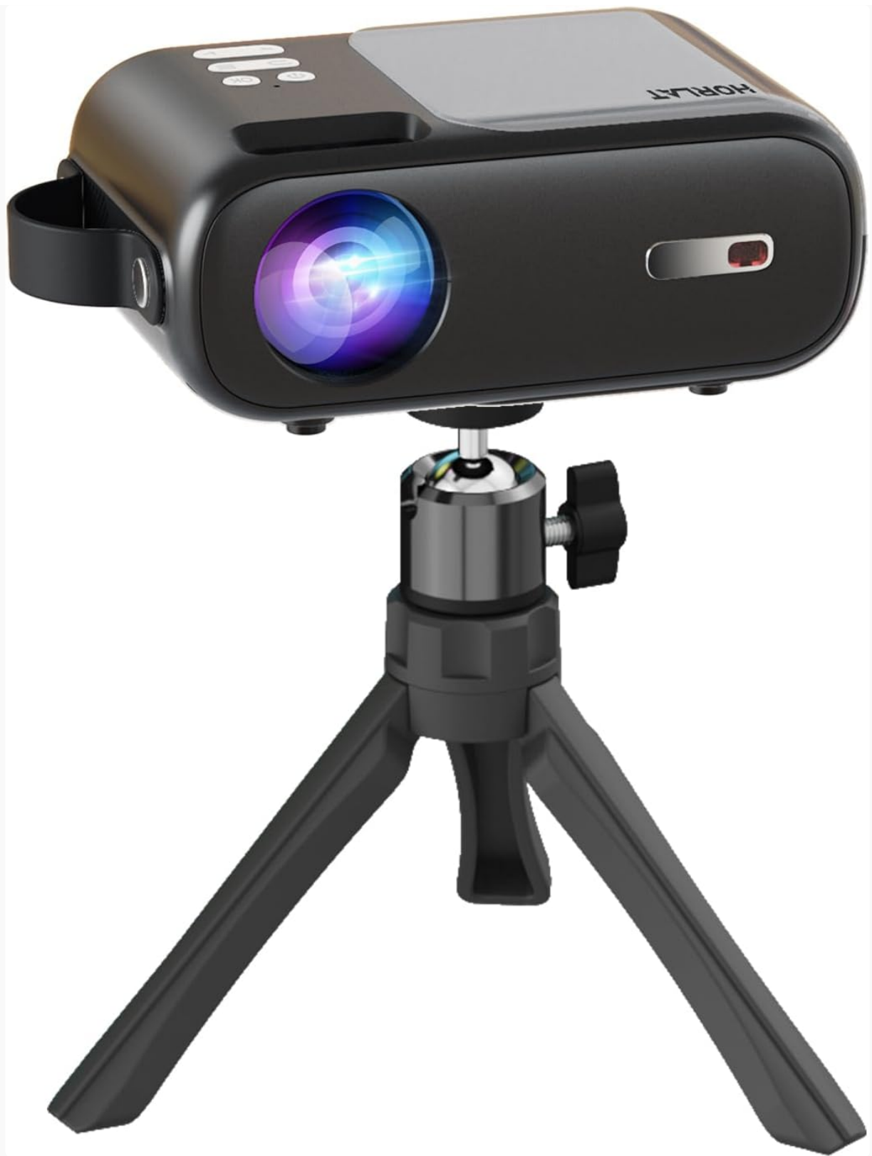
Image: A mini projector securely mounted on the HORLAT tripod, demonstrating a typical setup.