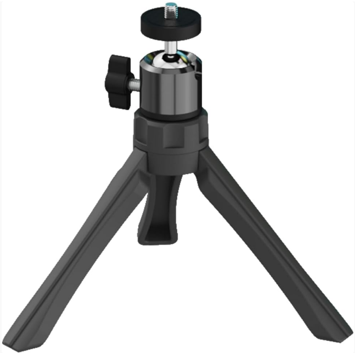
Image: The HORLAT Mini Projector Tripod, showing its compact design.