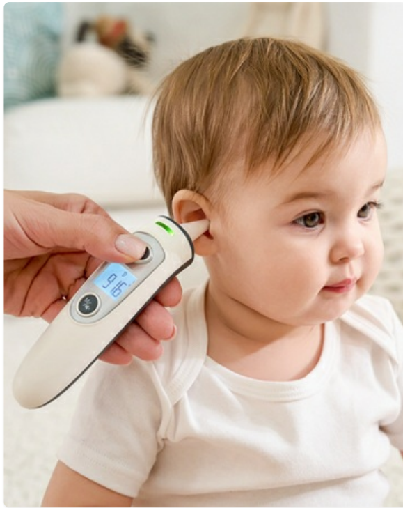
Figure 4: Silent mode icon on the display.