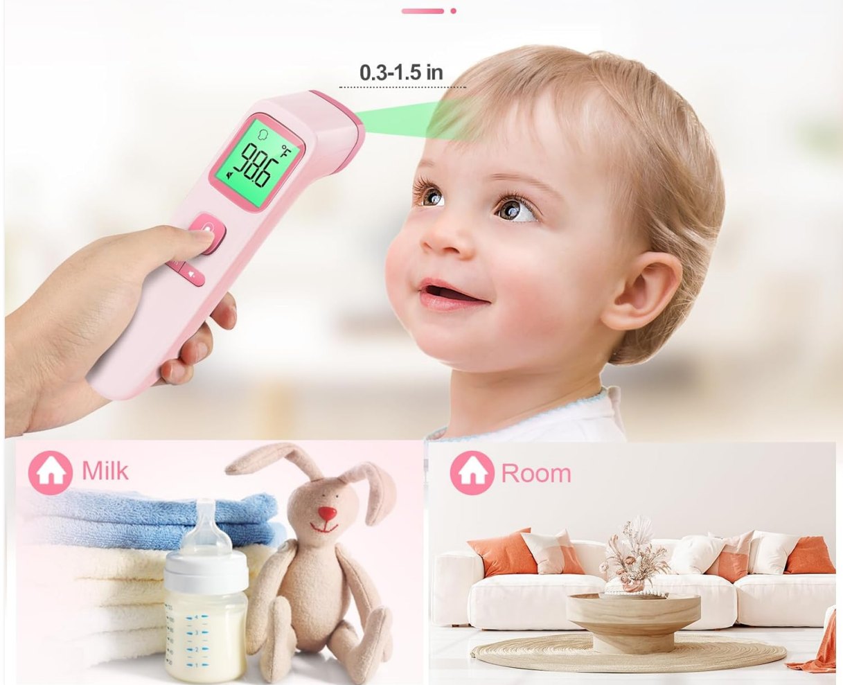
Figure 2: Measuring forehead temperature on a child.