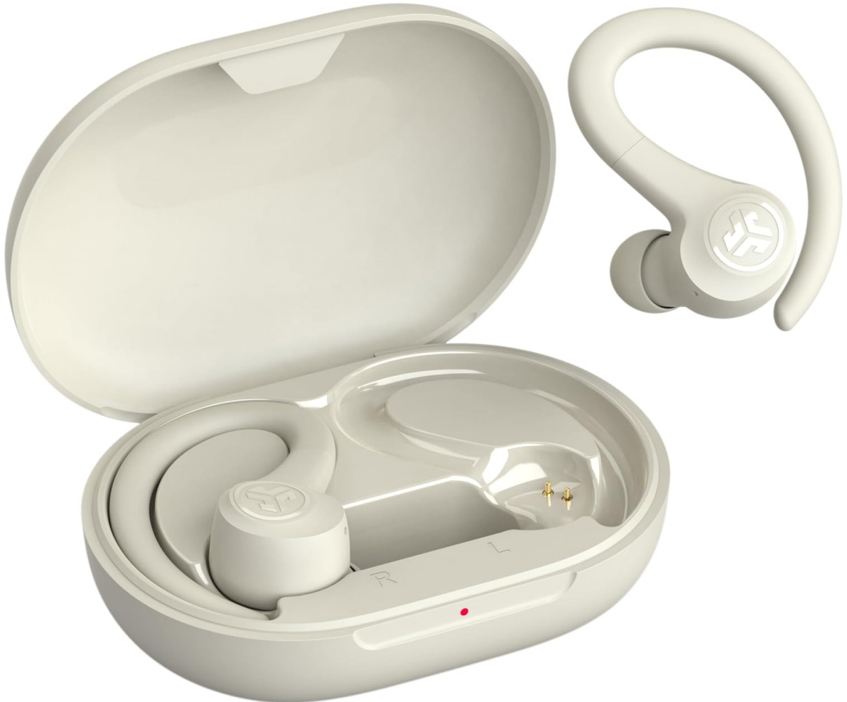
Image: The JLab Go Sport+ earbuds nestled in their charging case, showcasing the integrated USB-C charging cable for convenience.

The earbuds offer 9+ hours of playtime per earbud, with an additional 26+ hours from the charging case, totaling over 35 hours. Return the earbuds to the case to recharge. The integrated USB-C cable allows for convenient charging of the case.