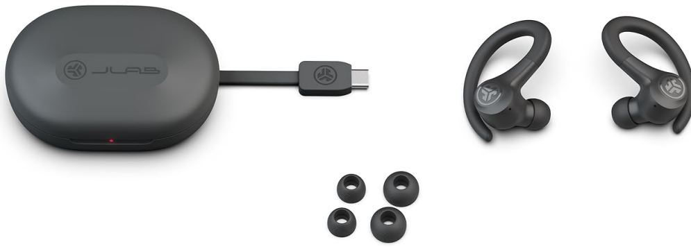
Image: The JLab Go Sport+ package contents, showing the earbuds, charging case with integrated cable, and various eartip sizes.