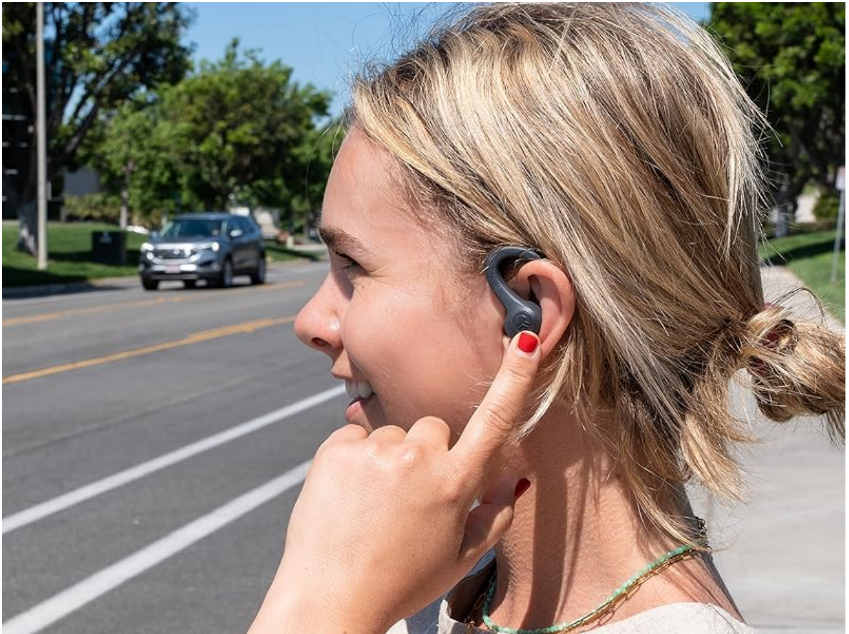
Image: A woman wearing JLab Go Sport+ earbuds while playing tennis, demonstrating the utility of Be Aware Mode for situational awareness.