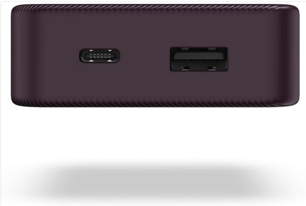
Figure 3: Close-up of the side of the power bank, detailing the USB-C input/output port and the USB-A output port.

The power bank features two output ports: one USB-C and one USB-A, allowing for versatile device charging. An integrated LED display indicates the remaining power level.