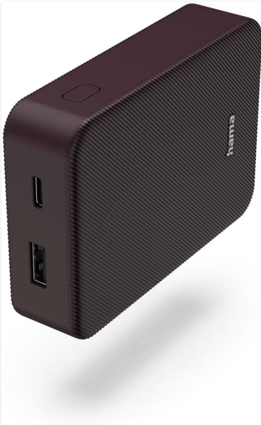
Figure 1: Front view of the Hama Colour 10 Power Pack, highlighting its compact design and the two output ports.