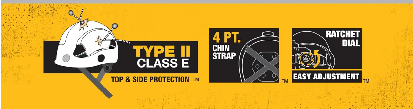
Figure 1: Key Features of the DEWALT DPG22 Type II Safety Helmet.

Your browser does not support the video tag.