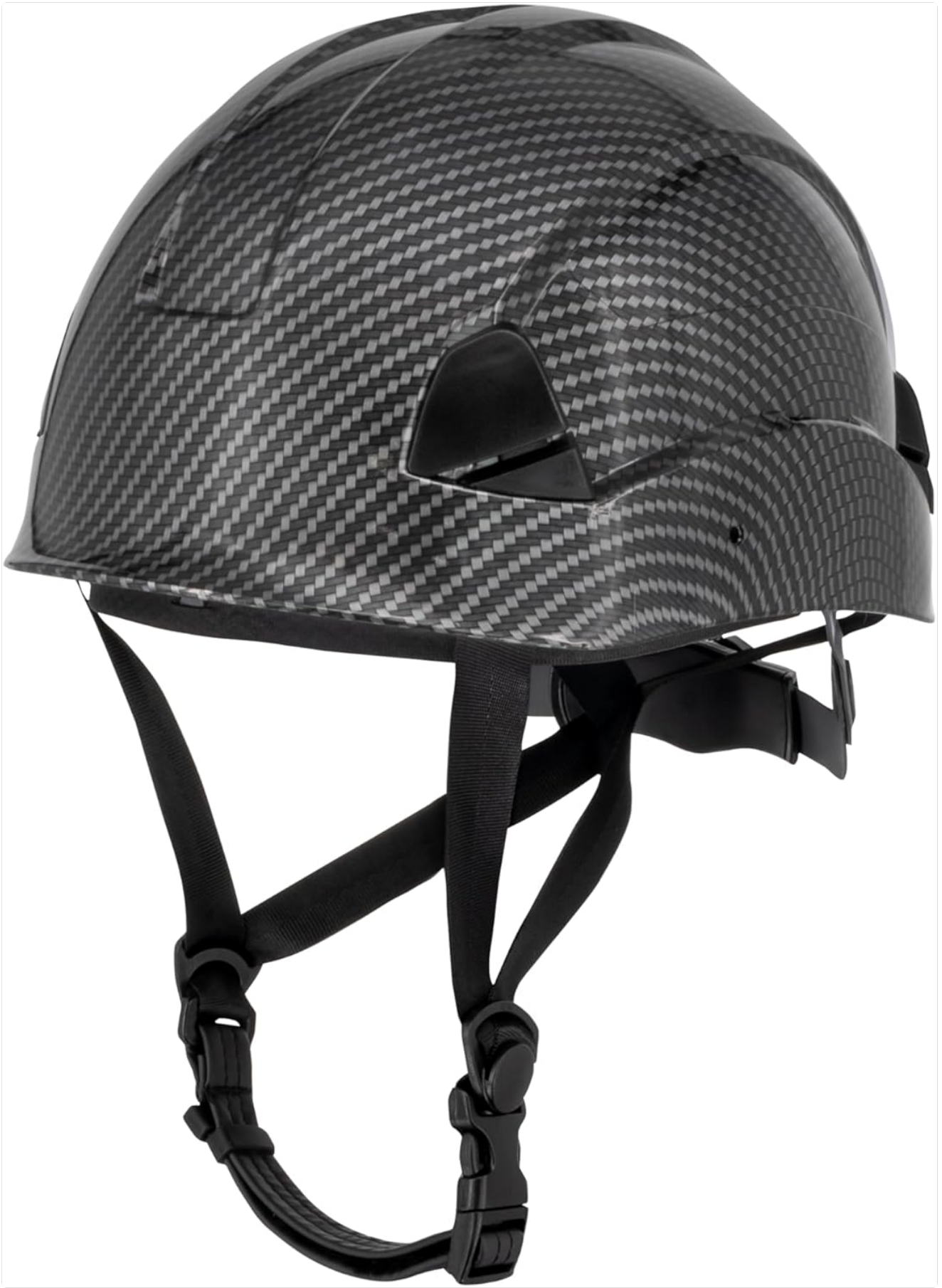
Figure 4: DEWALT DPG22 Type II Safety Helmet.