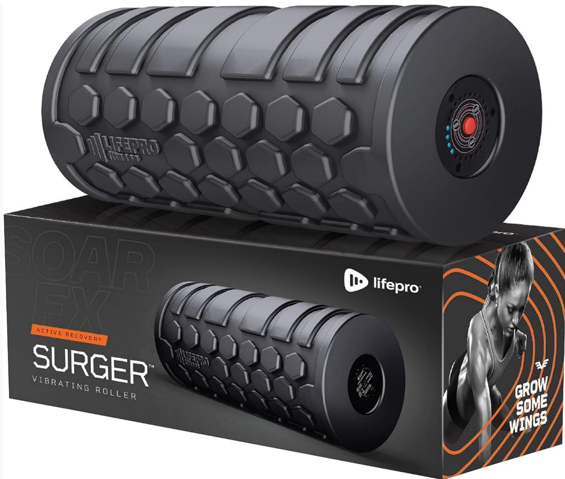
Image: The Lifepro Surge Vibrating Foam Roller shown with its product packaging.