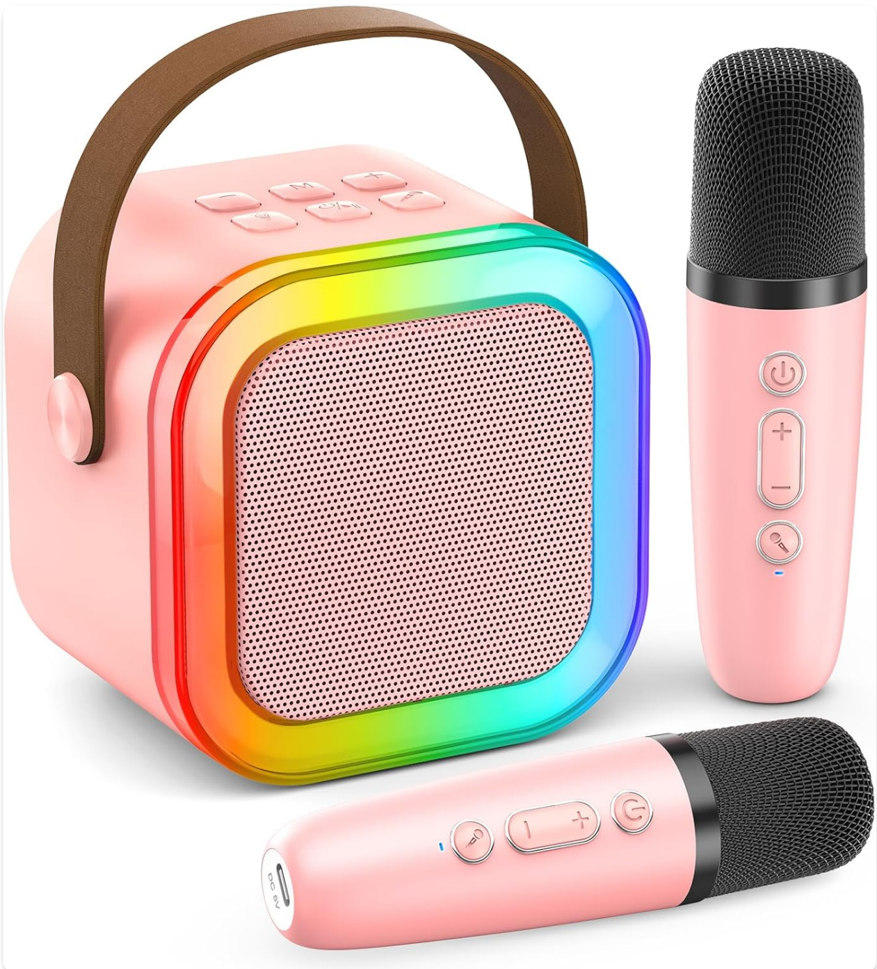
The Peski Portable Bluetooth Mini Karaoke Machine in pink, accompanied by its two wireless microphones.