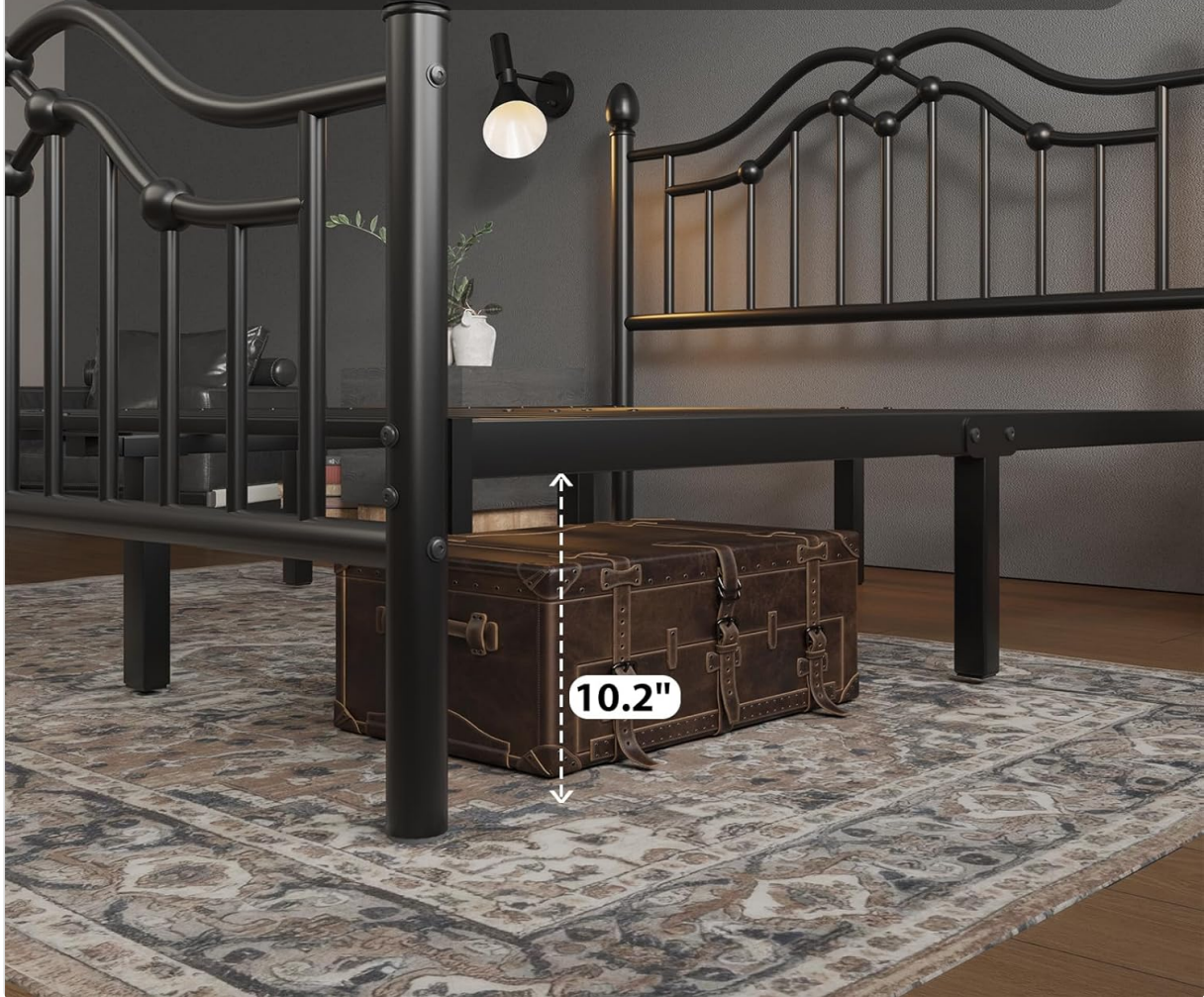
Image: A view of the under-bed clearance, showing a storage trunk fitting comfortably beneath the frame.

10.2 inches for storage and dust cleaning.