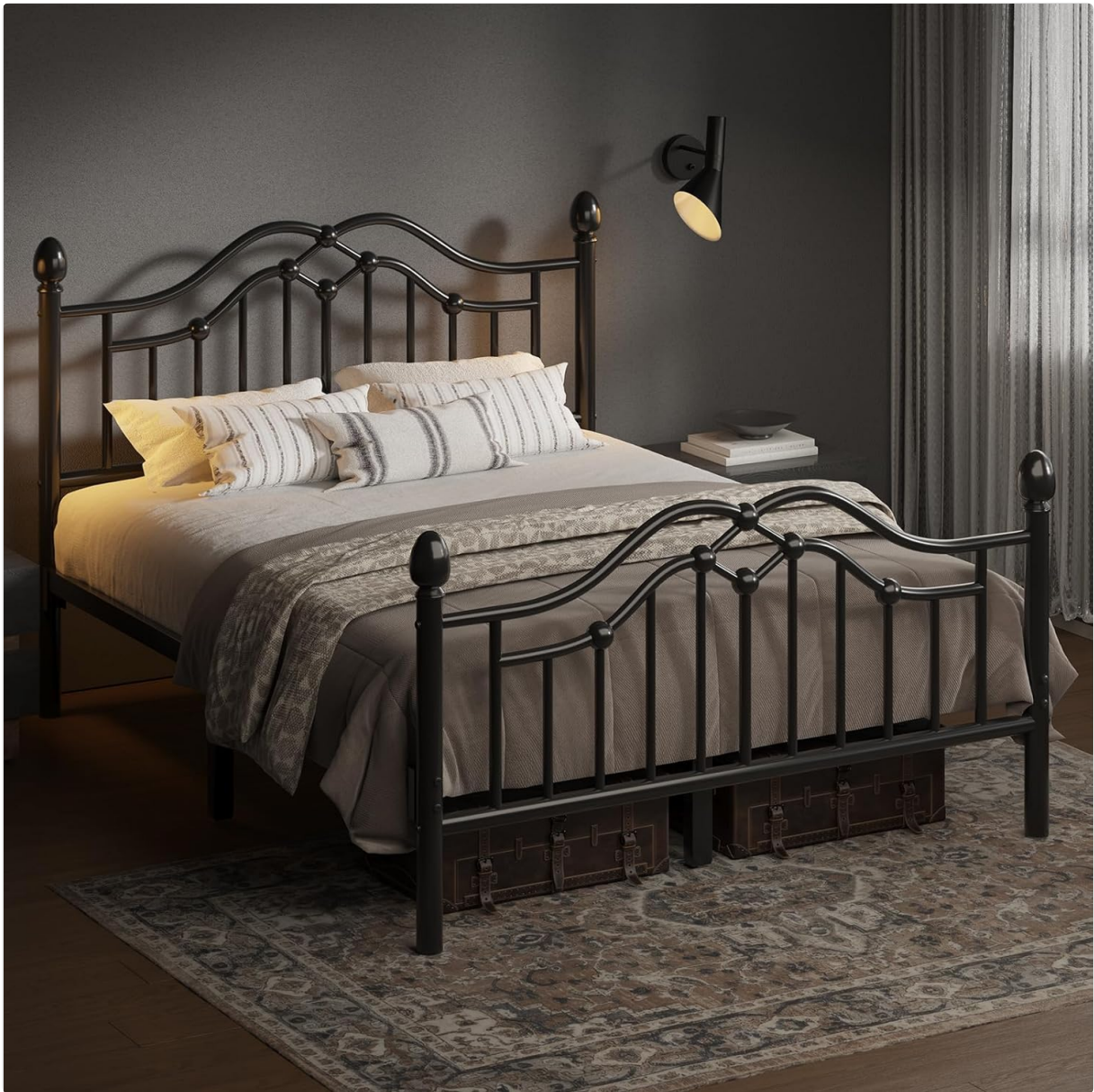
Image: The LOEWAY Full Metal Bed Frame fully assembled with a mattress and bedding, ready for use.