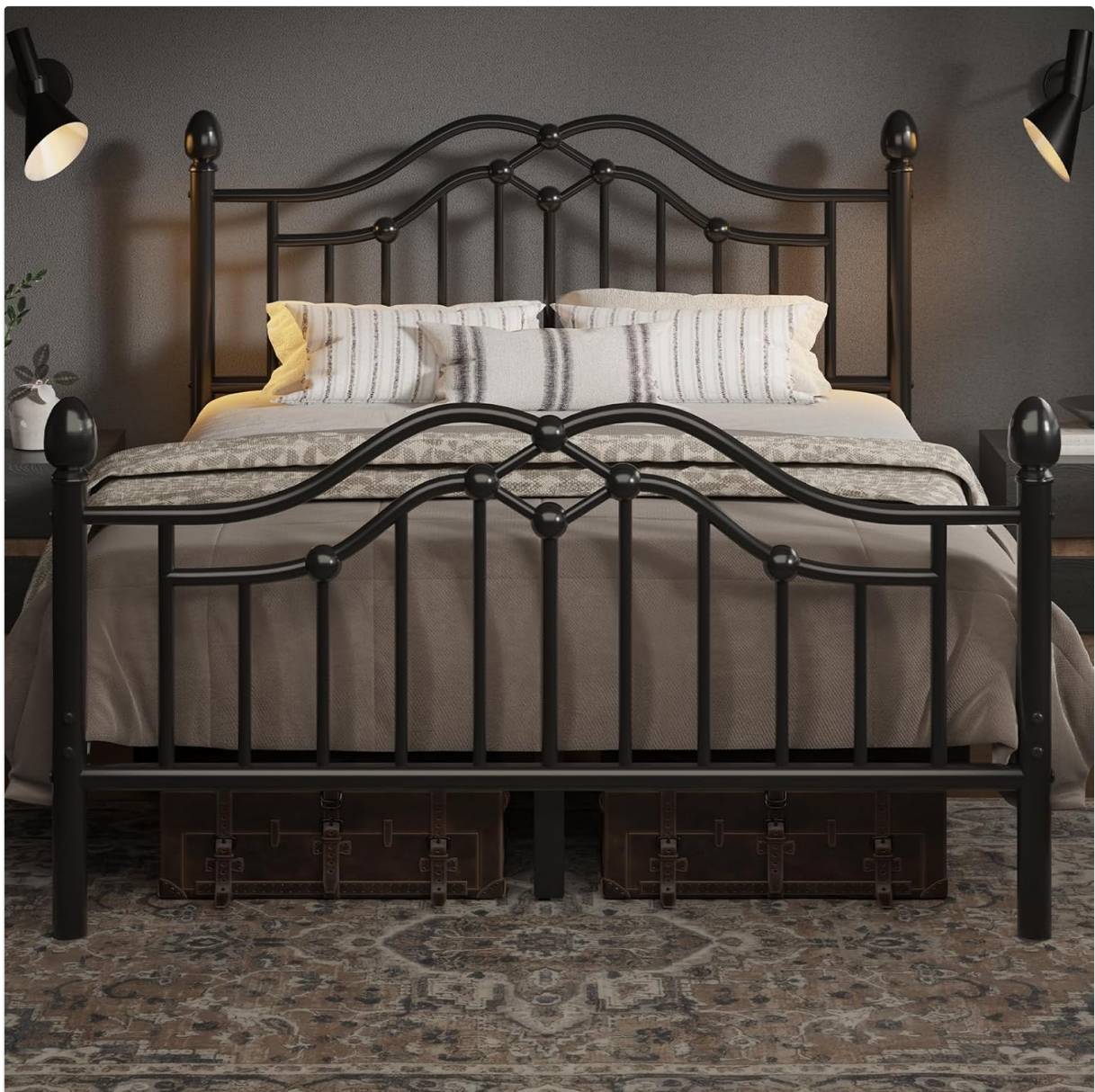
Image: Fully assembled bed frame, showing the connection points for the headboard, footboard, and side rails.

Connect the side rails to the headboard and footboard using the provided screws and washers. Ensure all connections are finger-tightened initially, then fully tighten once the frame is upright.