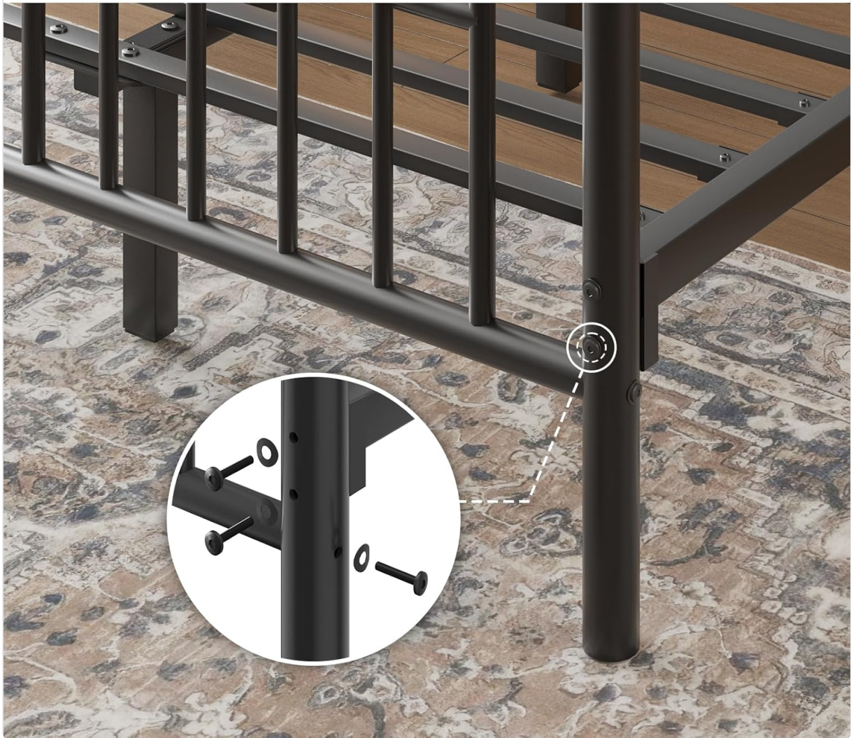
Image: Close-up view of a screw connection with a washer, demonstrating the anti-squeak design.