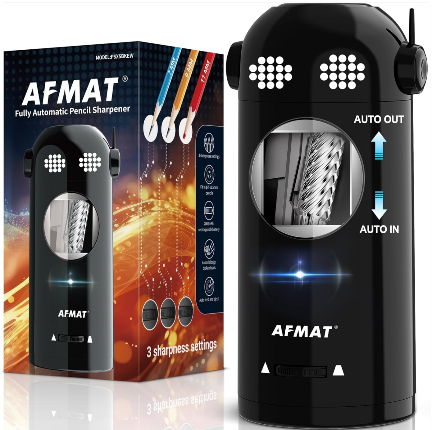
Image: The AFMAT Electric Pencil Sharpener shown alongside its retail packaging, highlighting the product's design and included USB-C cable.