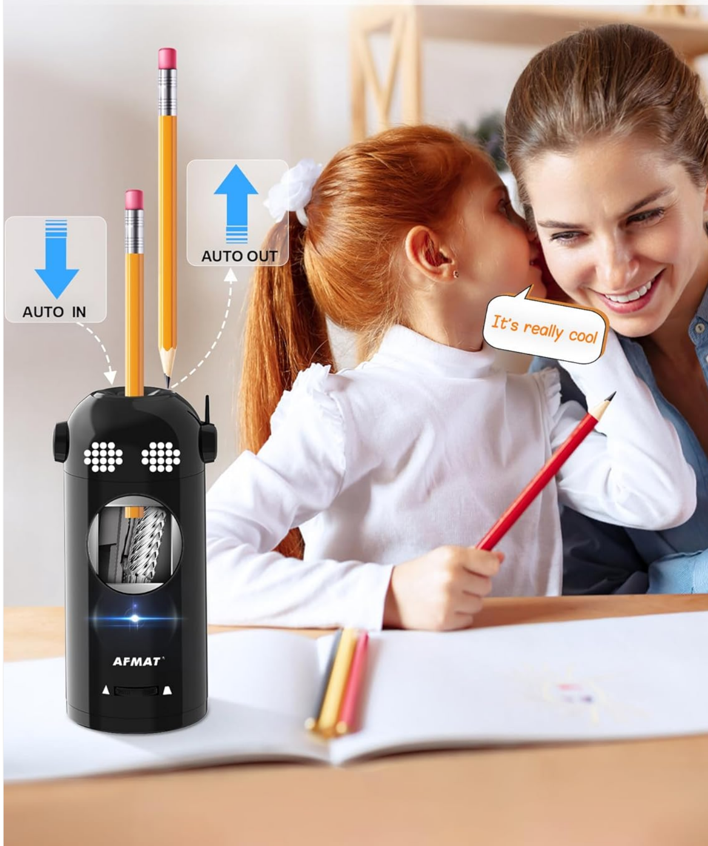
Image: A visual representation of the sharpener's fully automatic function, illustrating how pencils are automatically fed in ("AUTO IN") and ejected ("AUTO OUT") once sharpened.