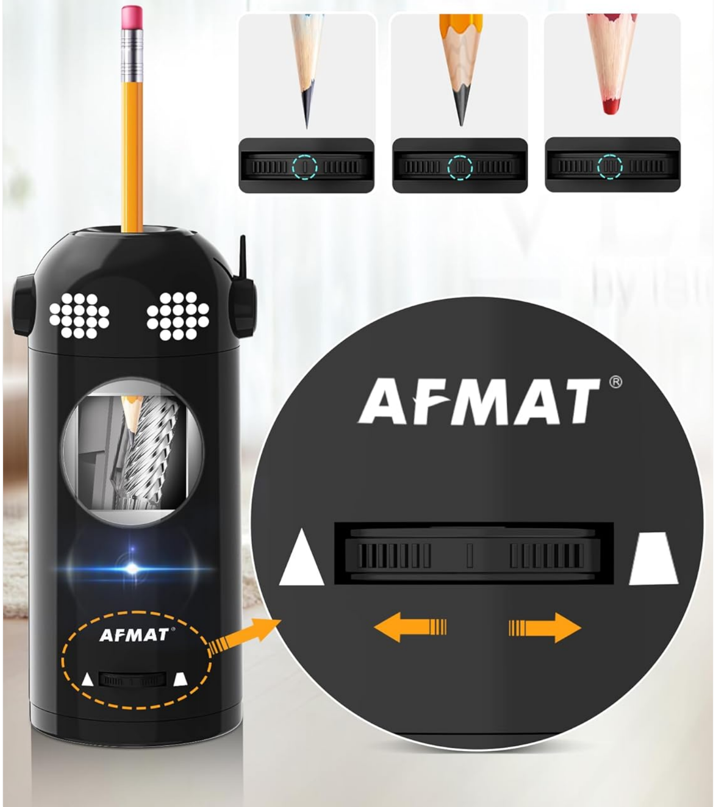
Image: A visual guide showing the three distinct sharpness outcomes (sharp, medium, blunt) and how to adjust the setting using the slider on the sharpener's front.

Note: For soft core pencils, it is recommended to use the medium or blunt tip setting to prevent tip breakage.