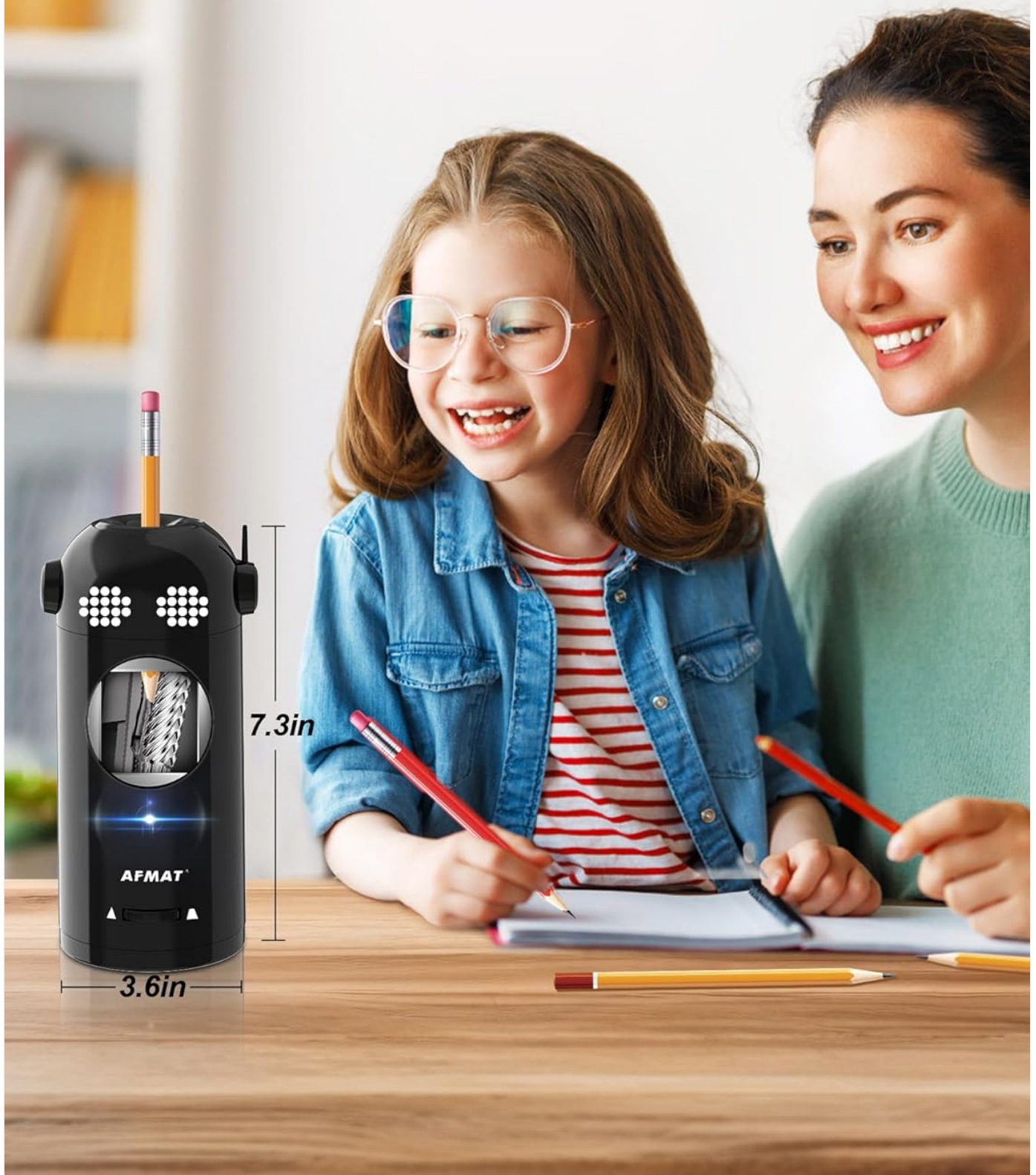
Image: The AFMAT sharpener displayed with its dimensions (3.6 inches width, 7.3 inches height), highlighting its space-saving and adorable design.