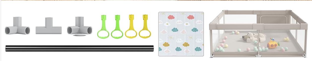
Image: All components of the Fodoss Baby Playpen, including the frame pieces, connectors, fabric enclosure, and playmat.