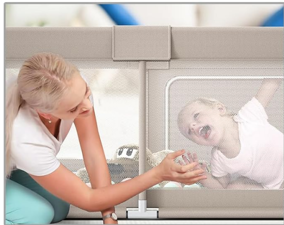
360° mesh, interact with baby at any time