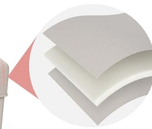
Soft cloth cover cushioning any pain

Image: Demonstrates the playpen's stability against climbing, the 360-degree mesh for interaction, and the soft cloth cover for cushioning.