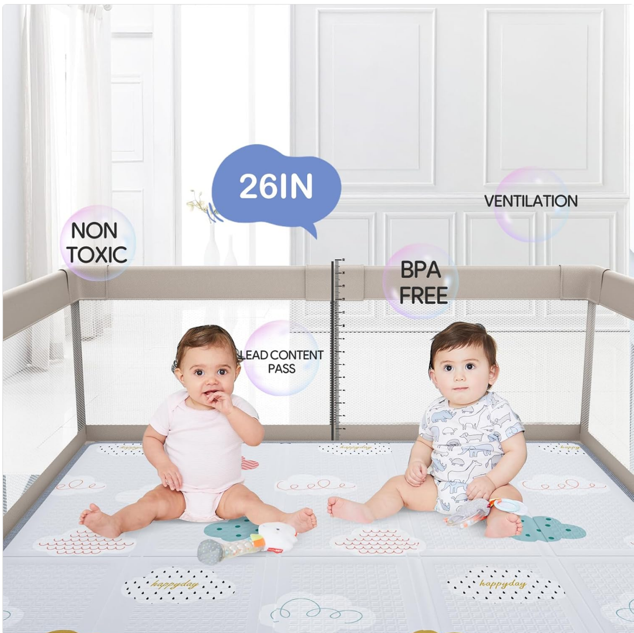
Image: Two babies playing inside the Fodoss Baby Playpen, demonstrating the safe height and non-toxic materials.