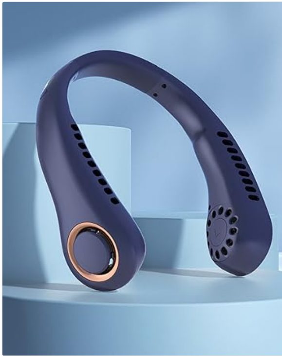
Image: A fan operating quietly in a bedroom setting, emphasizing its low noise level.