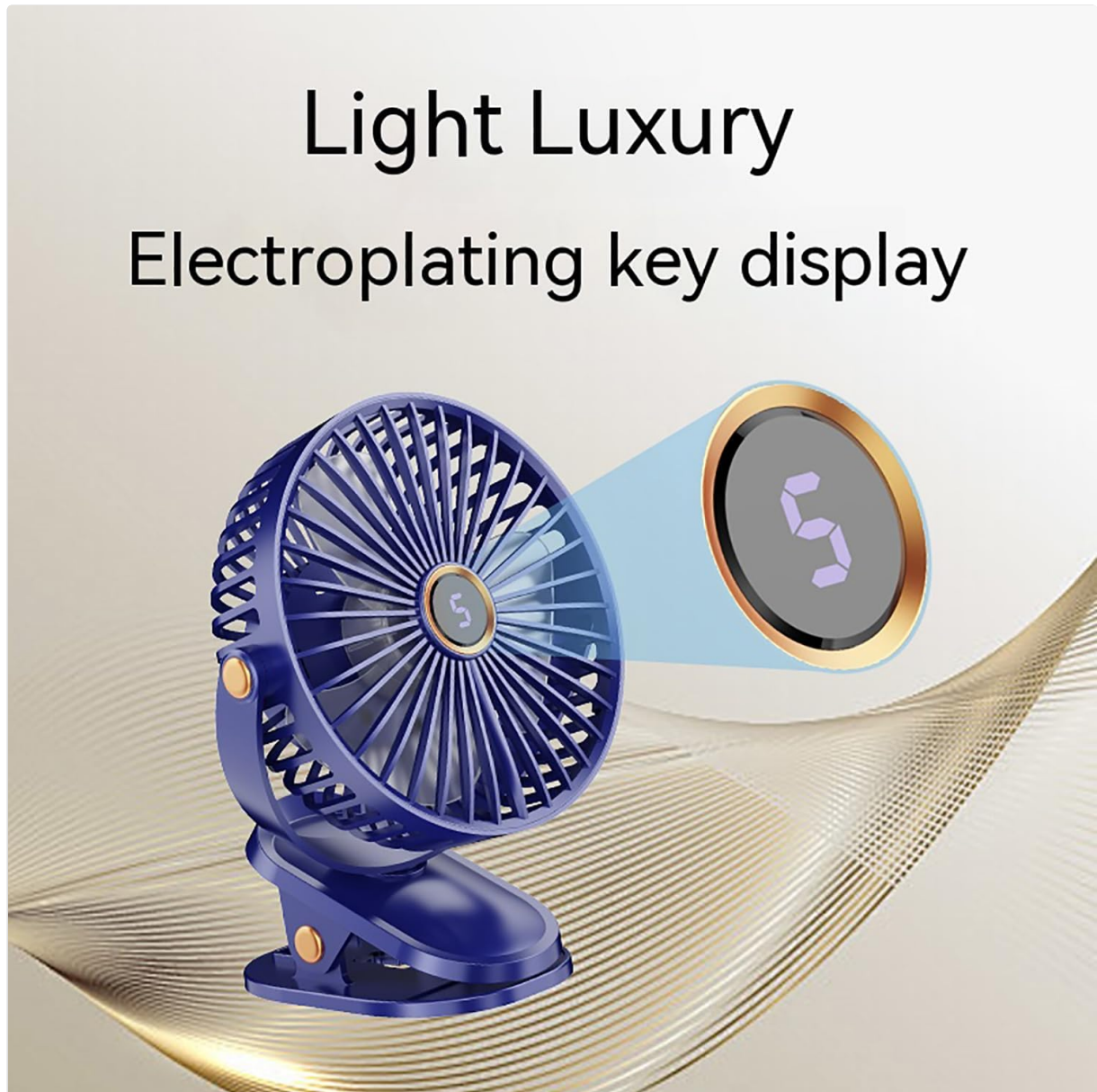
Image: The fan's digital display showing the current speed setting, indicating its 5-speed capability.