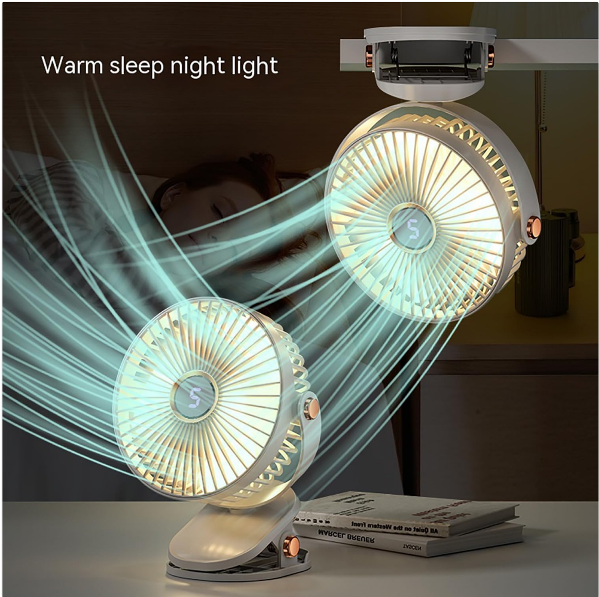
Image: Front view of the AbuDodo J5Pro Portable Clip-on Fan, showcasing its compact design and fan blades.