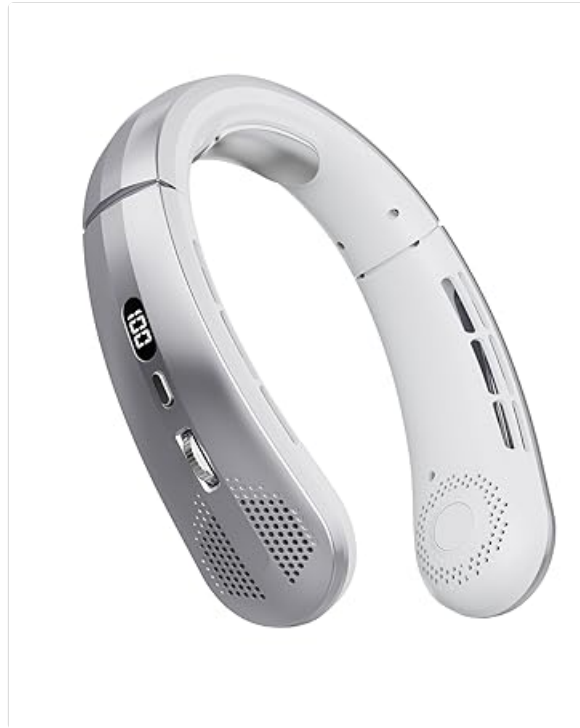
Image: The fan displaying a battery icon with a charging animation, indicating the battery is being recharged.

Before first use, fully charge the fan. Connect the provided USB charging cable to the fan's charging port and a suitable USB power source (e.g., computer, wall adapter). The charging indicator will show the charging status.