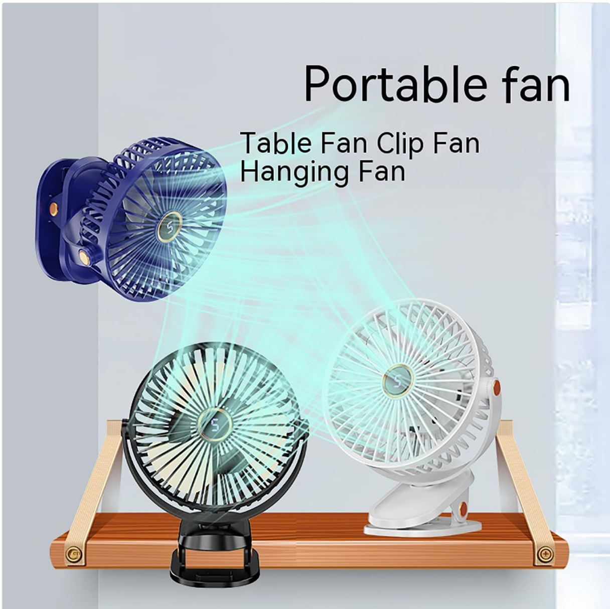
Image: The fan head rotated to different angles, illustrating its 360-degree rotation capability.