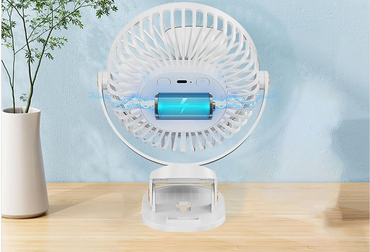
Image: The fan operating with its integrated LED light turned on, providing illumination.