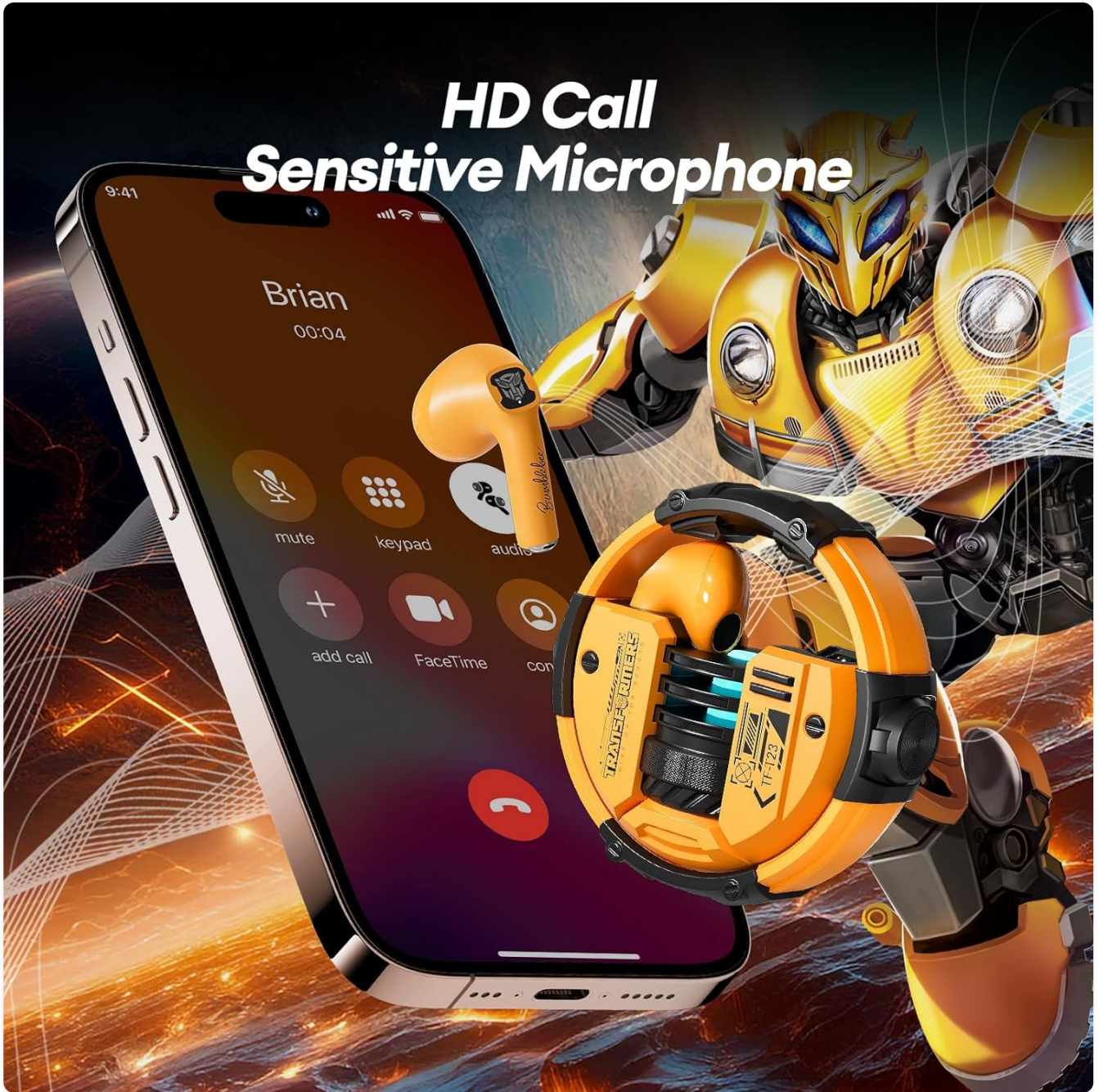
Figure 2.4: The ergonomic design of the TF-T23 earbuds ensures a comfortable and secure fit for extended wear.