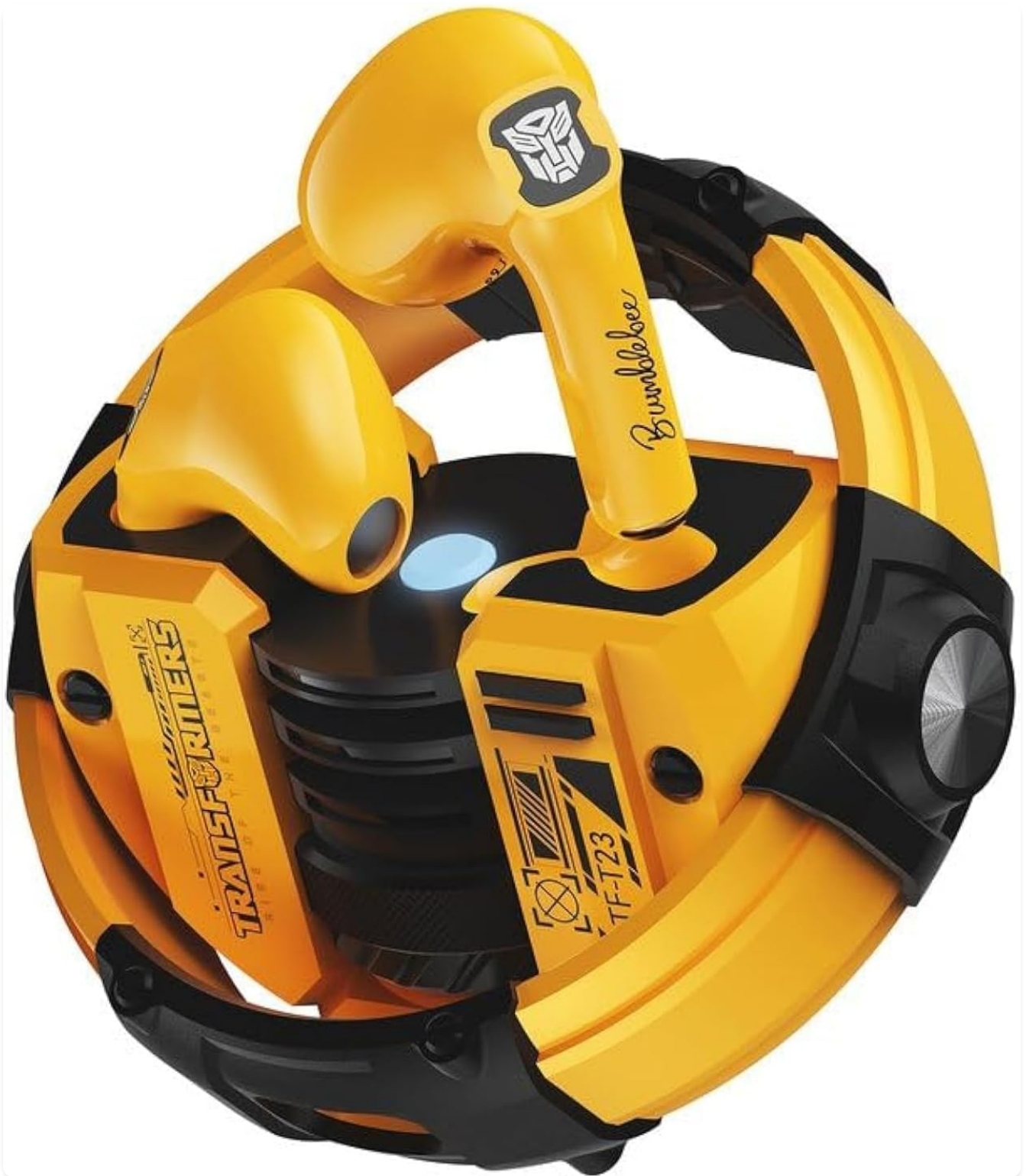
Figure 2.1: TF-T23 Earbuds and Charging Case. The earbuds are yellow and black, designed with a Transformers theme, specifically resembling Bumblebee.