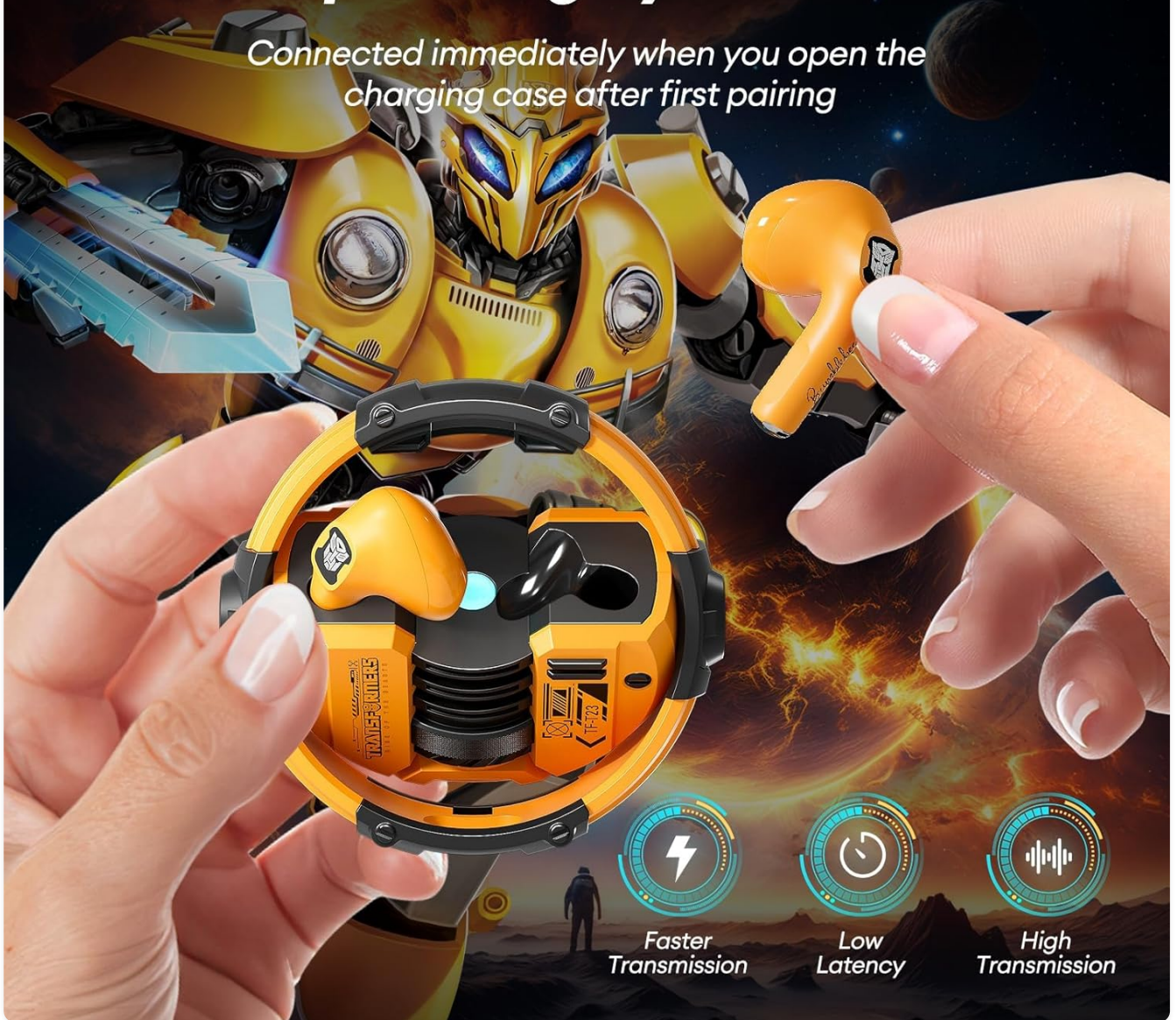
Figure 3.1: One-step Bluetooth 5.4 pairing process for quick and stable connection.

Connected immediately when you open the charging case after first pairing