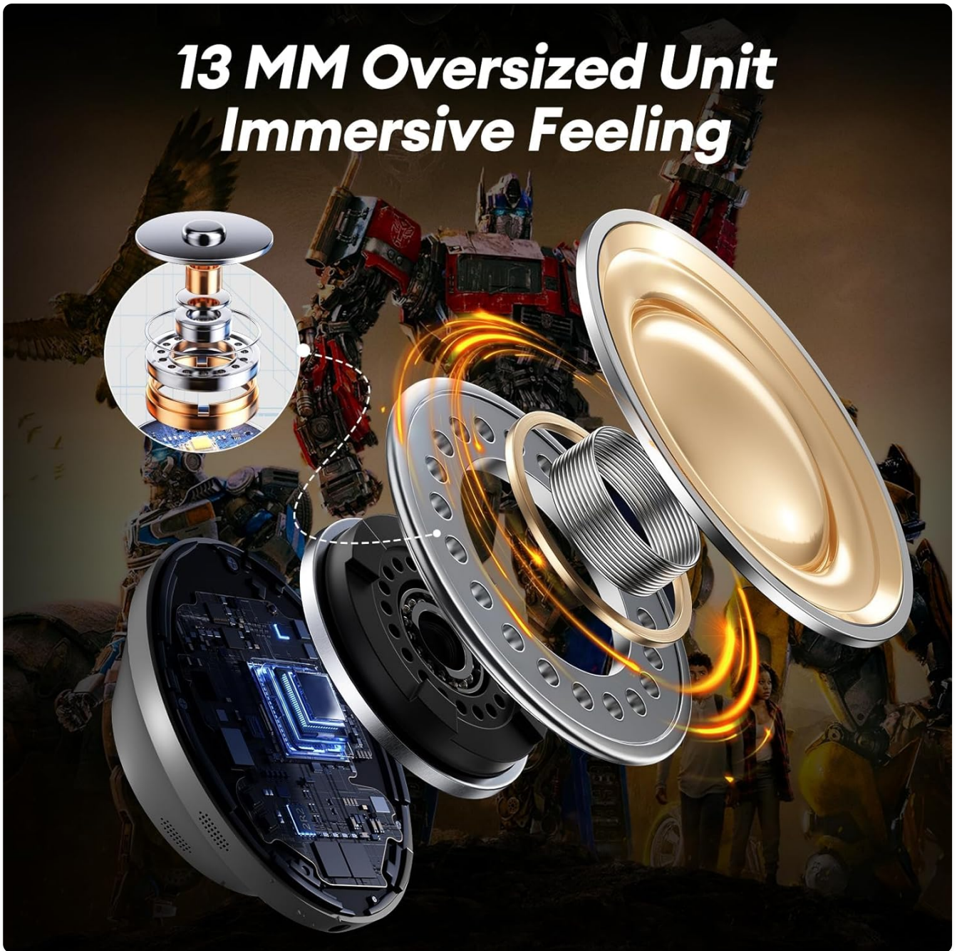
Figure 2.3: Internal structure of the earbud, featuring a 13mm oversized unit designed for immersive audio quality.