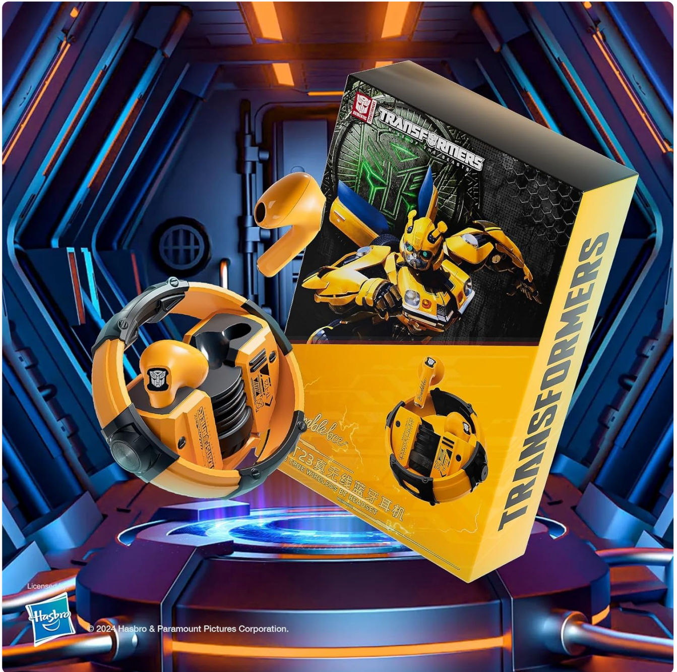
Figure 3.2: The earbuds offer 5 hours of playtime on a single charge, extended to 60 hours with the fully charged case.