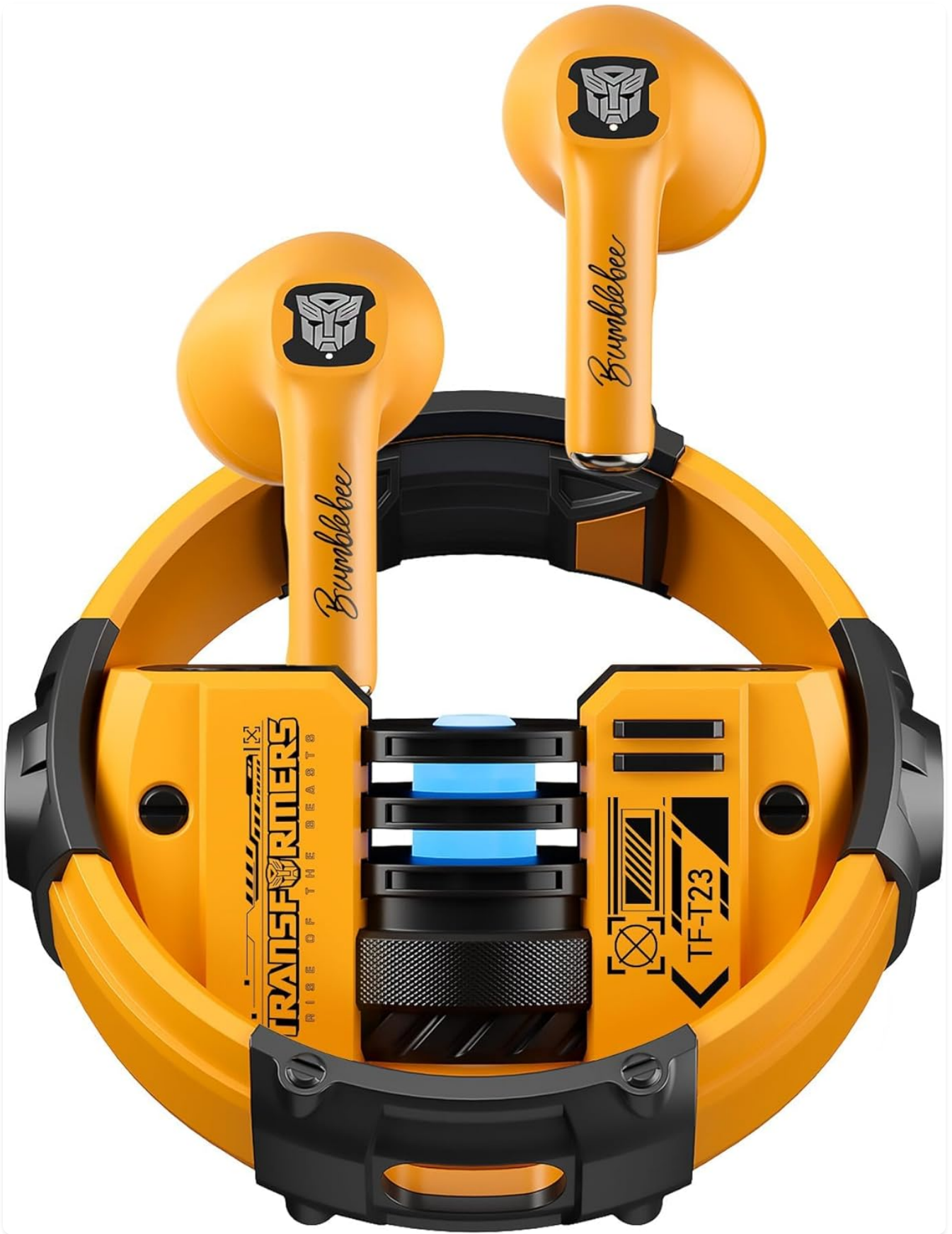
Figure 2.2: Earbuds removed from the charging case, highlighting the unique internal structure and the earbuds' design.