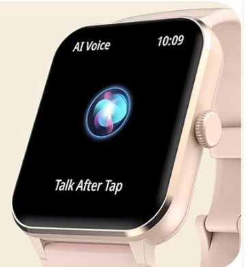
Image: Make/receive calls, notifications, and AI voice assistant.

Video: This video demonstrates various features of the smartwatch, including music control, stress testing, sleep tracking, weather display, alarm clock, sports record, multiple sports modes, fashionable and diverse dials, personalized dial design, voice assistant, and different color options. It also highlights additional functions like computer, game, find your phone, camera control, menstrual reminder, timer, stopwatch, world clock, long sitting reminder, and water reminder.