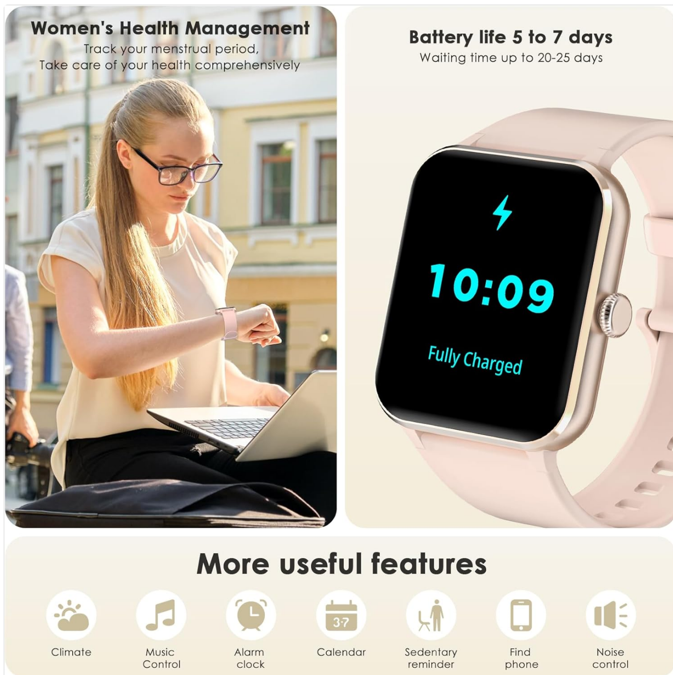
Image: Women's Health Management and additional features.