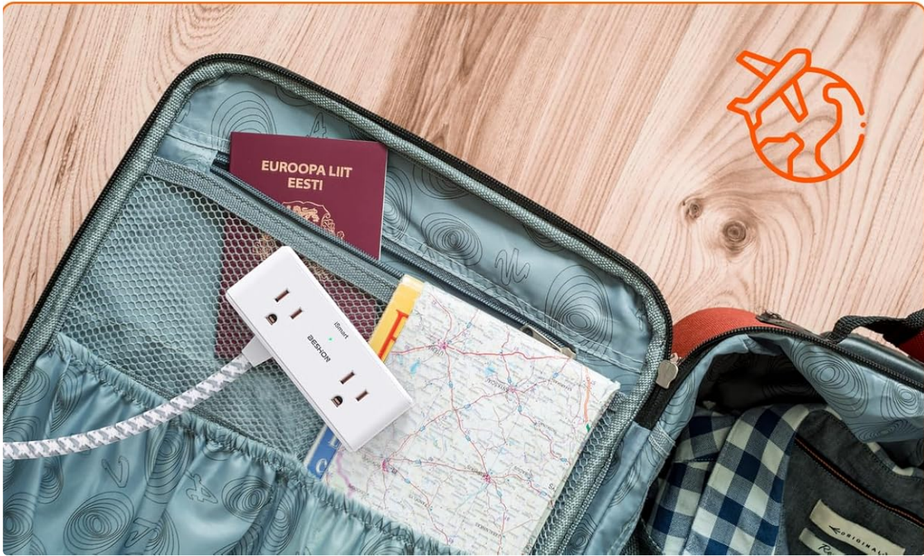
Travel-Friendly Design: Displays the compact dimensions (4.5 x 1.1 x 1.8 inches) of the power strip, highlighting its portability and suitability for travel by showing it packed in luggage.