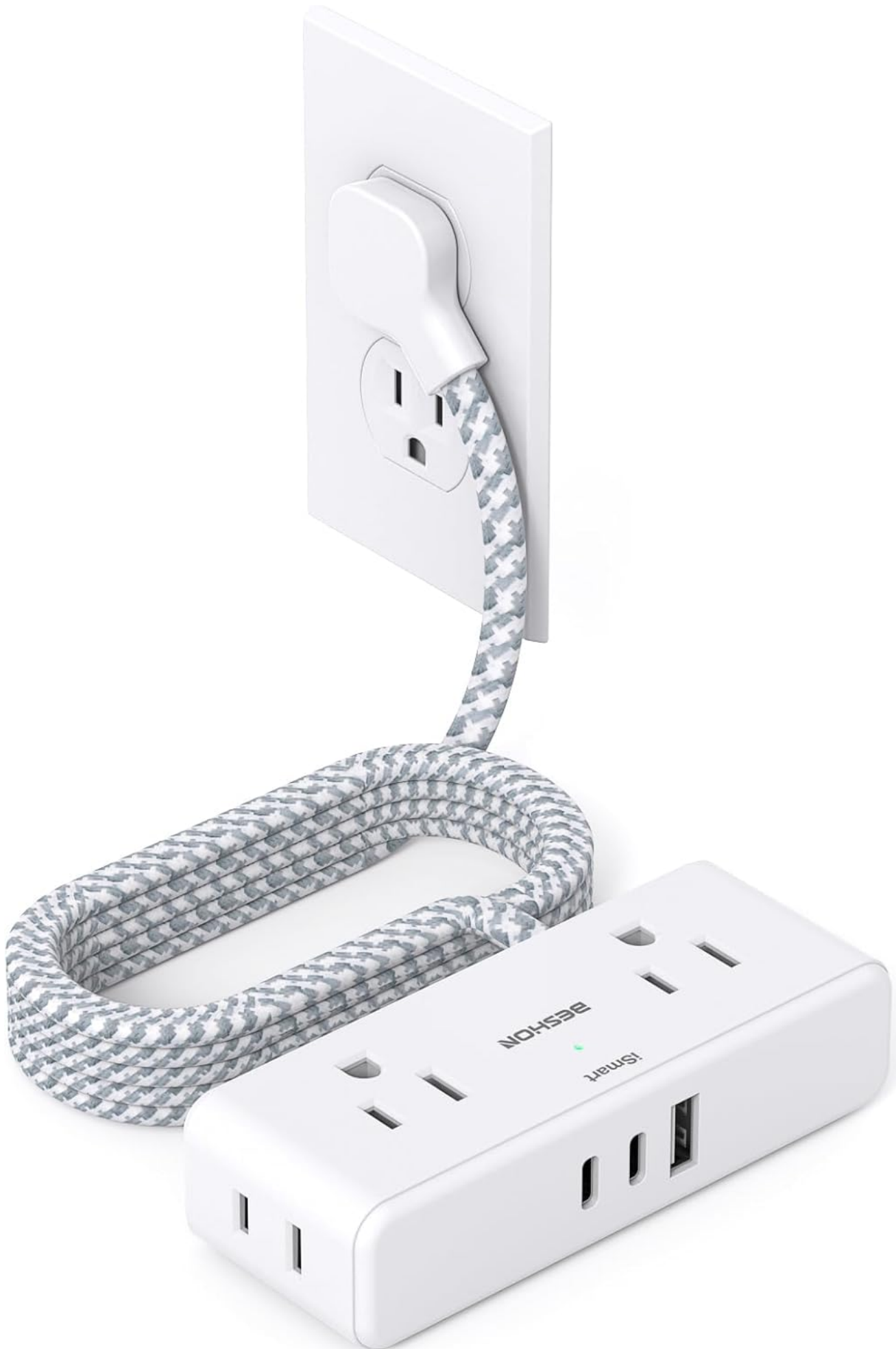
Overall Product View: A white BESHON flat extension cord power strip with a braided cord and a flat plug, shown plugged into a wall outlet.