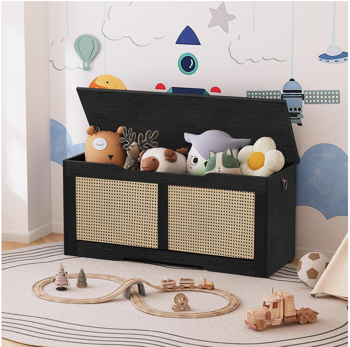
Image: The HOOBRO Storage Bench, model BB22CW01, shown in a child's room with the lid open, revealing various plush toys stored inside. The bench features a black finish and rattan-like panels.