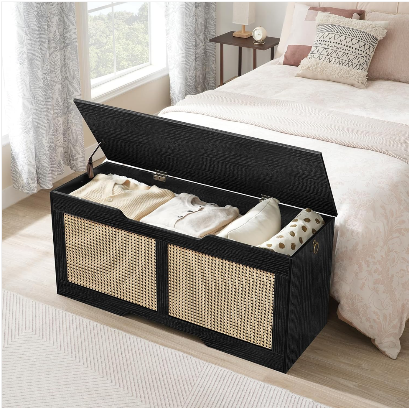
Image: The HOOBRO Storage Bench, model BB22CW01, positioned at the foot of a bed in a bedroom. The lid is open, showing folded clothes neatly stored within the spacious interior.