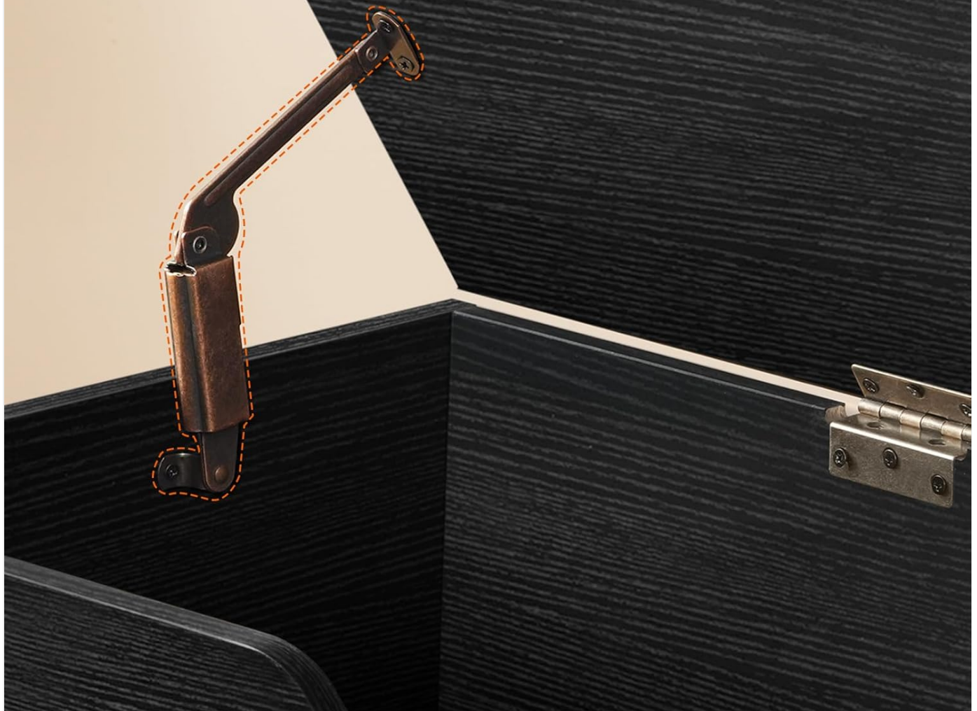
Image: A close-up view of the safety hinge mechanism on the HOOBRO Storage Bench, model BB22CW01, highlighting its design for controlled lid movement.

Enhanced security and reliability for the storage chest.