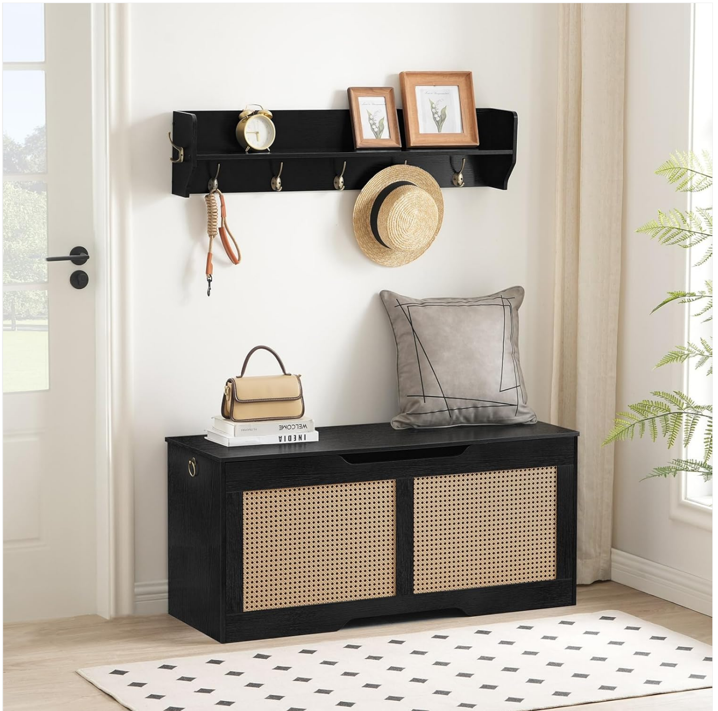
Image: The HOOBRO Storage Bench, model BB22CW01, serving as an entryway bench. A coat rack with various items hangs above it, demonstrating its versatility and functional design.