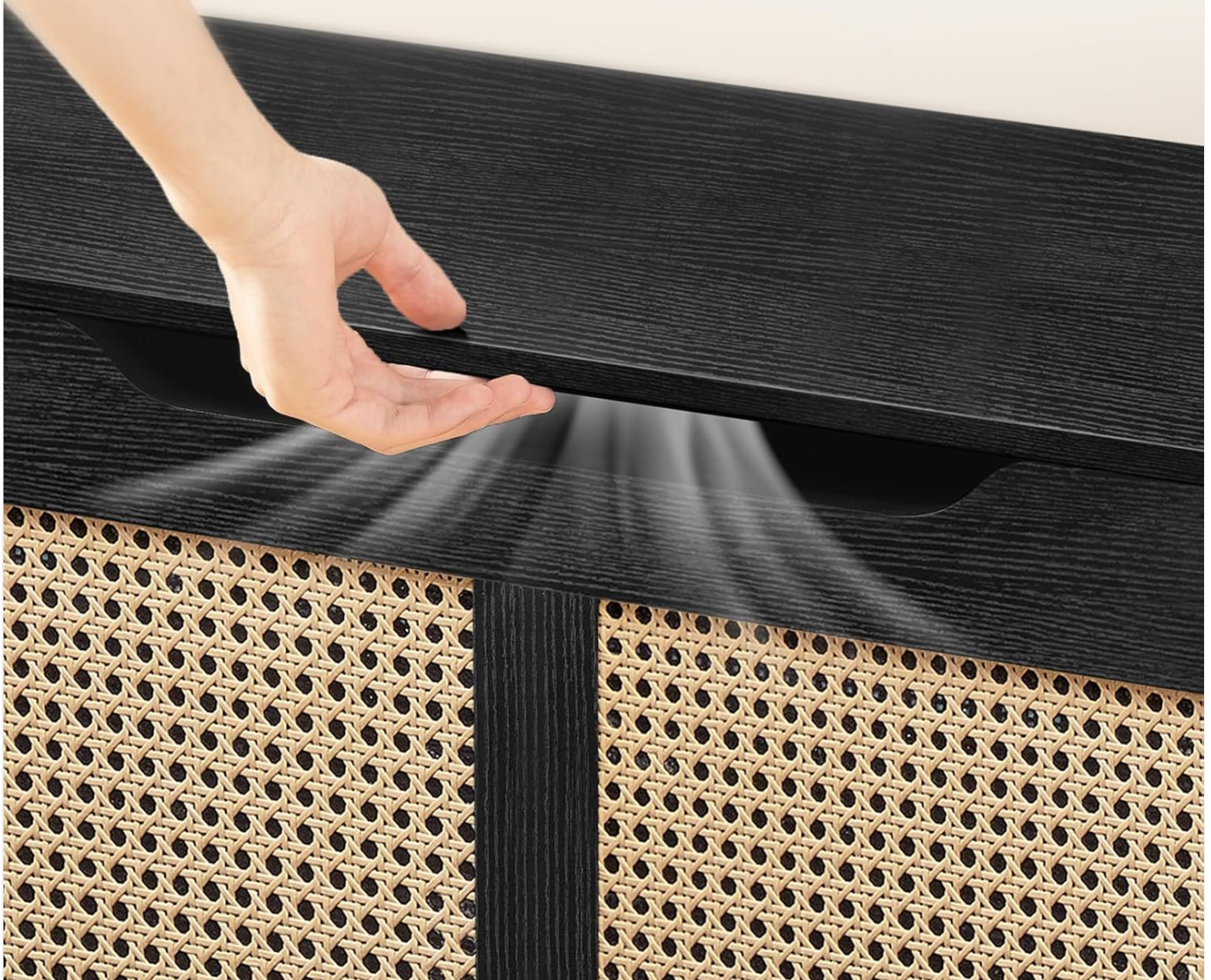
Image: A close-up of the U-shaped cutout on the lid of the HOOBRO Storage Bench, model BB22CW01, designed for effortless and safe opening and closing.

Effortless opening/closing, enhanced ventilation.