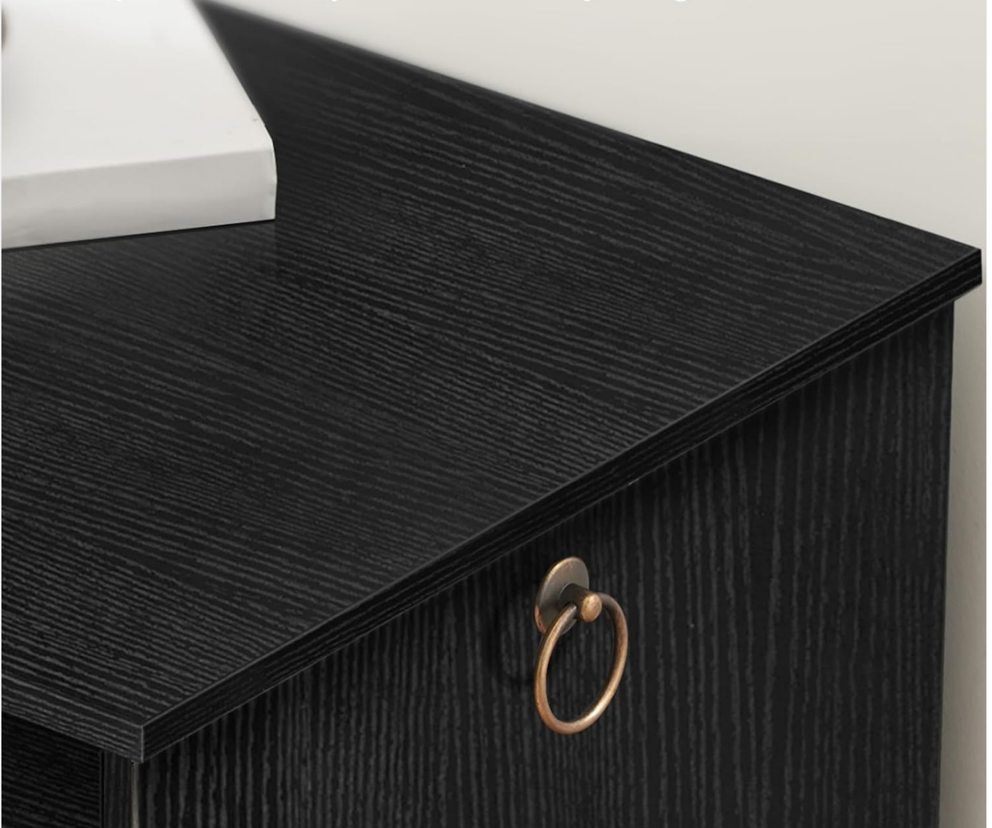
Image: A close-up view of one of the metal pull rings located on the side of the HOOBRO Storage Bench, model BB22CW01, facilitating easy movement.

Easy to move the toy box with the dual pull rings.