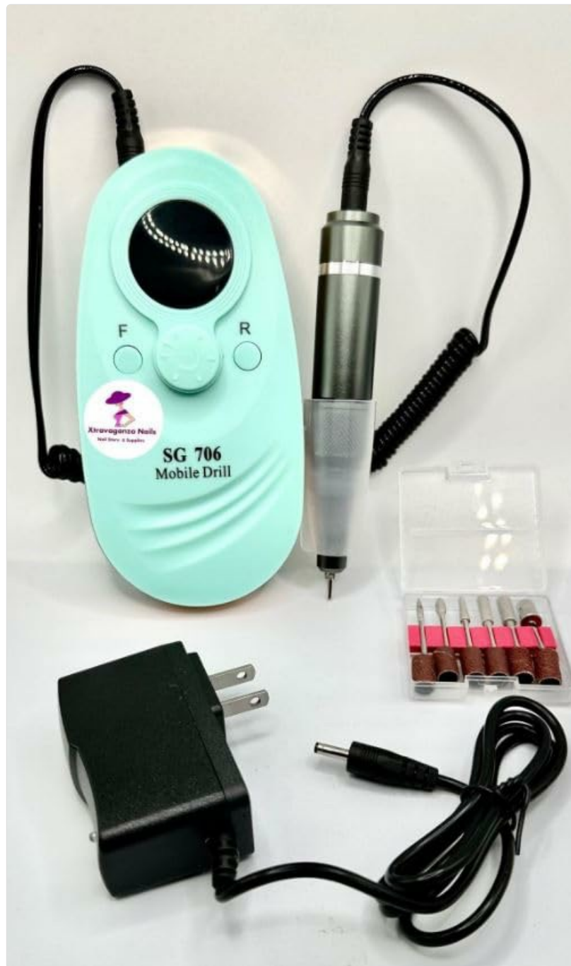
Figure 2: The SG706 Portable Nail Drill assembled with the handpiece and a selection of drill bits, illustrating the setup configuration.