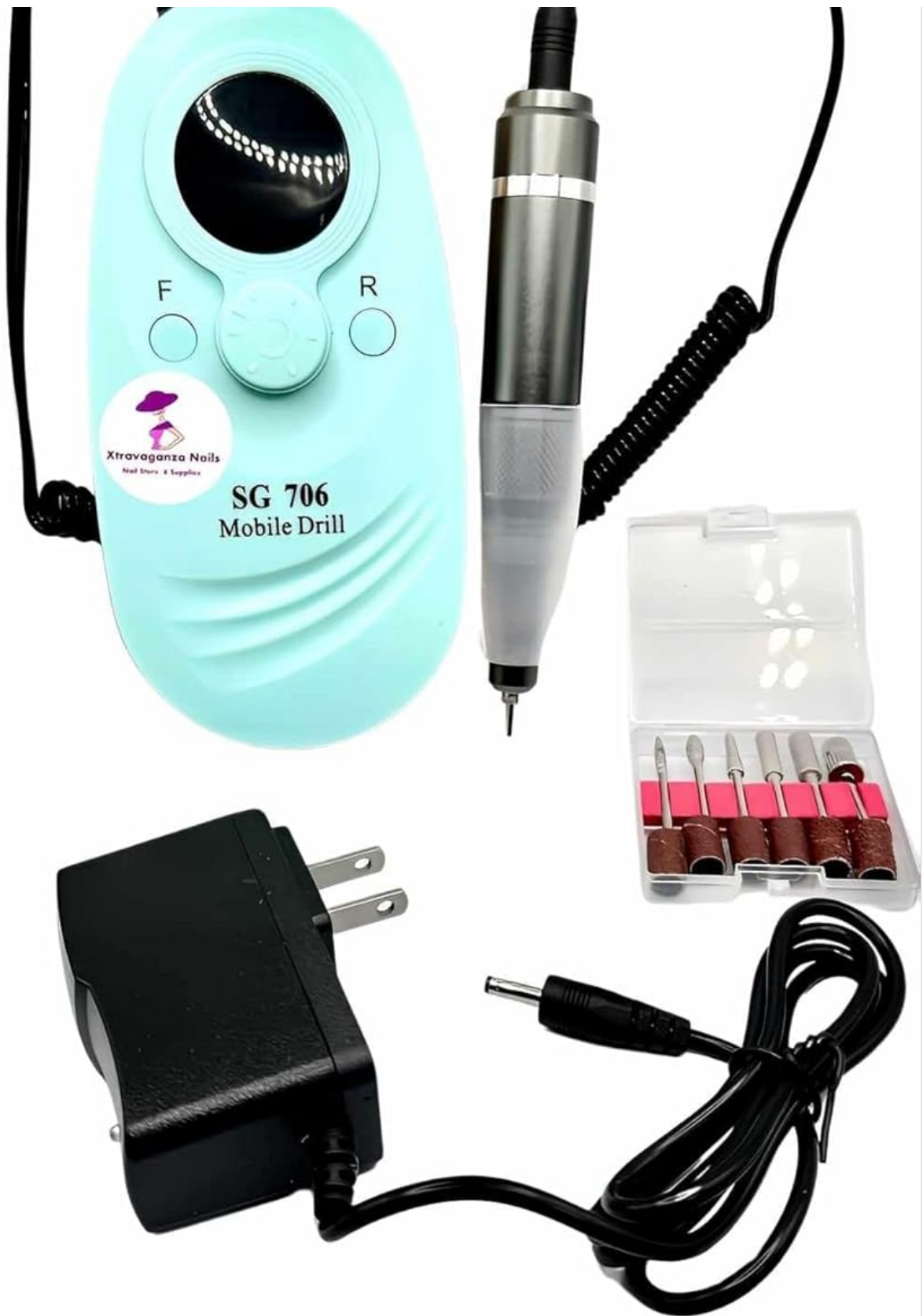
Figure 1: Contents of the Generic SG706 Portable Nail Drill package, showing the main unit, handpiece, power adapter, and a case of drill bits.