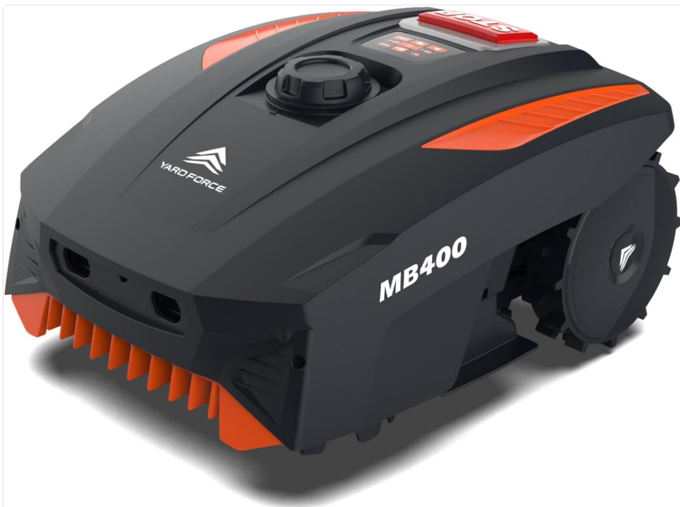
Image: The Yard Force MB400 Robotic Lawnmower, showcasing its sleek black and orange design with the Yard Force logo visible.

Thank you for choosing the Yard Force MB400 Robotic Lawnmower. This manual provides essential information for the safe and efficient operation, installation, and maintenance of your new robotic lawnmower. Please read this manual thoroughly before using the product and keep it for future reference. The MB400 is designed to provide effortless lawn care for gardens up to 400m 2 , featuring app control and a durable design.