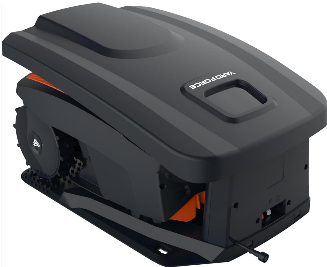
Image: The Yard Force MB400 Robotic Lawnmower positioned within its charging station, demonstrating how it docks for power.