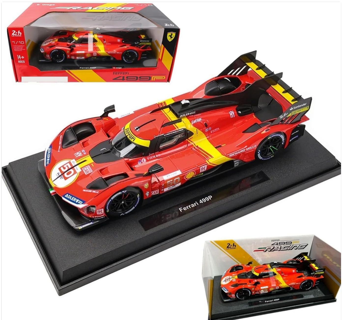
Image: The 1/18 Ferrari 499p #50 diecast model displayed with its retail packaging, showcasing the product and its presentation.