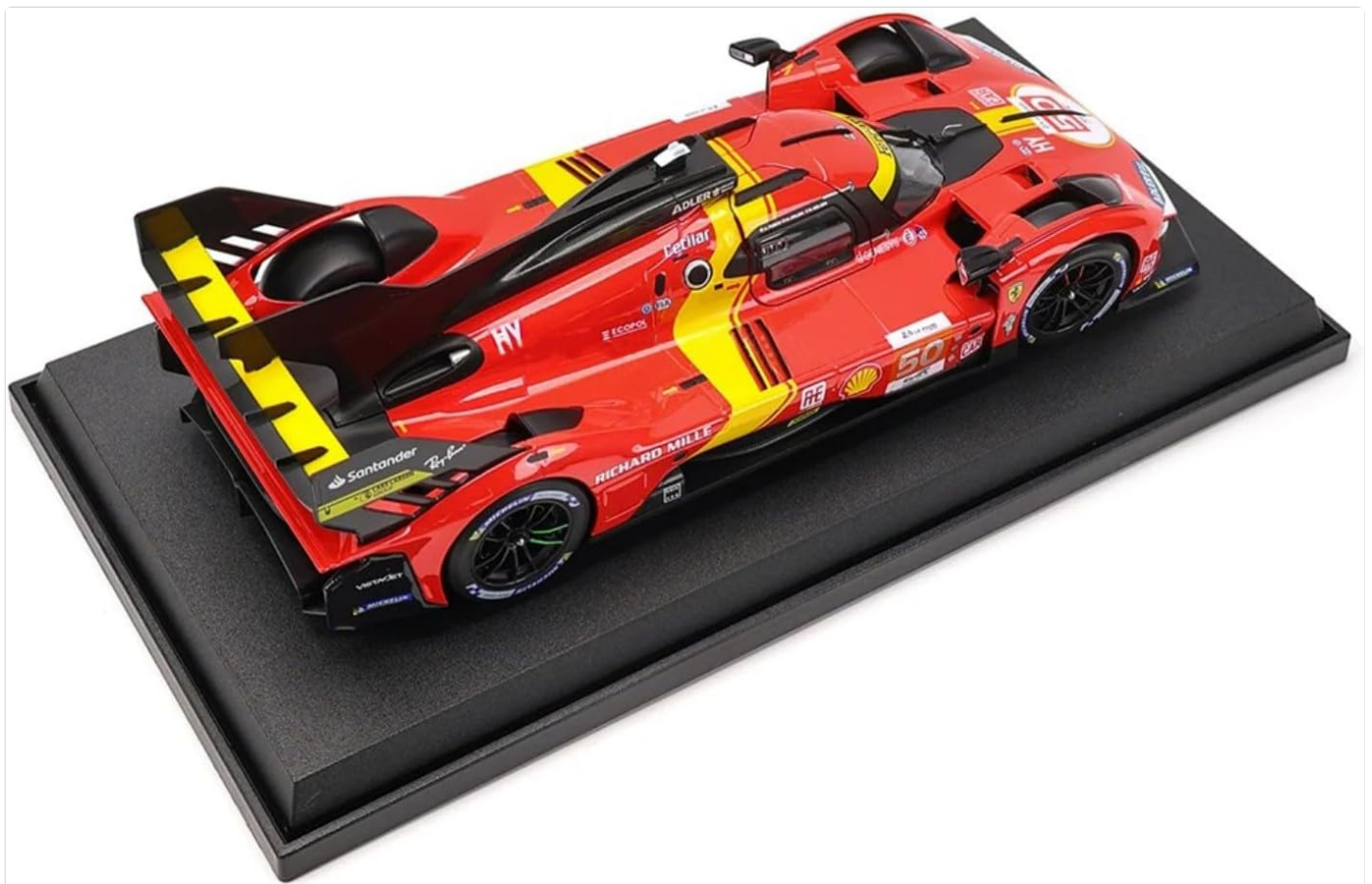
Image: A detailed rear view of the Ferrari 499p diecast model, highlighting the intricate spoiler, rear diffuser, and taillight details.