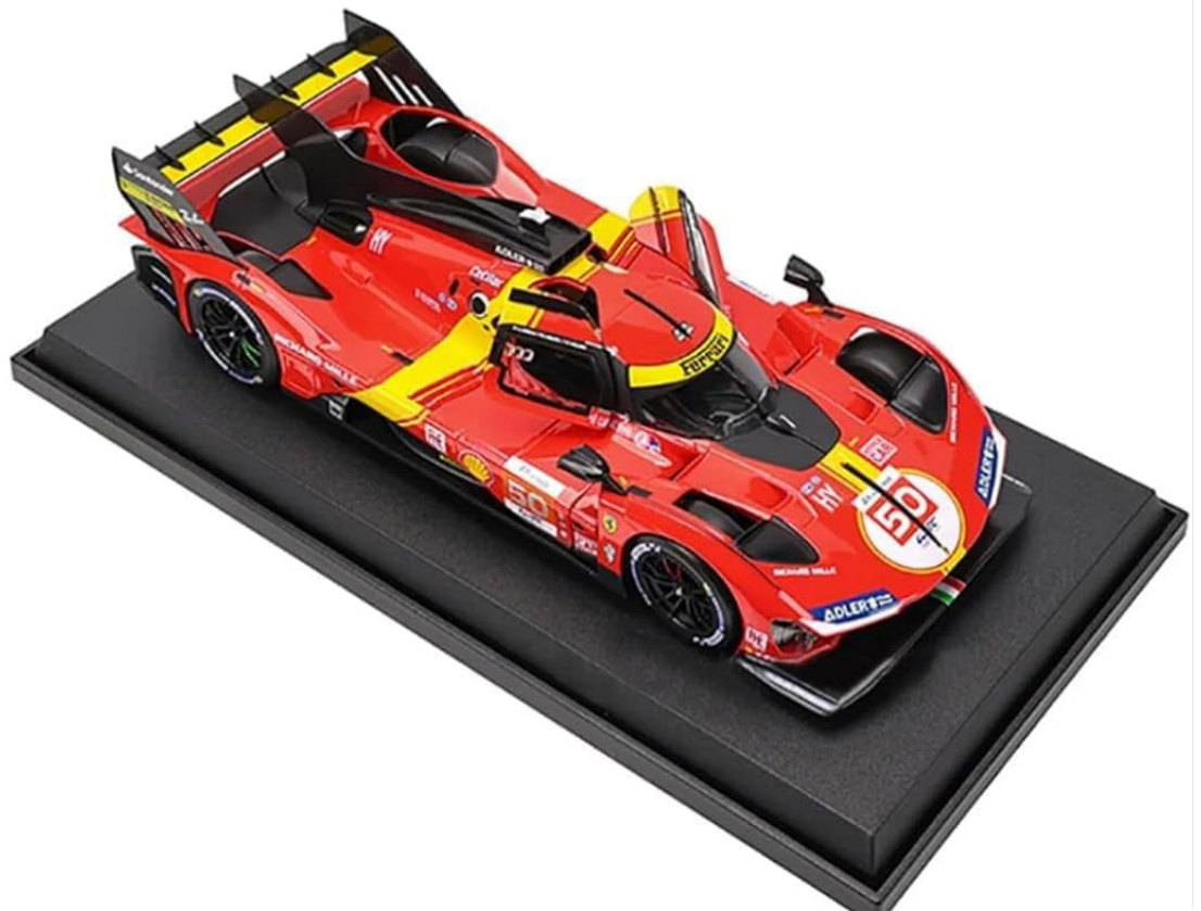
Image: A top-down and slightly angled front view of the Ferrari 499p diecast model, showcasing its sleek design and placement on the display base.