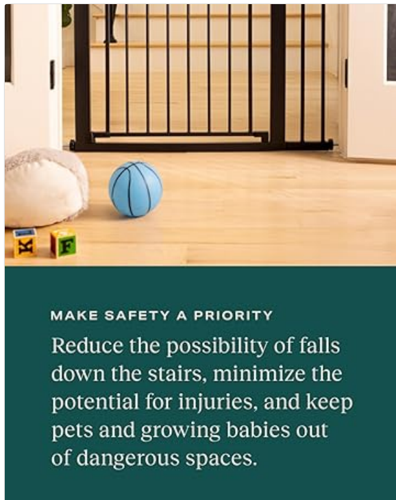
Image: Pressure-Mount with Rotating Bolt.