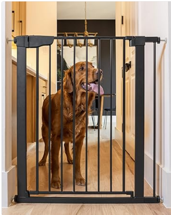
Image: Attaching wall cups.