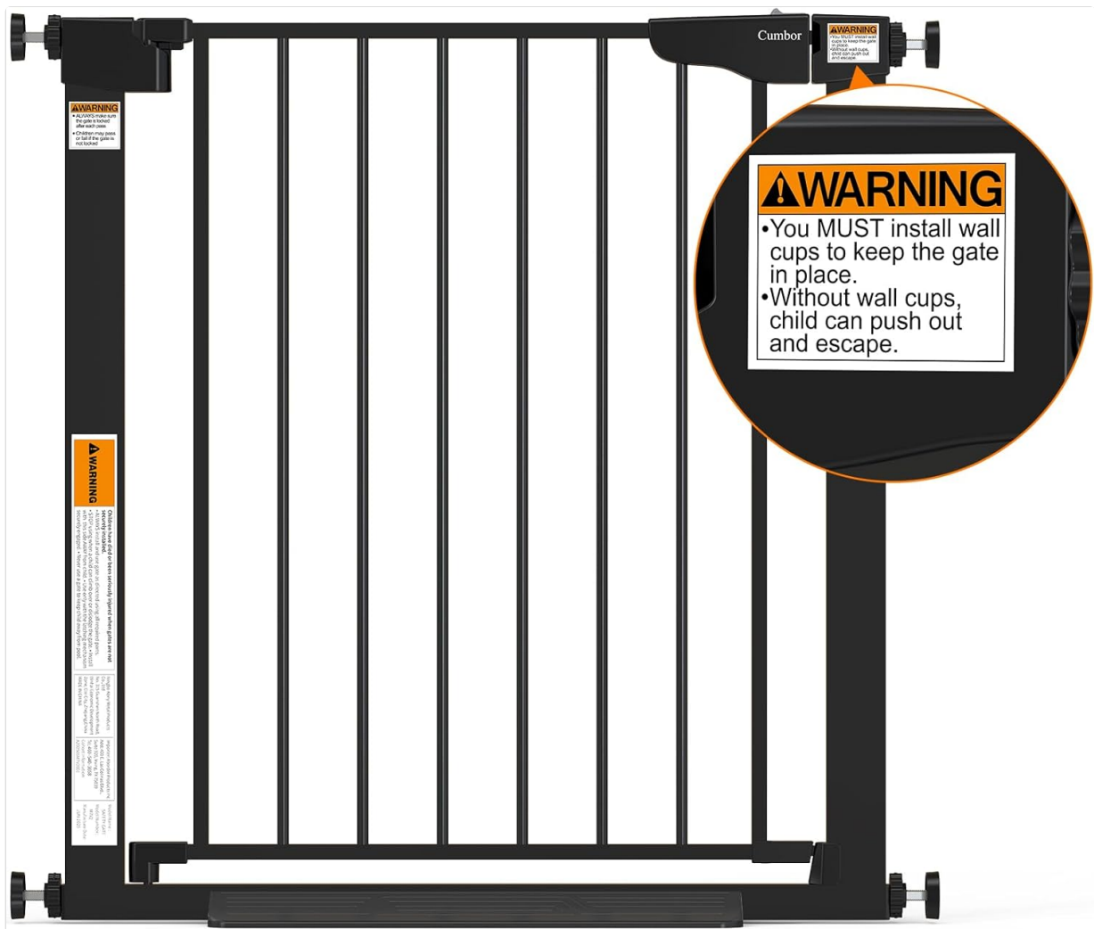
Image: Detailed warning label with safety instructions.