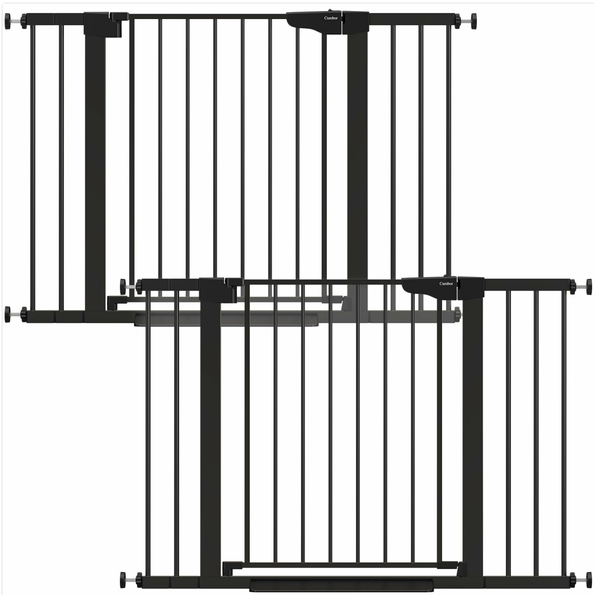
Image: Cumbor Baby Gate installed at the bottom of stairs and in a doorway.

The Cumbor Baby Gate is a pressure-mounted safety gate designed to restrict access for children and pets in various areas of your home. It features a durable steel construction and an adjustable width for versatile placement.