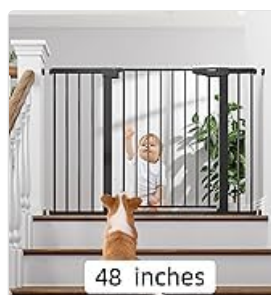
Image: Double-lock safety release mechanism.