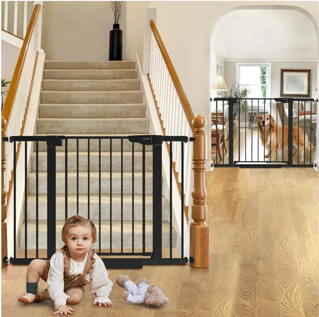
Image: Gate demonstrating adjustable width and initial gap.