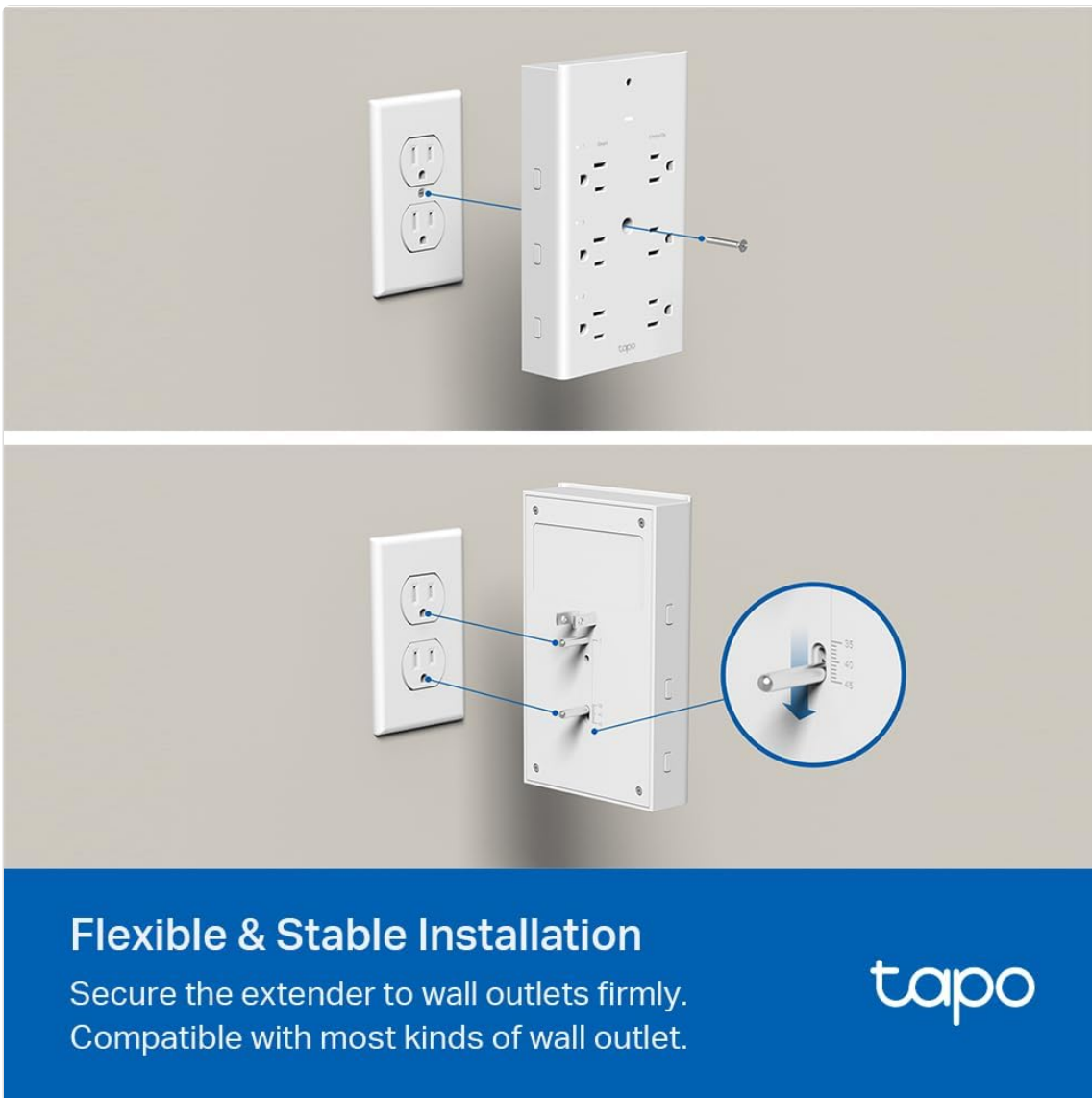
Figure 7: Flexible & Stable Installation. The extender can be securely mounted to various wall outlet types.