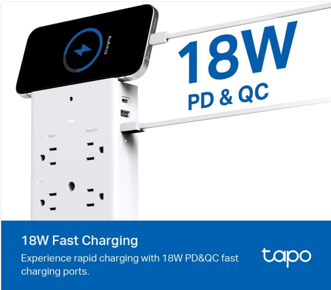
Figure 2: 18W Fast Charging. The Tapo P306 offers rapid charging for your mobile devices through its USB ports.