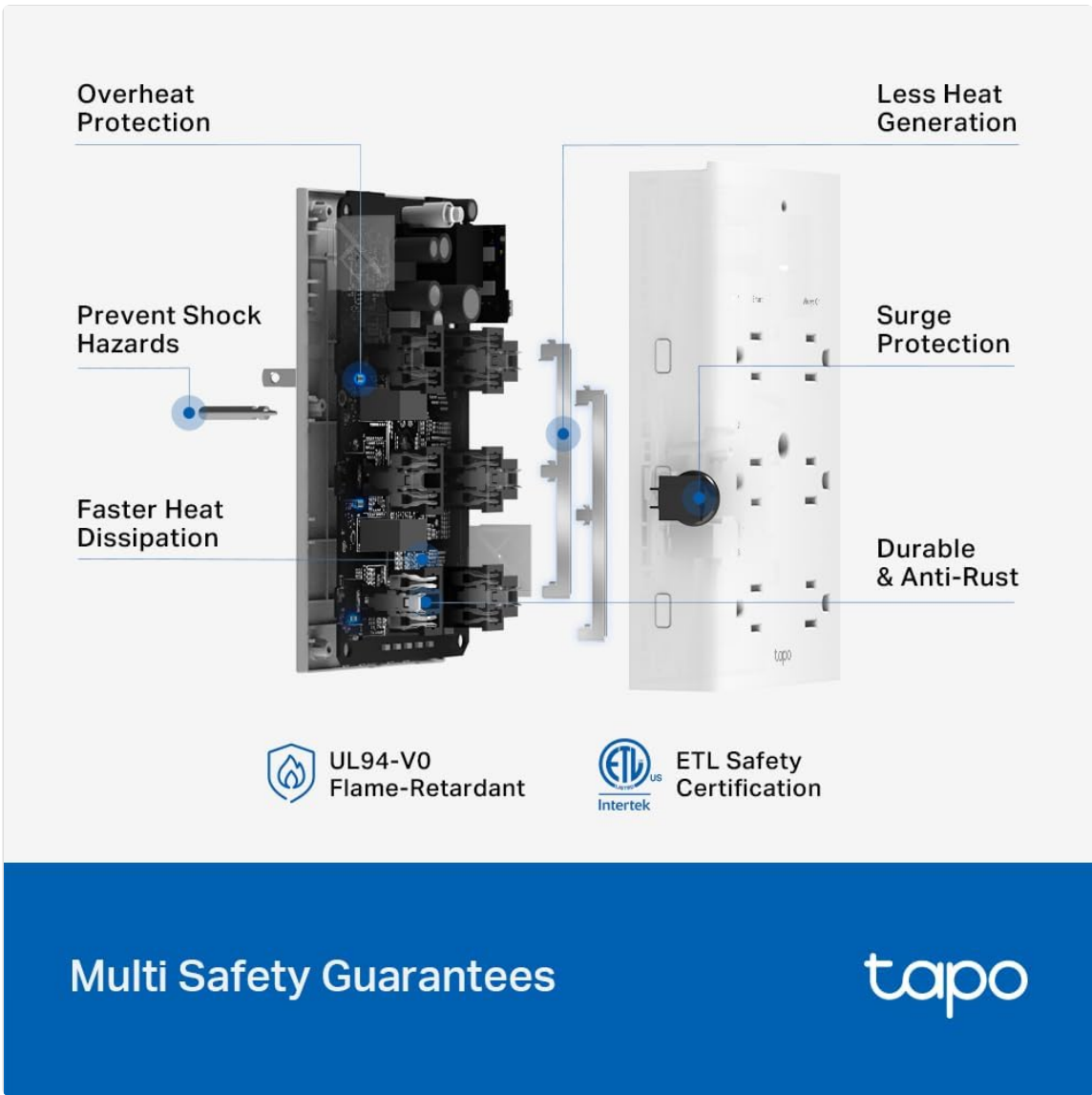
Figure 8: Multi Safety Guarantees. Internal components designed for enhanced safety and durability.