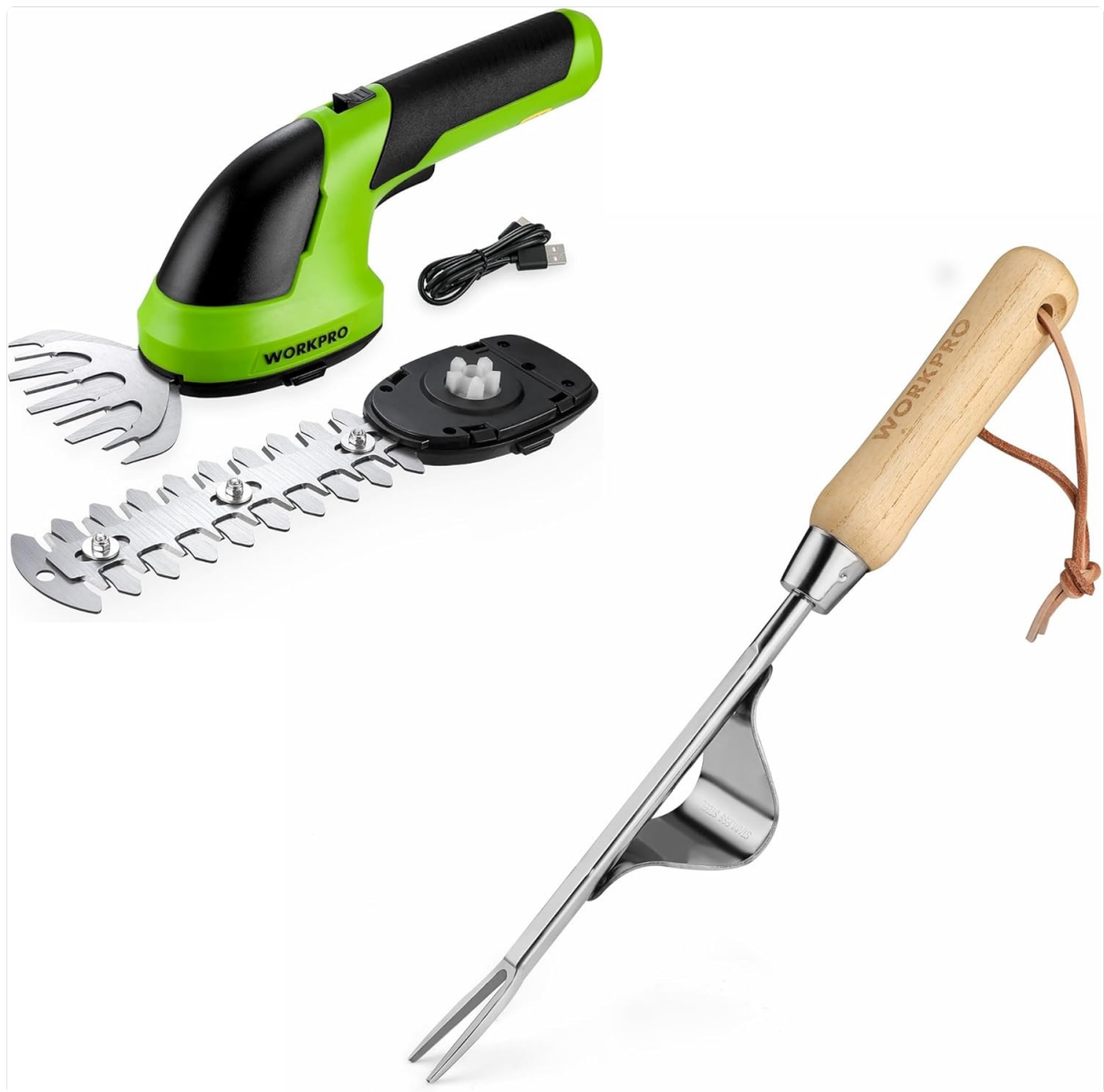
Figure 1.1: WORKPRO Cordless Grass Shear & Shrubbery Trimmer and Weed Puller Tool.