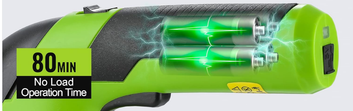
Figure 4.2: The trimmer features an upgraded 1100rpm motor and a 2000mAh Lithium-ion battery for extended operation.