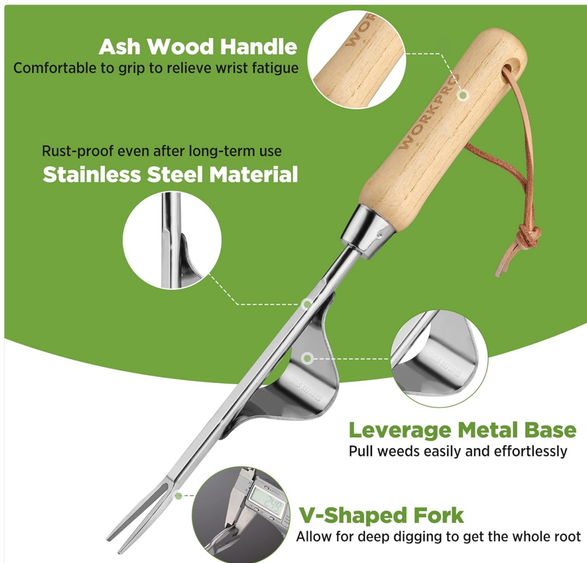
Figure 4.3: Key features of the WORKPRO Weed Puller Tool.