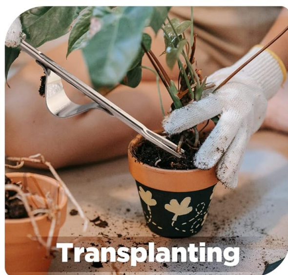
Figure 6.3: The weed puller is versatile for various gardening tasks.