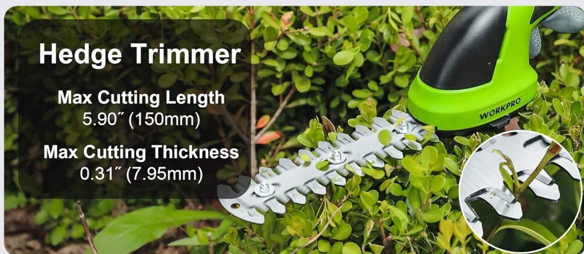
Figure 5.1: The 2-in-1 design allows quick switching between grass shearing and hedge trimming modes.