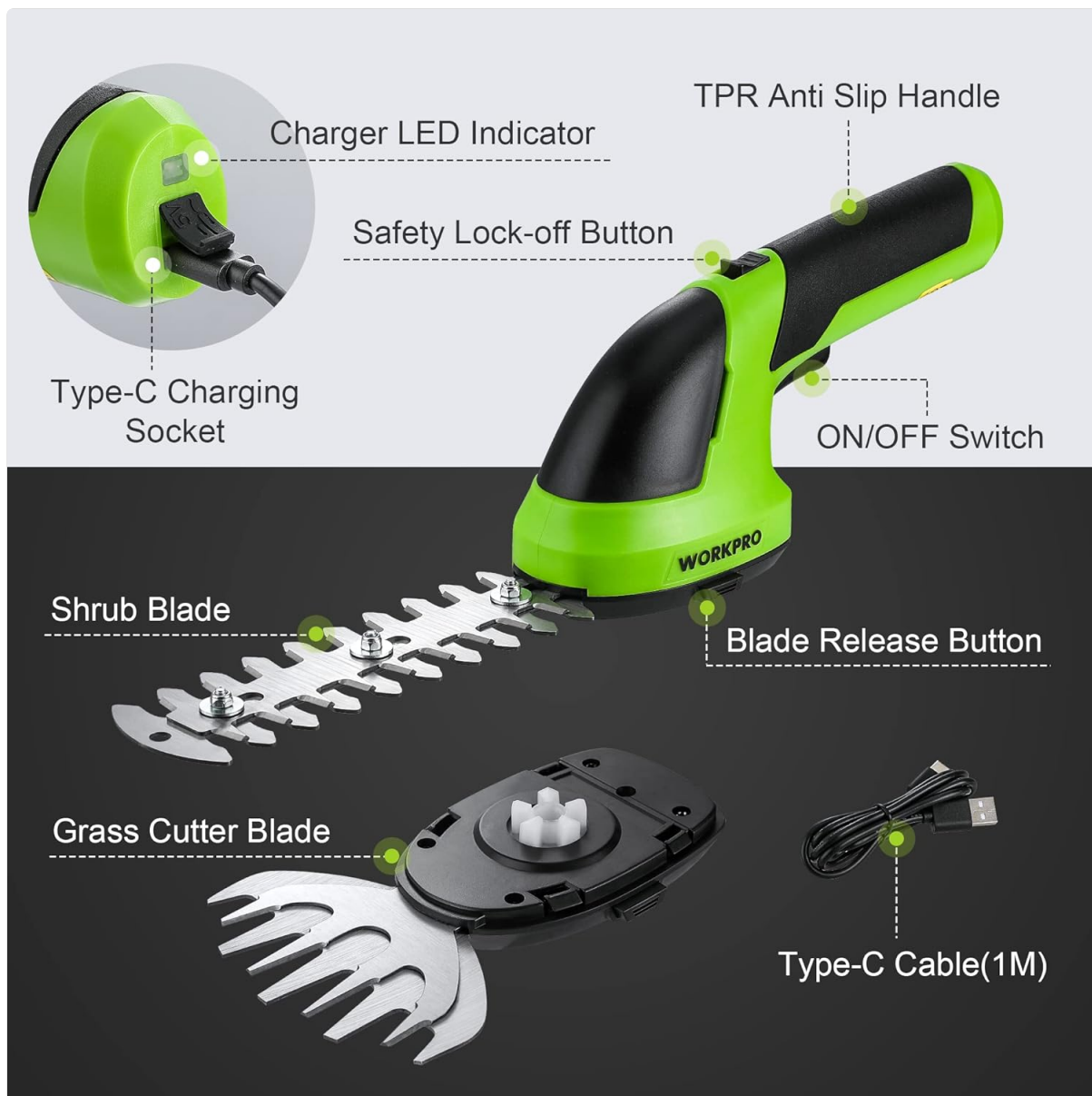
Figure 4.1: Key components of the Cordless Grass Shear & Shrubbery Trimmer.