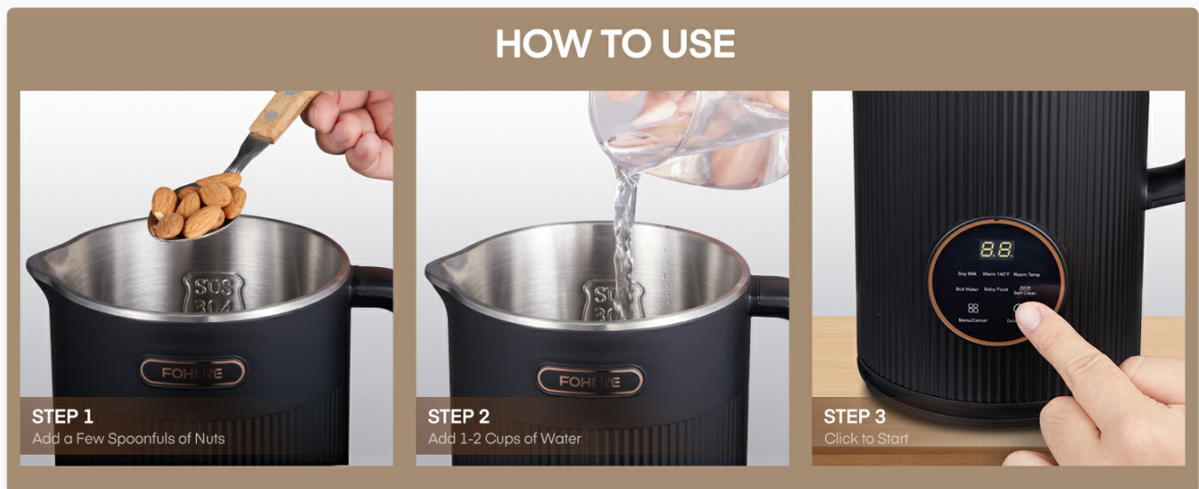
Image: Basic steps for operating the FOHERE Nut Milk Maker.

The FOHERE Nut Milk Maker offers various functions for different beverages. Follow these general steps for operation: