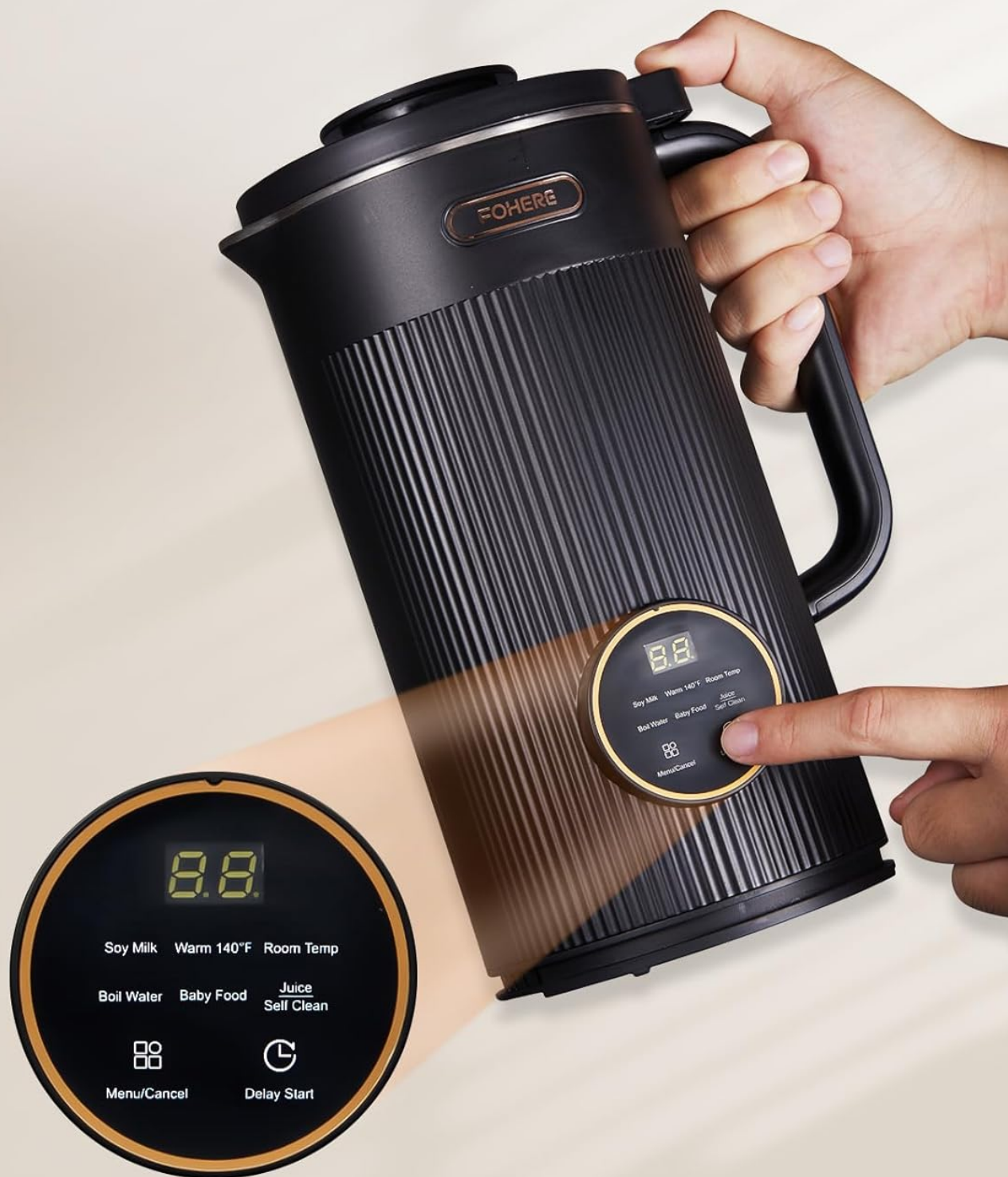
Image: The intuitive control panel of the FOHERE Nut Milk Maker.

“Unique Making Experience, Enjoy The Fun of Making Drinks”