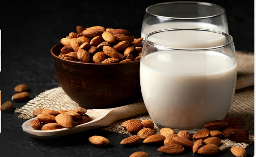
Image: Apricot Milk Recipe.

1 tsp Vanilla Extract and Pinch of Salt/Sugar