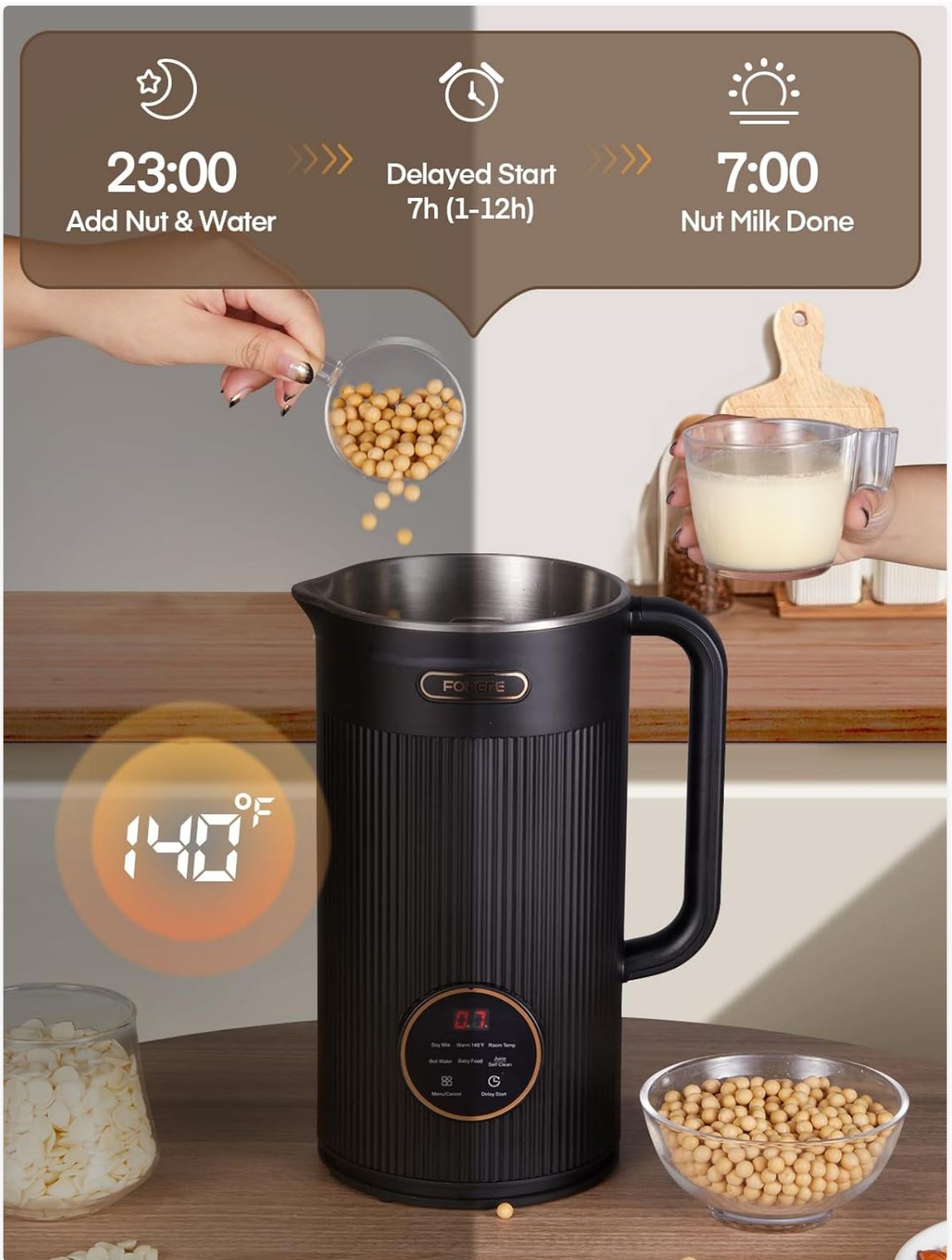
Image: Example of using the 12-hour Delay Start function.