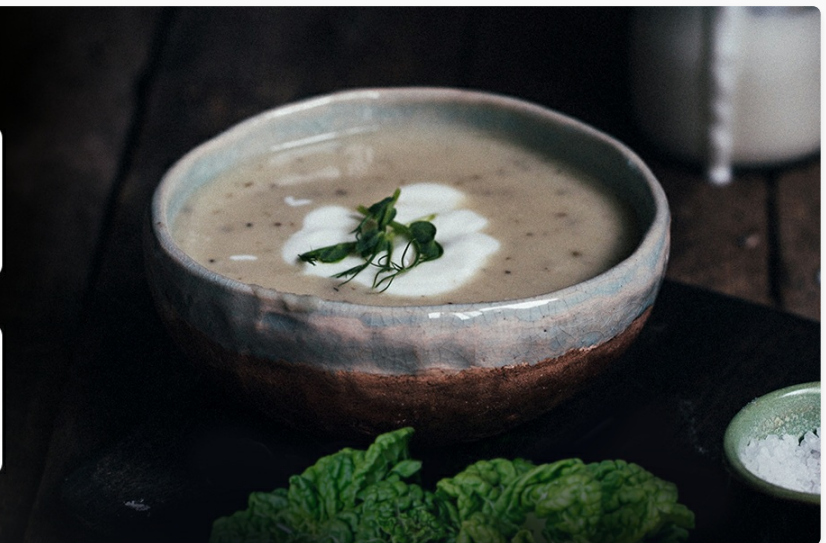
Image: Baby Food Recipe.