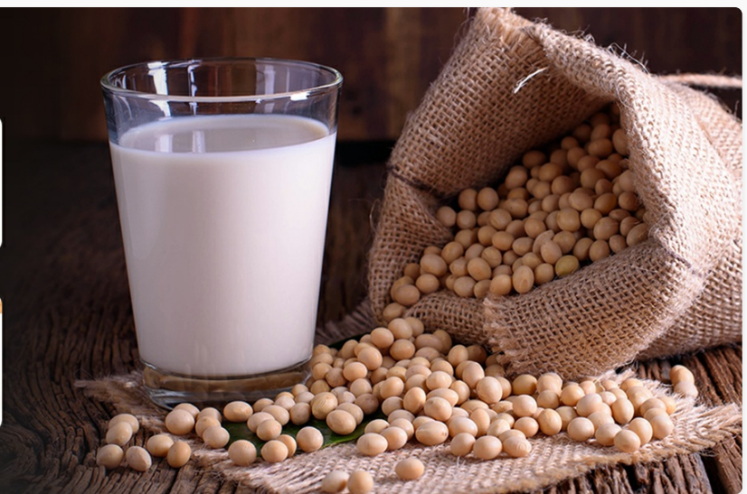
Image: Soy Milk Recipe.