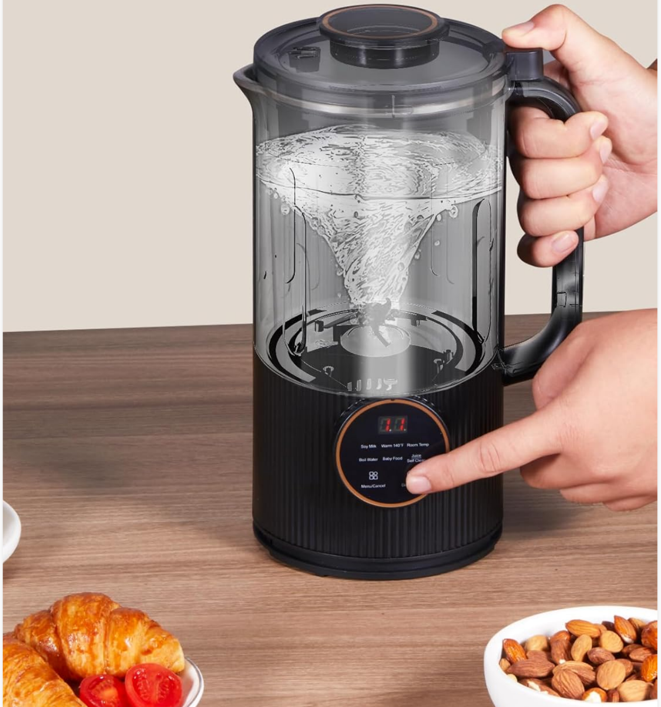
Image: Using the Self-Clean function for easy maintenance.