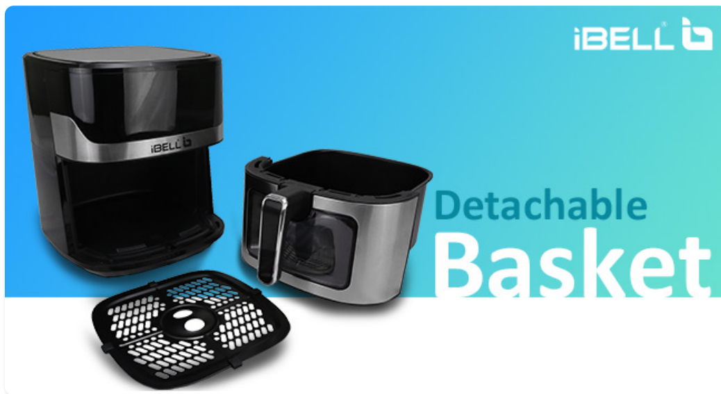
Figure 2.2: Detachable basket and crisper plate for easy cleaning.