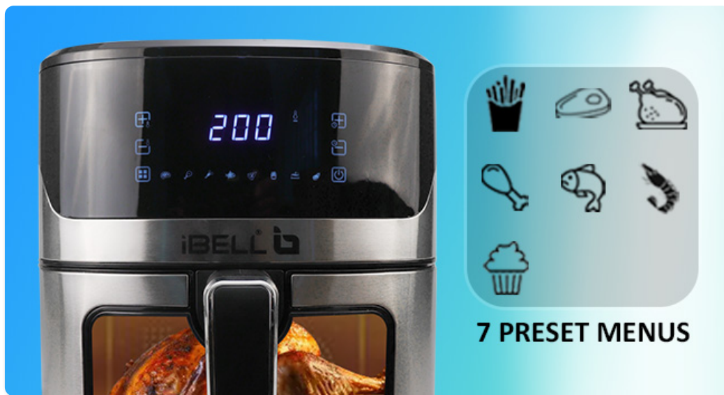
Figure 4.1: Digital display with touch controls.