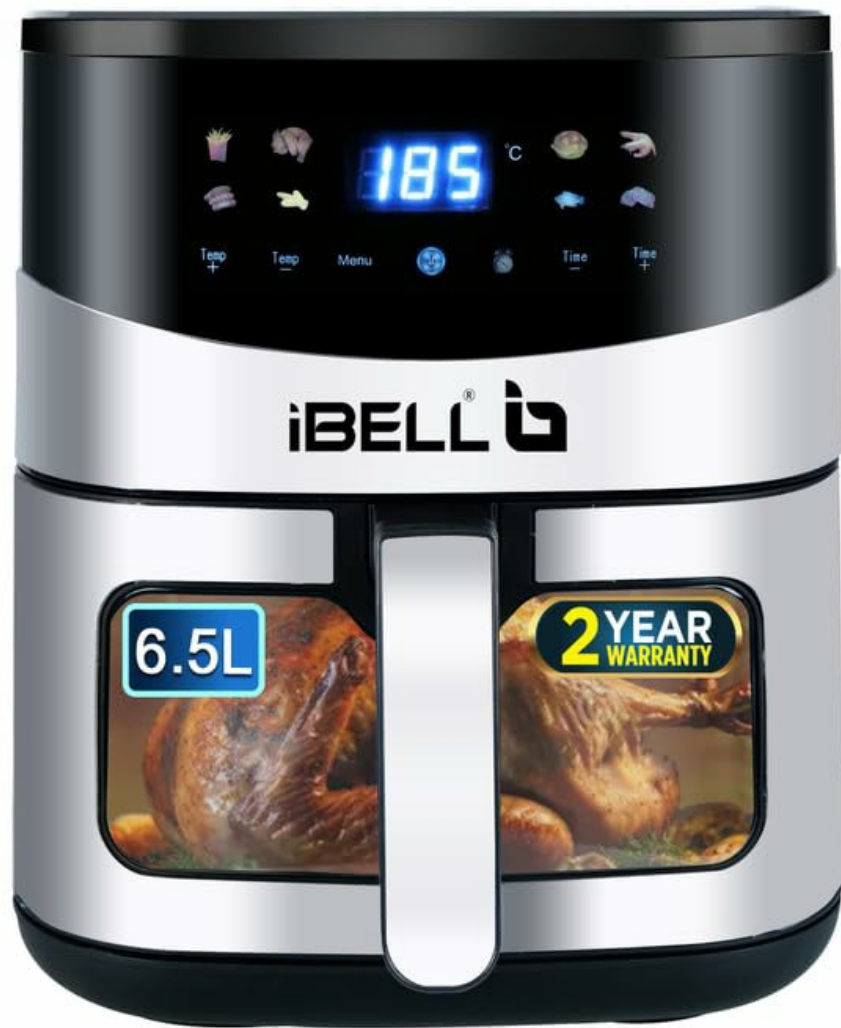
Figure 2.1: iBELL AF650MN Air Fryer with its basket containing fries.