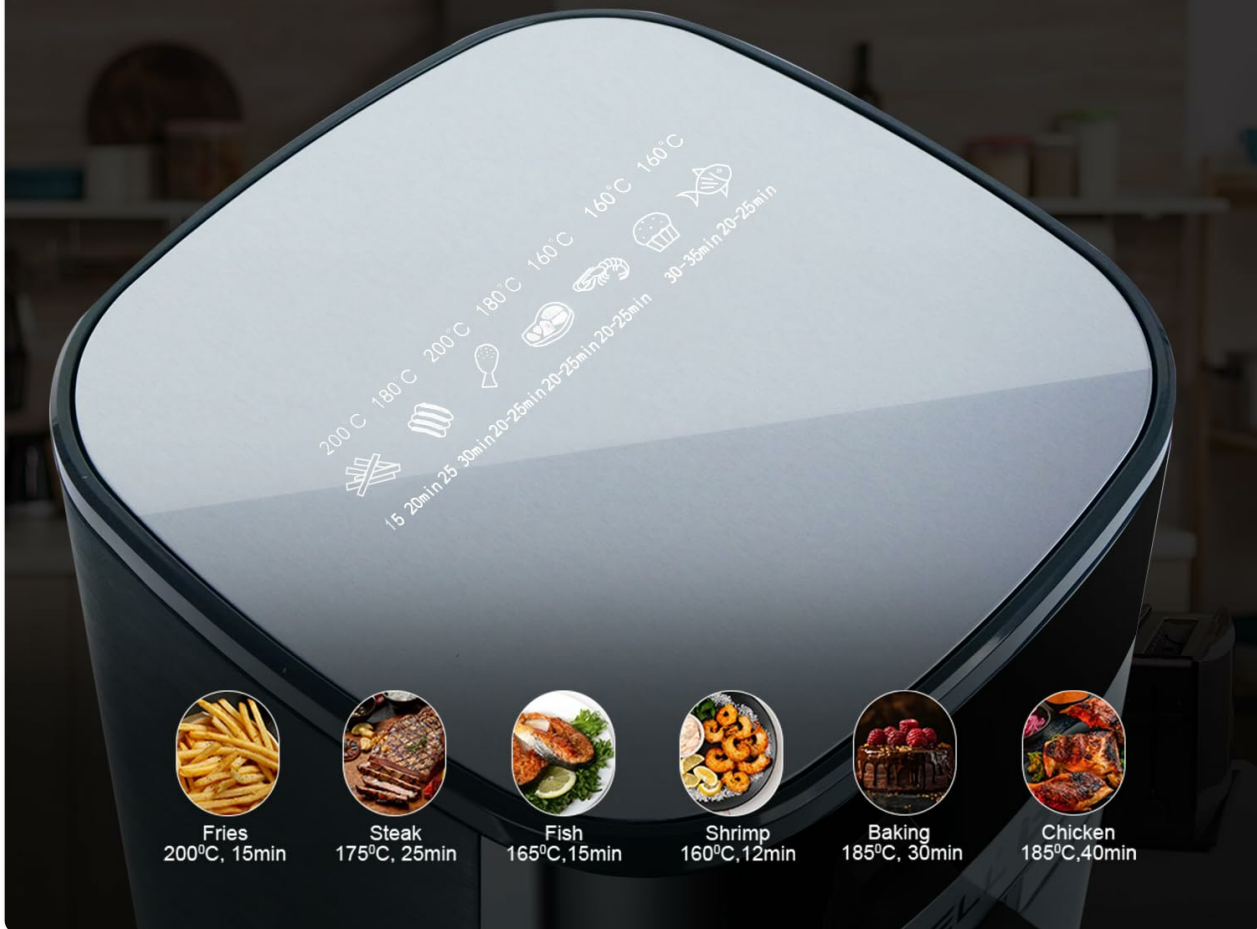
Figure 4.2: Control panel displaying 8 cooking presets.