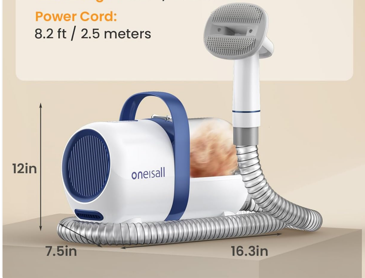
Image: A graphic displaying key specifications for the oneisall LM5C Pet Grooming Kit, including model, power, capacity, and dimensions.