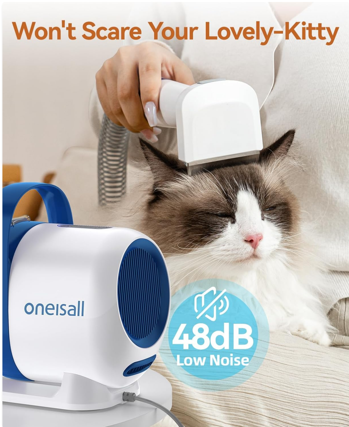
Image: A cat calmly being groomed with the vacuum brush attachment, demonstrating the quiet operation.