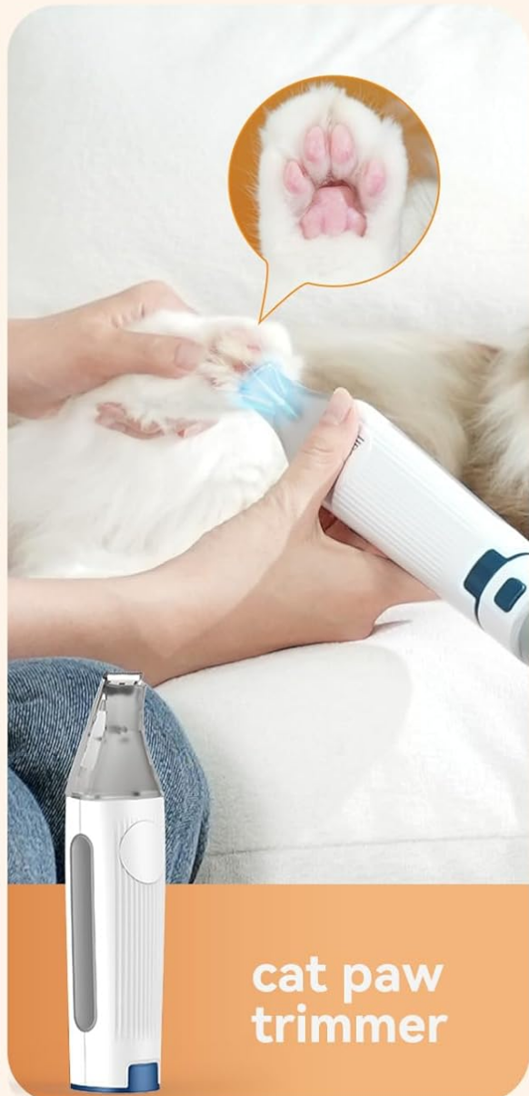
Image: A cat being groomed with the electric clipper and paw trimmer attachments, highlighting their versatile use.