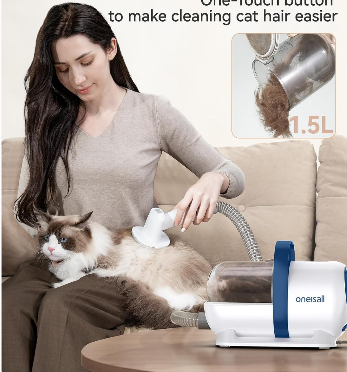
Image: A close-up of the detachable 1.5L dust cup, showing collected pet hair and the easy-release mechanism.

One-Touch button to make cleaning cat hair easier