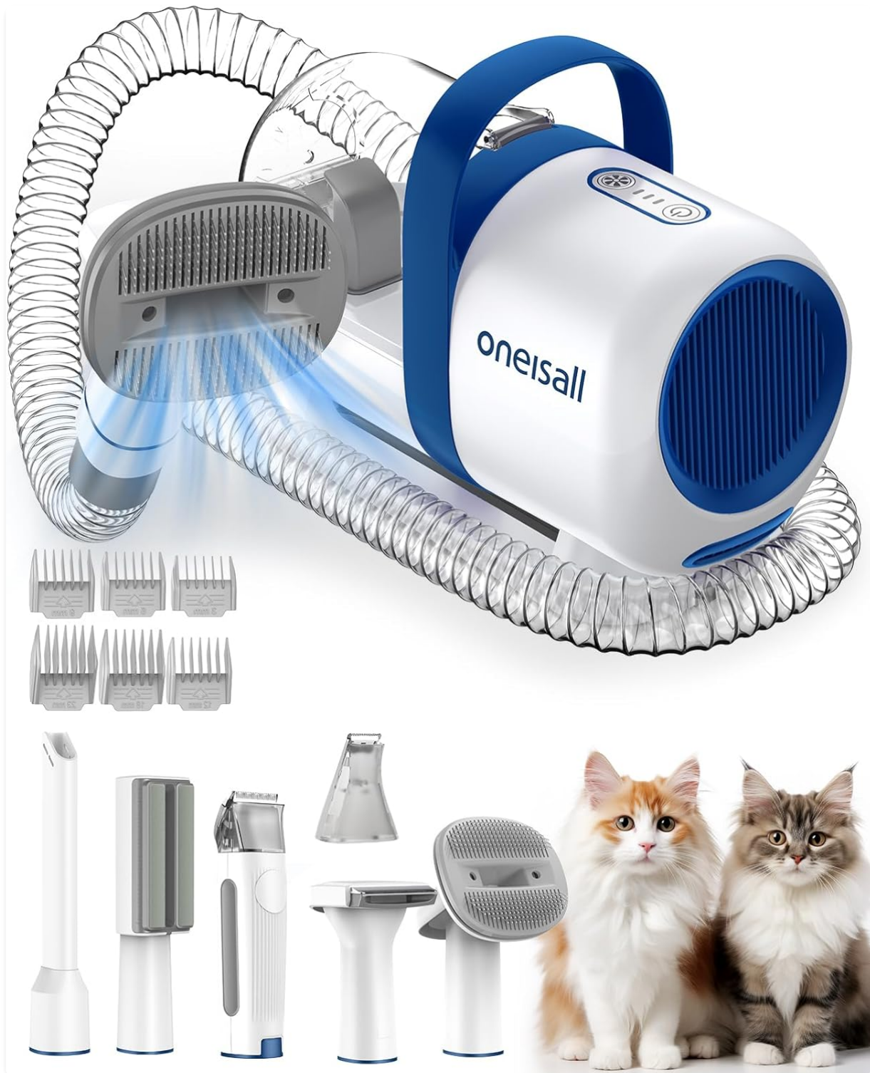
Image: All components of the oneisall LM5C Pet Grooming Kit, including the vacuum unit, hose, various brushes, clippers, and comb guides.

Your browser does not support the video tag.