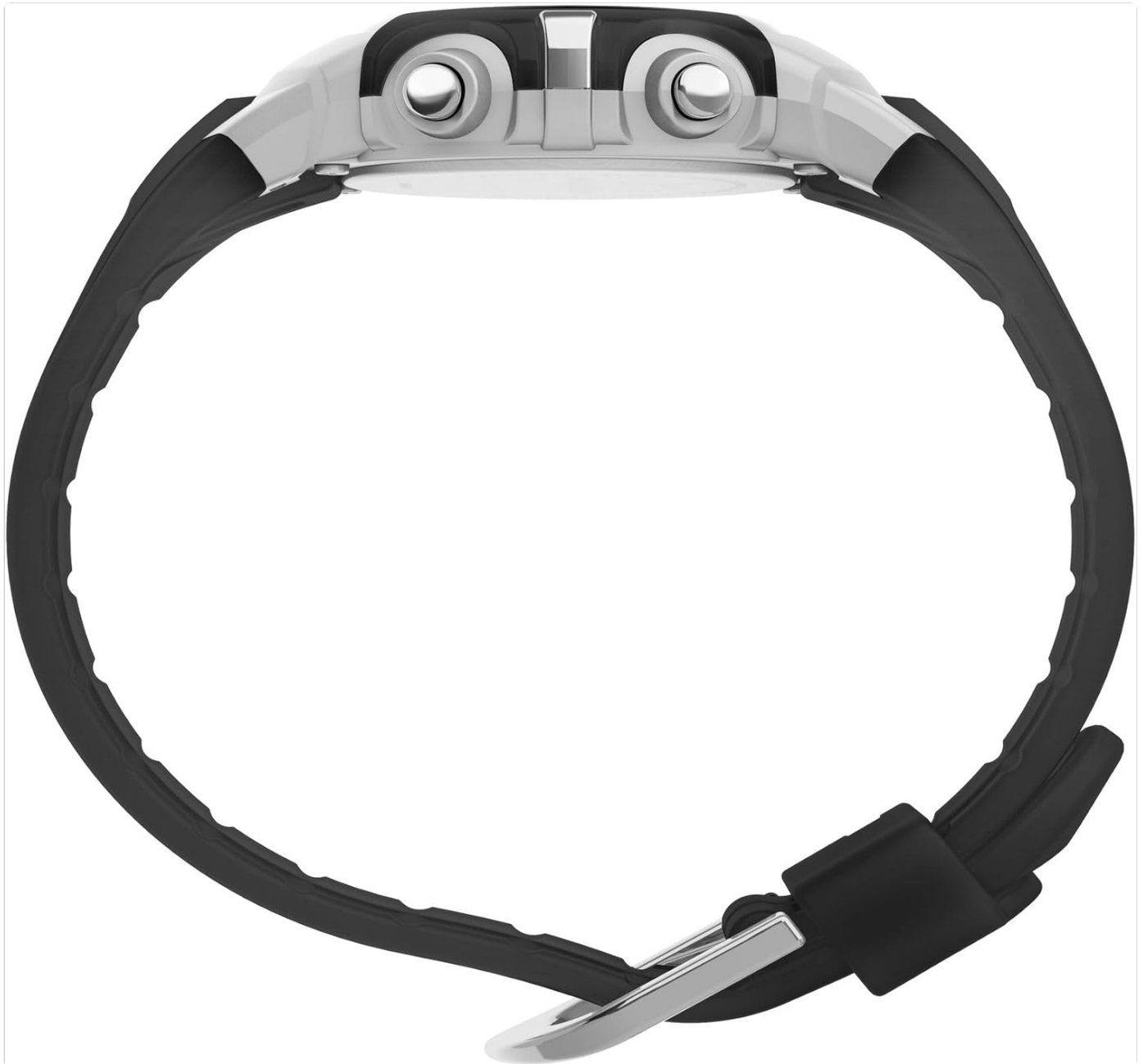
Figure 3: Side profile of the Timex watch. This image illustrates the watch's slim design and the placement of the control buttons on the side of the case.

This watch is water resistant to 50 meters (WR50M). This means it is suitable for short periods of recreational swimming. It is not suitable for diving, snorkeling, or high-impact water sports. Do not press any buttons while the watch is submerged in water, as this can compromise the water resistance seal.