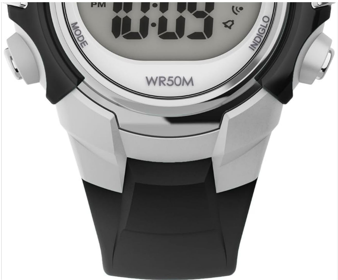
Figure 1: Front view of the Timex 33mm Unisex Digital Watch. This image shows the watch face with digital display, the silver-tone resin case, and the black resin strap. The watch features multiple buttons on the sides for various functions.