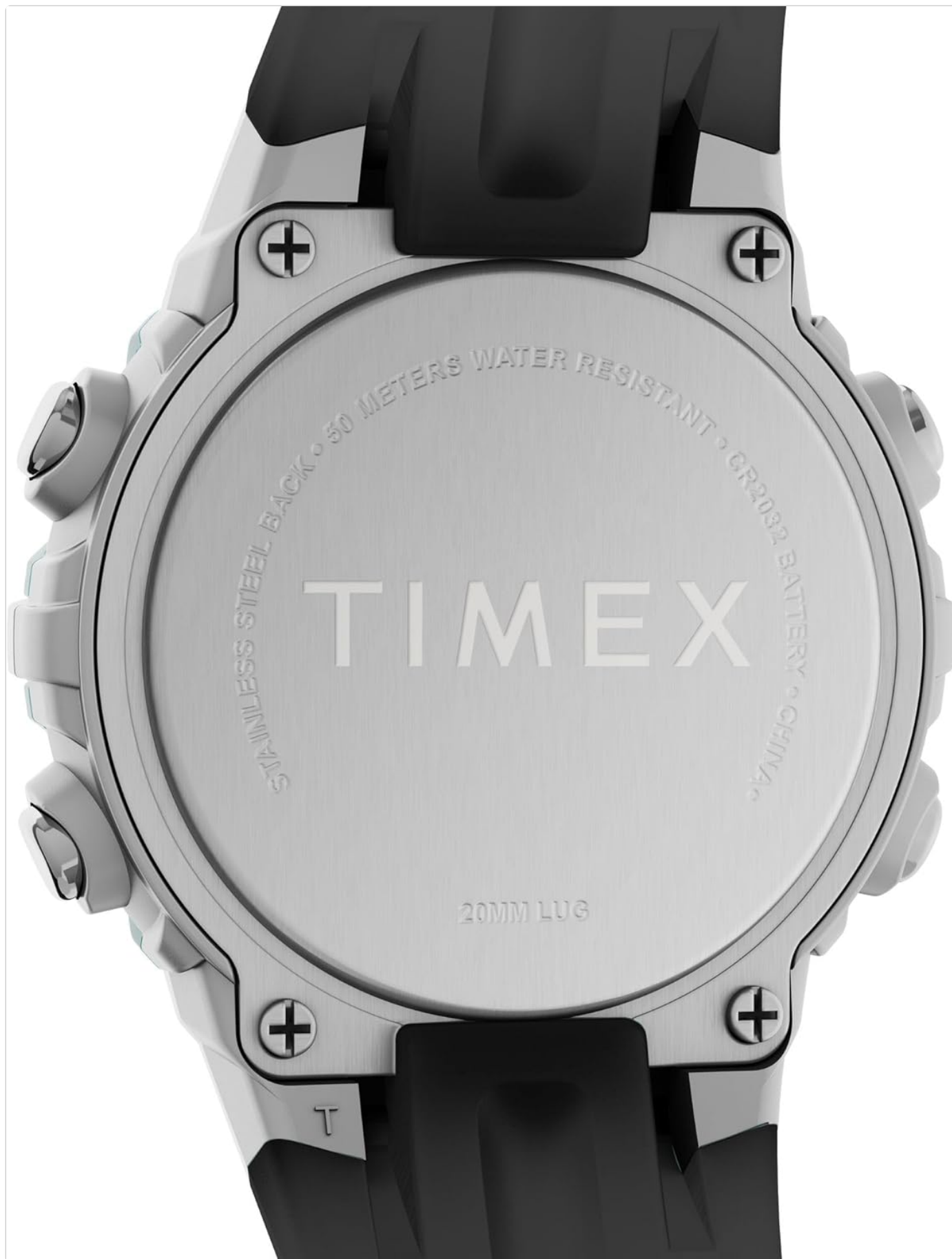
Figure 4: Rear view of the Timex watch case. This image shows the stainless steel case back, which is secured by four screws, and indicates the water resistance rating of 50 meters.