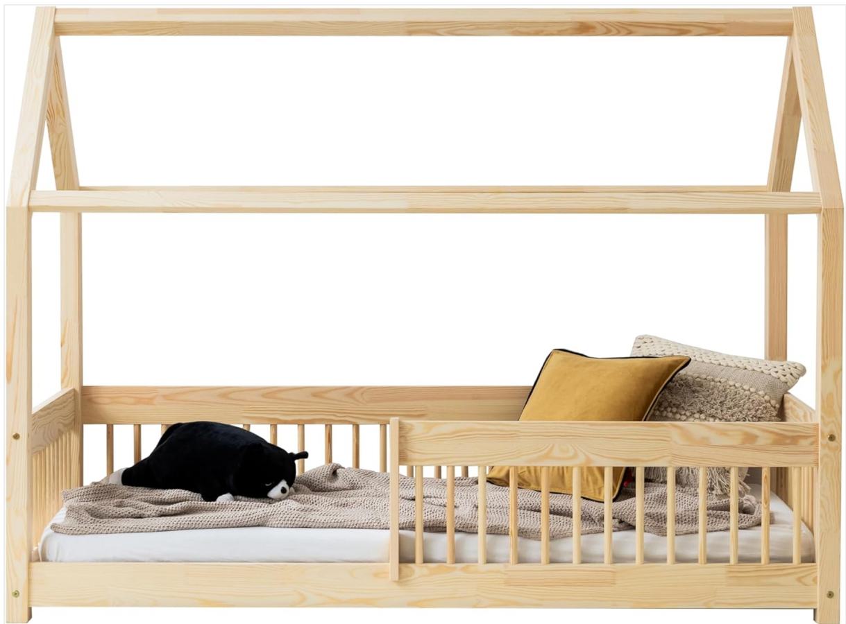
Image 1.1: Front view of the ADEKO MBW 100x180 Kids Cabin Bed, showcasing its house-shaped frame and slatted base, complete with bedding and pillows.

The ADEKO MBW 100x180 Kids Cabin Bed is a house-shaped bed frame designed to provide a comfortable and imaginative sleeping space for children. Constructed from durable pine wood, this bed combines functionality with an ecological design approach. Its unique structure encourages creativity and provides a sense of privacy and security, enhancing the sleeping experience.