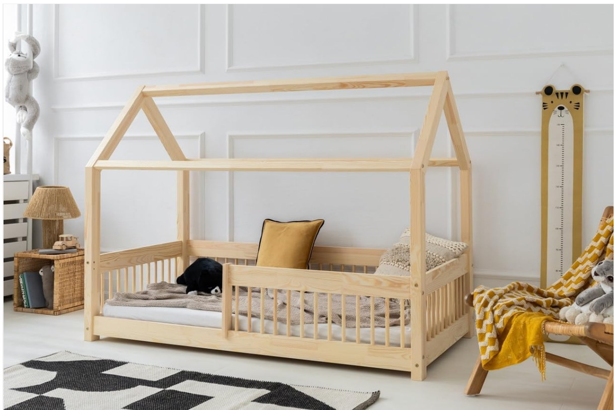
Image 4.1: The ADEKO MBW 100x180 Kids Cabin Bed fully assembled in a child's room, demonstrating its house-like structure.