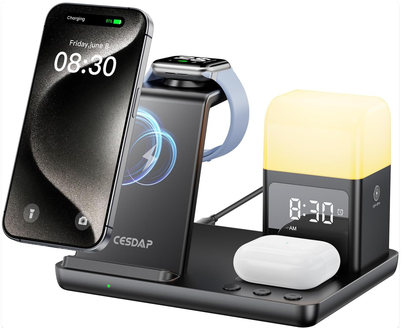
Image 1.1: The CESDAP Z18 charging station with a smartphone, smartwatch, and wireless earbuds in position for charging, alongside the digital alarm clock and night light.