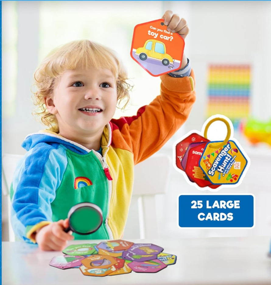
Image: A child engaged in the Scavenger Hunt game, using a magnifying glass to find items.