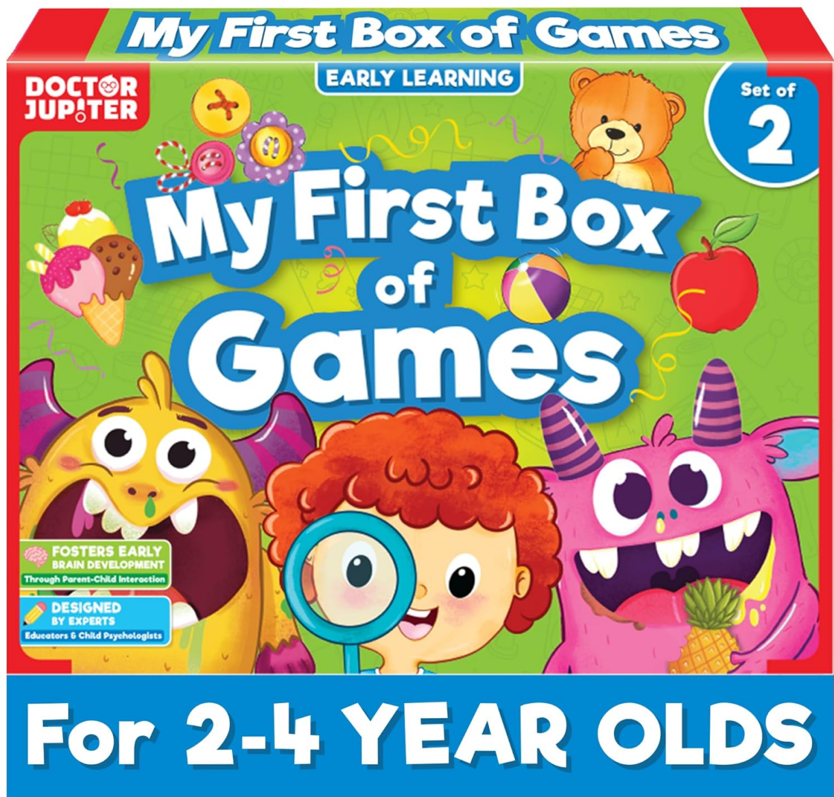
Image: The main packaging for Doctor Jupiter My First Box of Games, highlighting its contents and target age range.