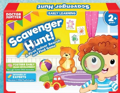
Image: An overview of the two games included in the box: Monster Munch and Scavenger Hunt.