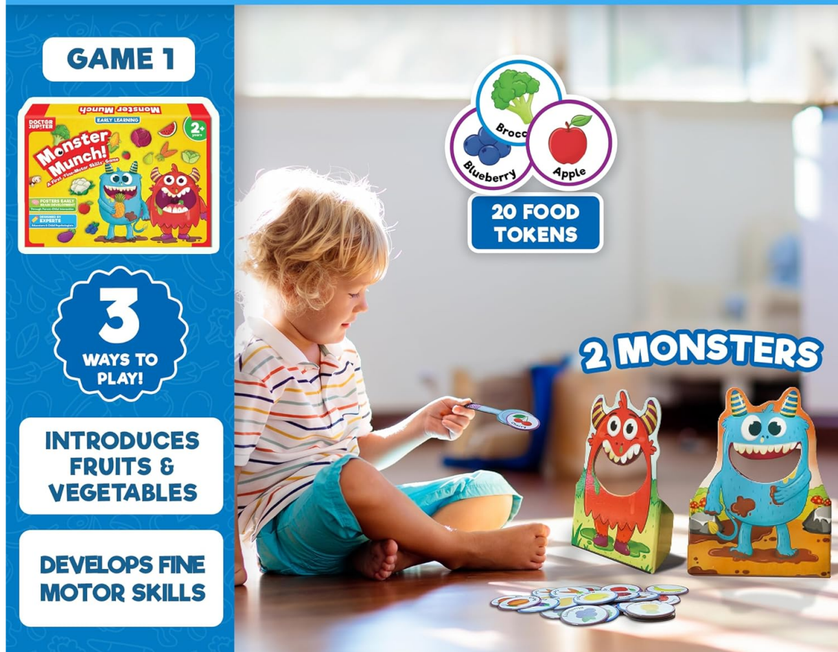
Image: A child actively playing the Monster Munch game, demonstrating the fine motor skill aspect.