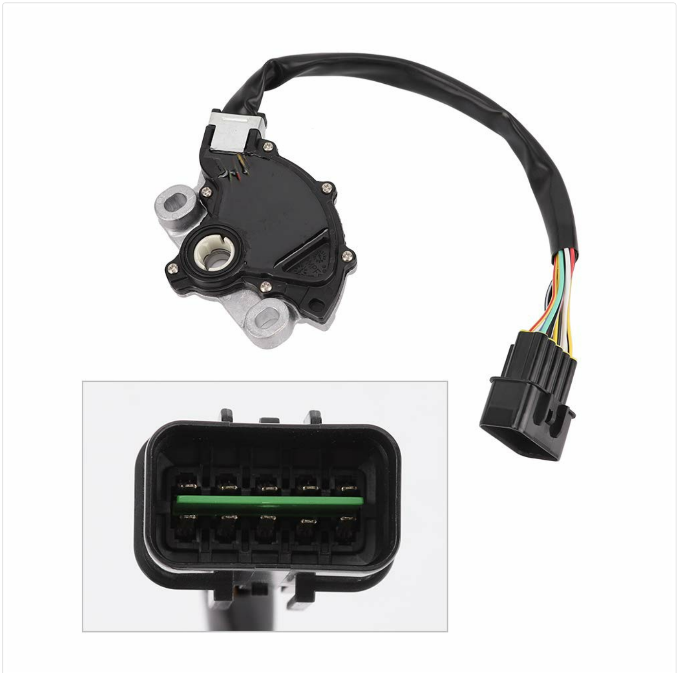
Image 3: A detailed view of the electrical connector on the neutral safety switch, highlighting the multi-pin configuration for proper wiring connection.