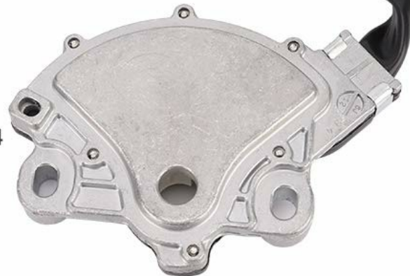
Image 2: The neutral safety switch shown alongside a Mitsubishi Montero Sport, illustrating the intended vehicle application.

Fitment: Fit For Mitsubishi Montero Sport 1999-2004 Fit For Mitsubishi Montero 1999-2004