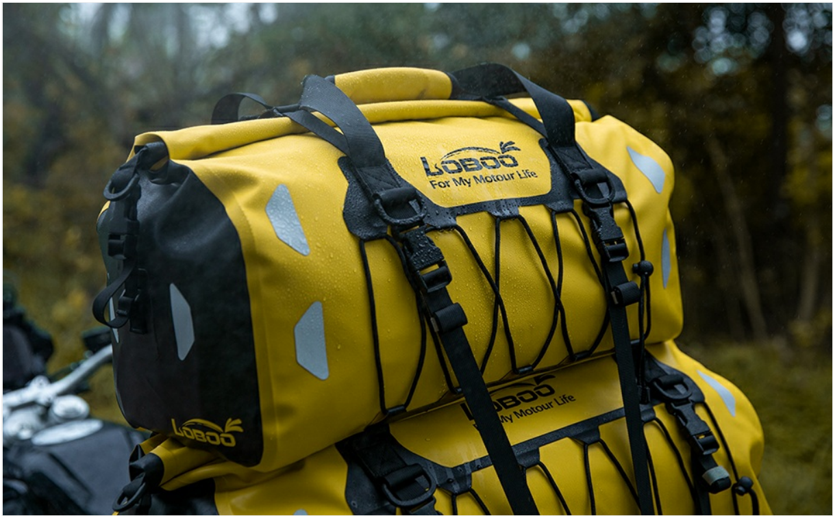
Image 6.1: The Loboo BWB50T bag demonstrating its waterproof capability in wet weather.