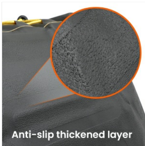
Anti-slip thickened layer

Image 3.3: Detail of the reflective warning strips for enhanced visibility during low-light conditions.