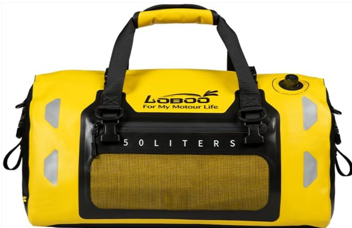
Image 1.1: Front view of the Loboo BWB50T 50L Motorcycle Travel Waterproof Bag in yellow.

Thank you for choosing the Loboo BWB50T 50L Motorcycle Travel Waterproof Bag. This manual provides essential information for the proper setup, operation, and maintenance of your new waterproof bag. Please read these instructions carefully before use to ensure optimal performance and longevity of the product.