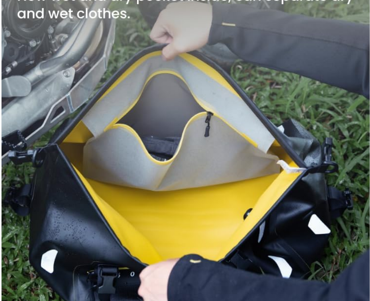
Image 5.1: View of the internal wet and dry separation compartment.

New wet and dry pocket inside, can separate dry and wet clothes.