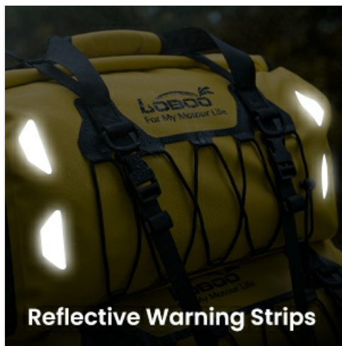
Reflective Warning Strips

Image 3.3: Detail of the reflective warning strips for enhanced visibility during low-light conditions.