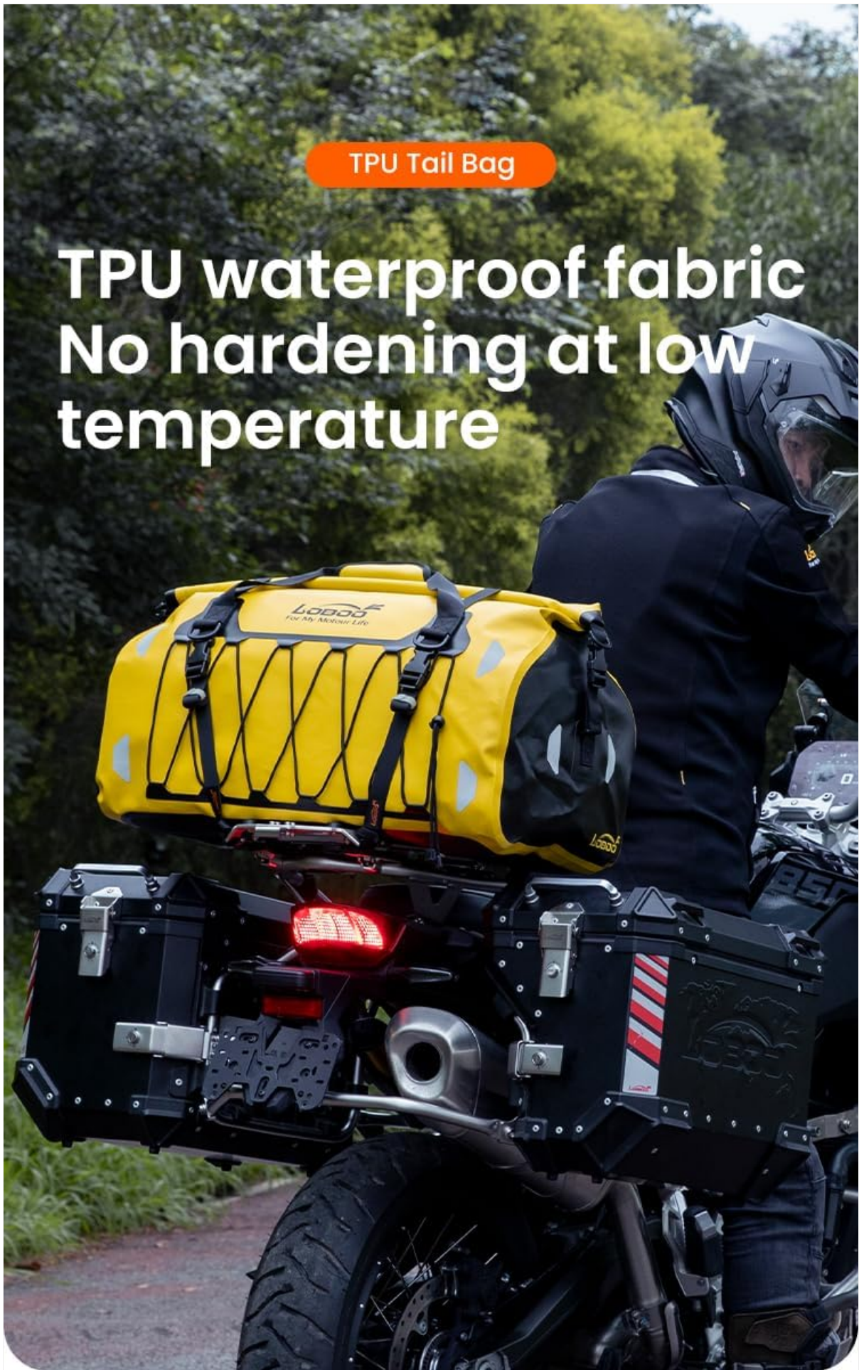
Image 4.2: The Lobo BWB50T bag securely mounted on the rear of a motorcycle.

TPU waterproof fabric No hardening at low temperature