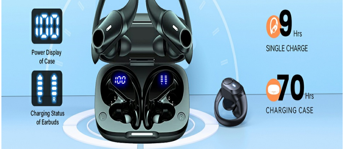
Illustration of the T59's long battery life, with 9 hours on a single earbud charge and up to 70 hours total with the charging case.