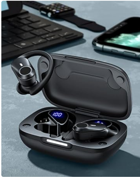
The T59 earbuds securely seated within their open charging case.