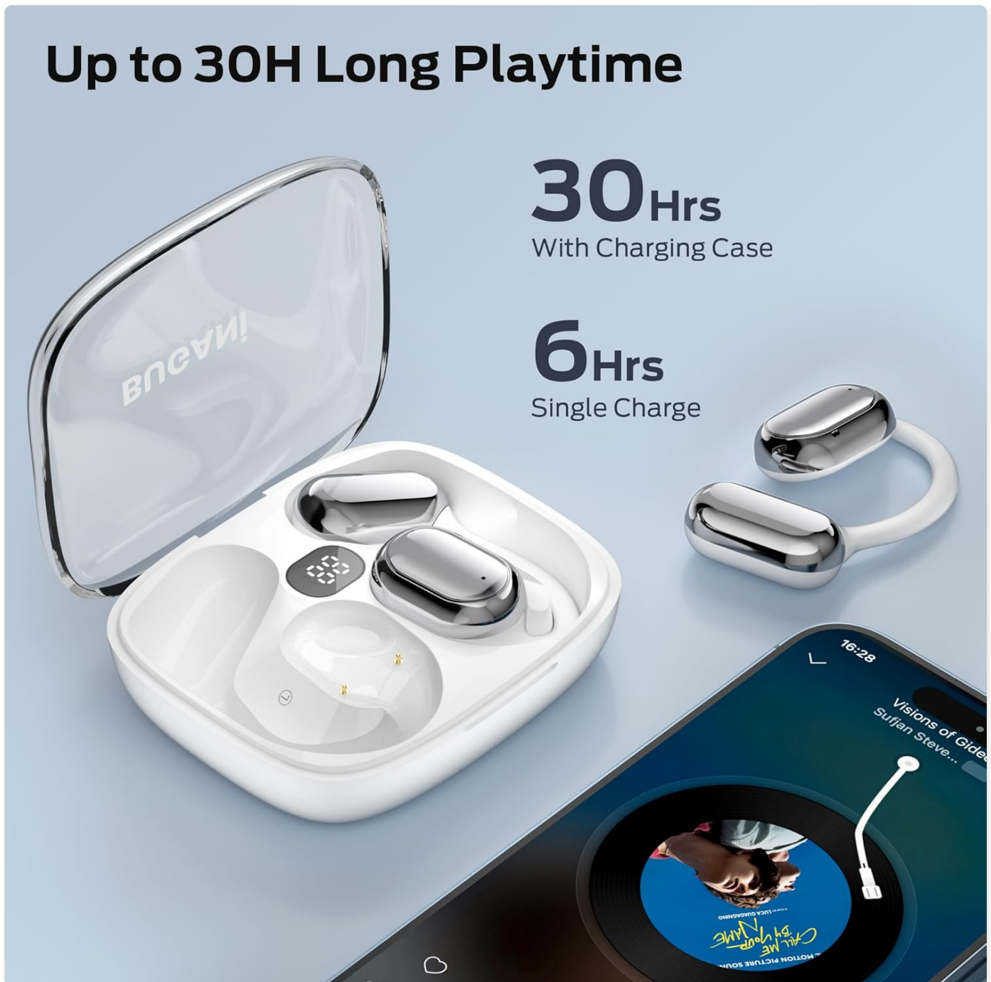
Image: The BUGANI Open Ear Headphones are shown inside their charging case, next to a smartphone displaying music. The image highlights the 30-hour total playtime with the charging case and 6 hours on a single charge.