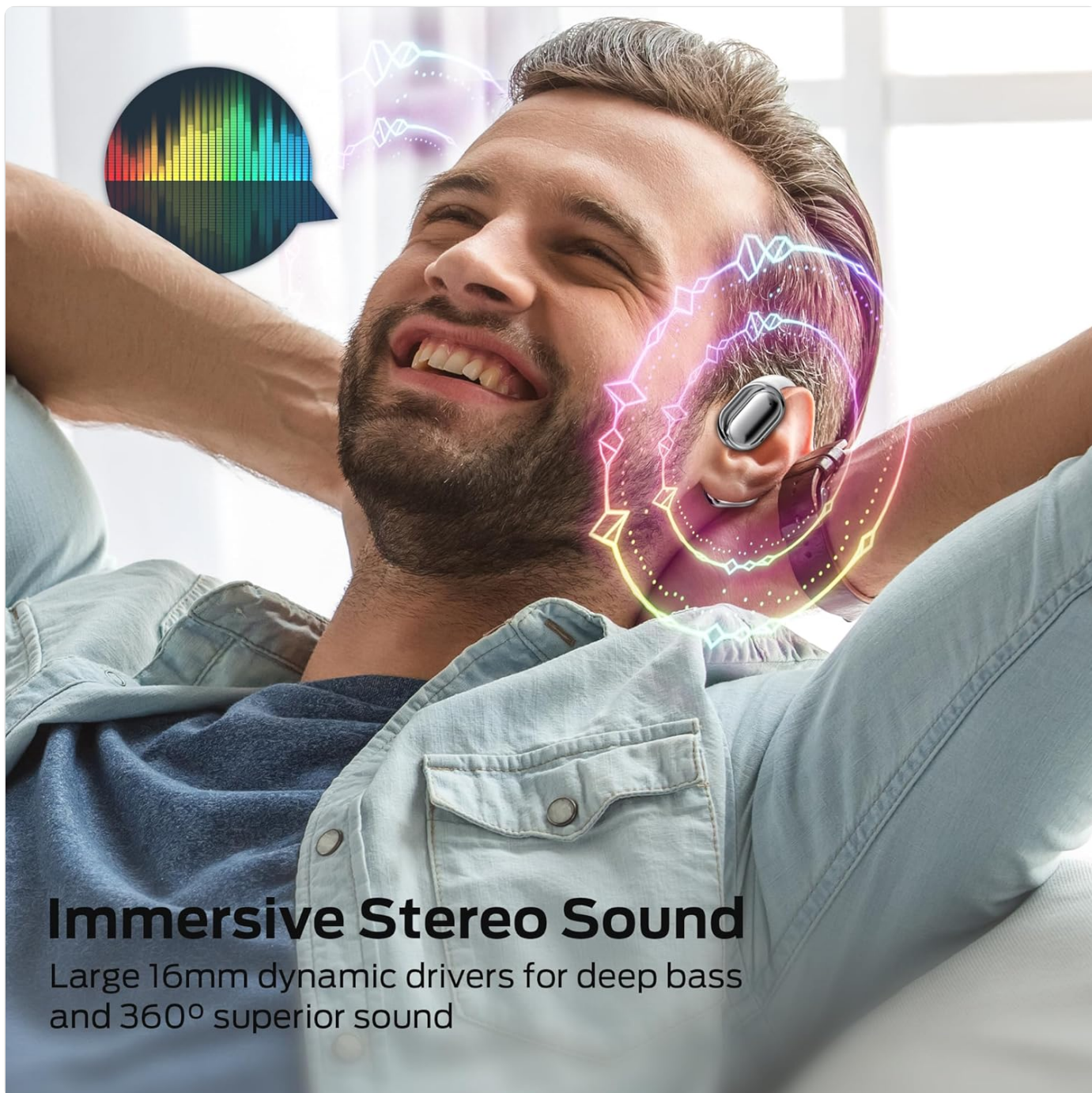
Image: A person is shown relaxing and enjoying music while wearing the BUGANI Open Ear Headphones, with visual effects indicating immersive stereo sound.