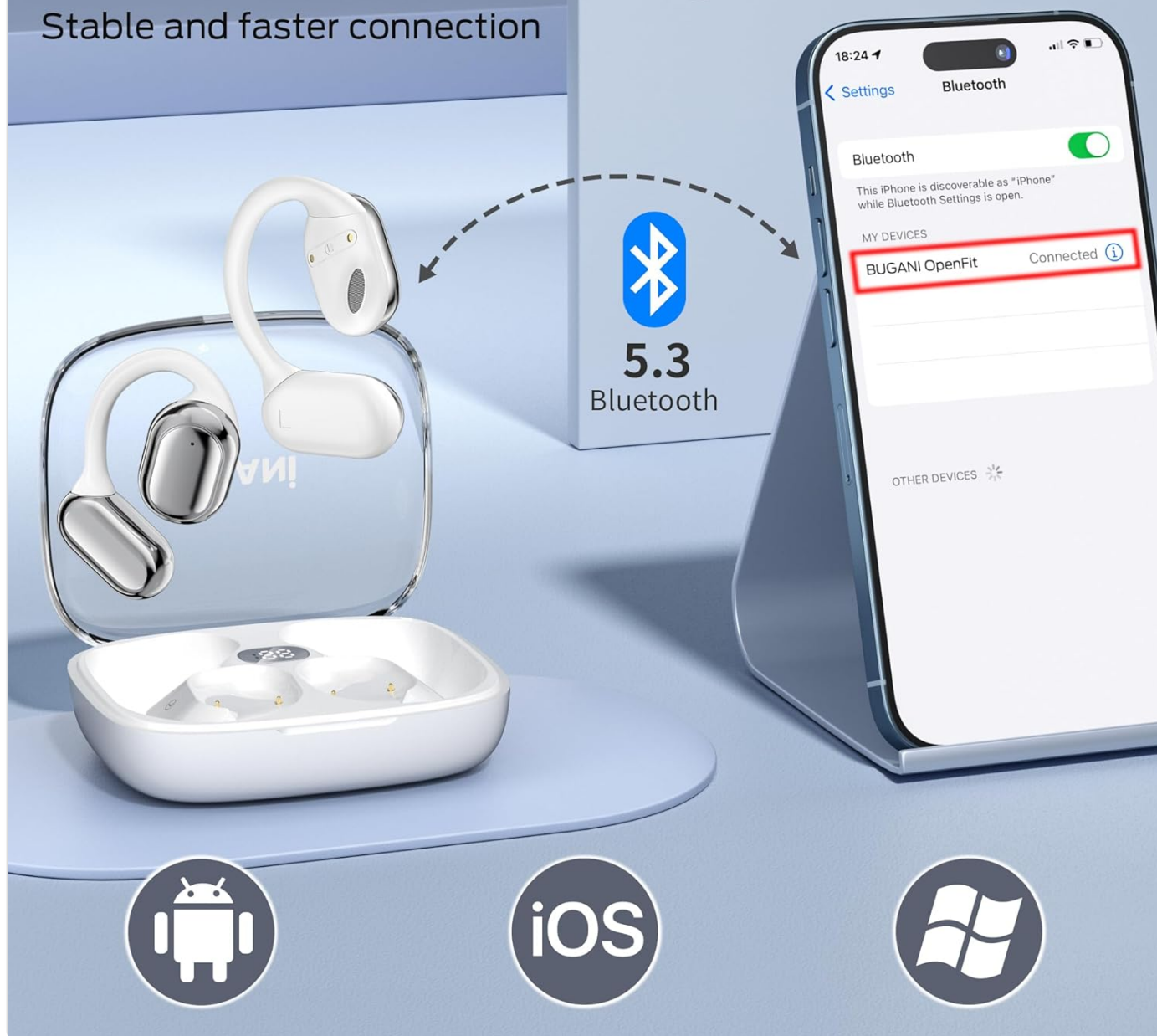
Image: The BUGANI Open Ear Headphones are shown next to a smartphone displaying its Bluetooth settings, with "BUGANI OpenFit" listed as a connected device. This illustrates the one-step auto-pairing process.