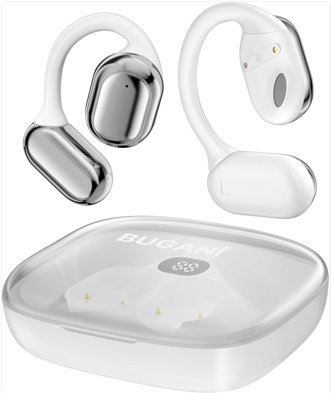
Image: The BUGANI Open Ear Headphones and their transparent charging case. The earbuds are white with silver accents, showcasing their unique open-ear design.