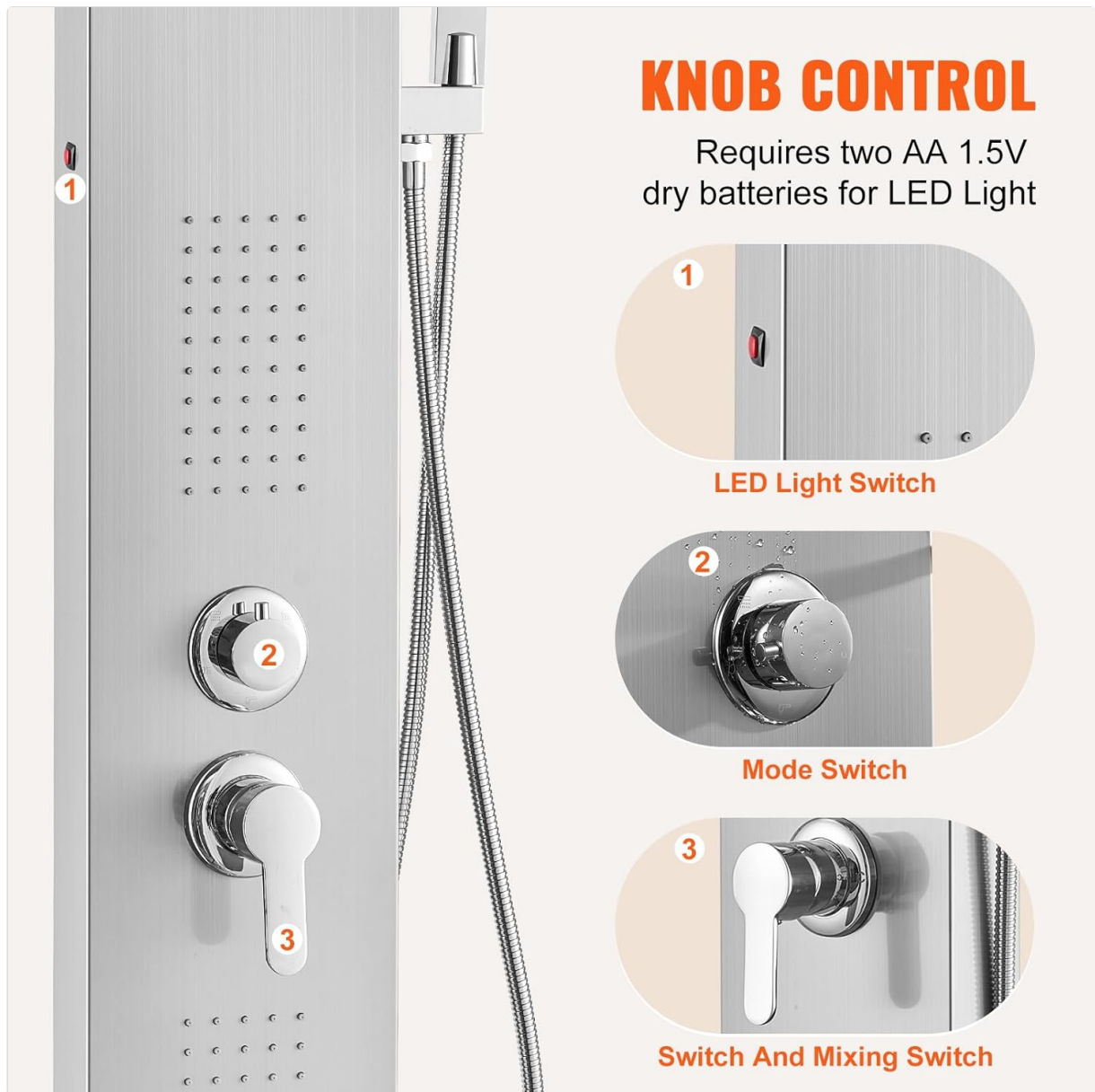
Figure 5: Knob Control for Modes and Temperature