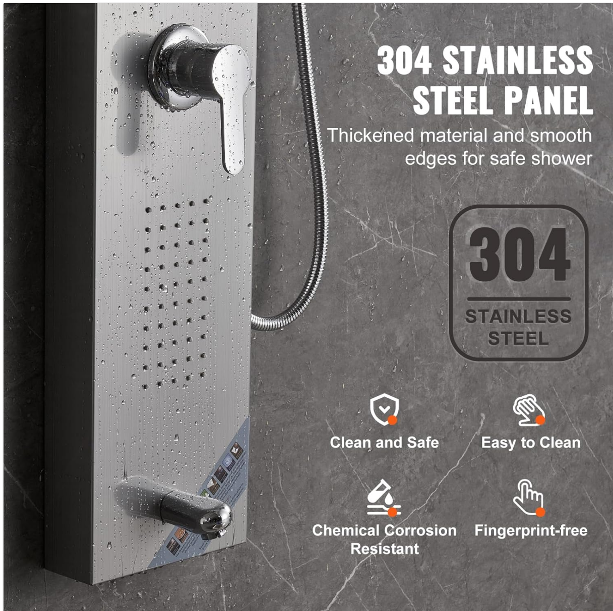
Figure 1: VEVOR Shower Panel System Components and Dimensions