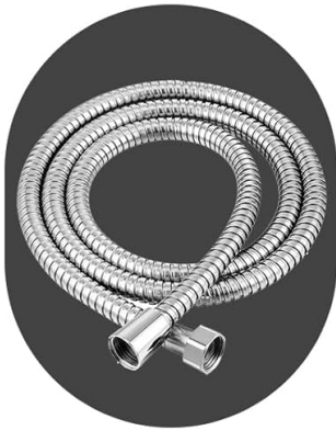
1.5m Long Hose

Catering to each family member's bathing preferences