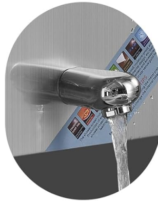
High Flow Tub Spout