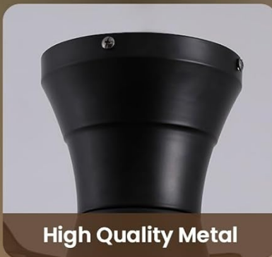
High Quality Metal