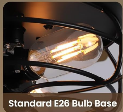
Standard E26 Bulb Base