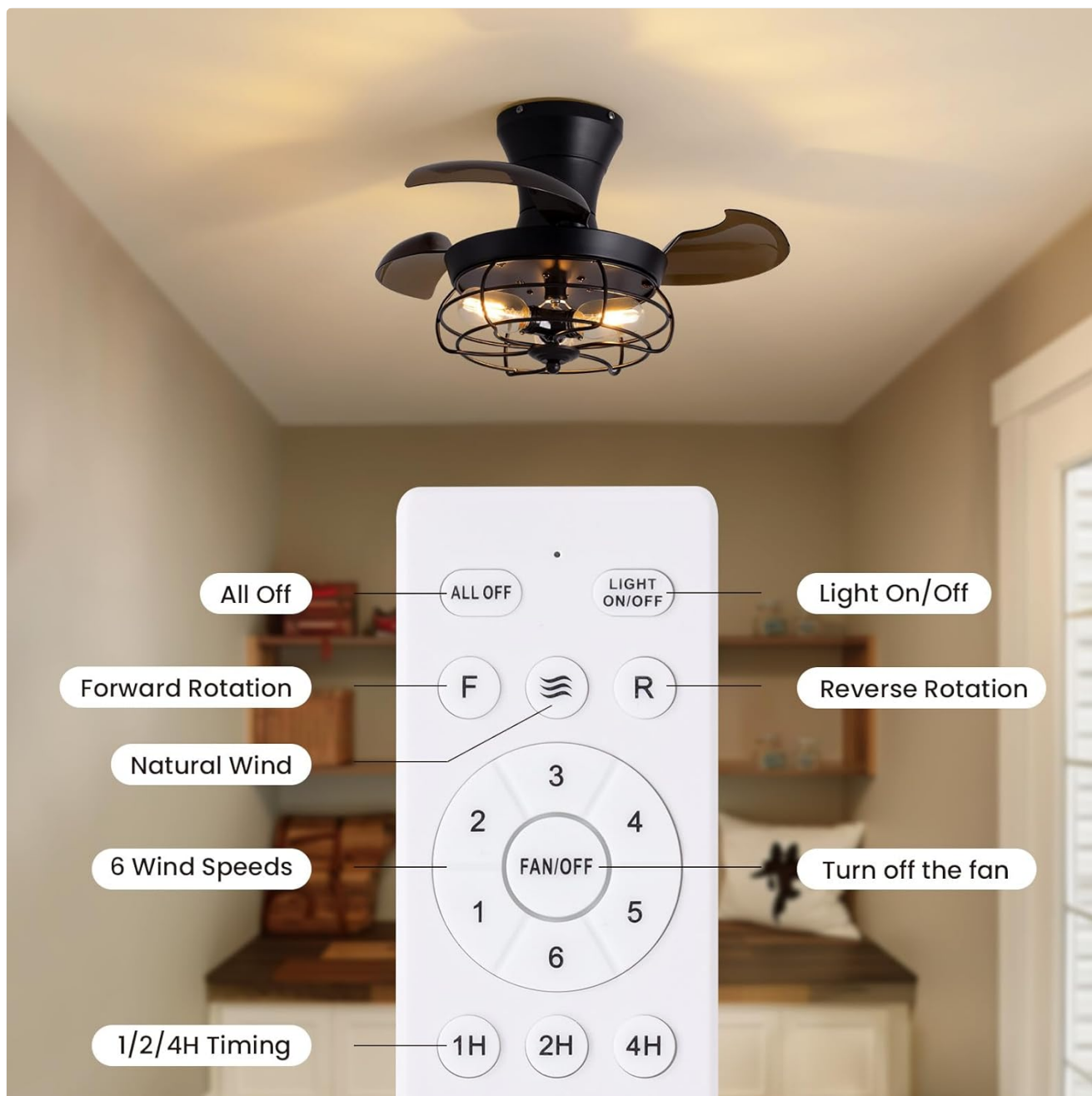
Figure 2: Remote control layout with functions for fan speed, light, and timer settings.