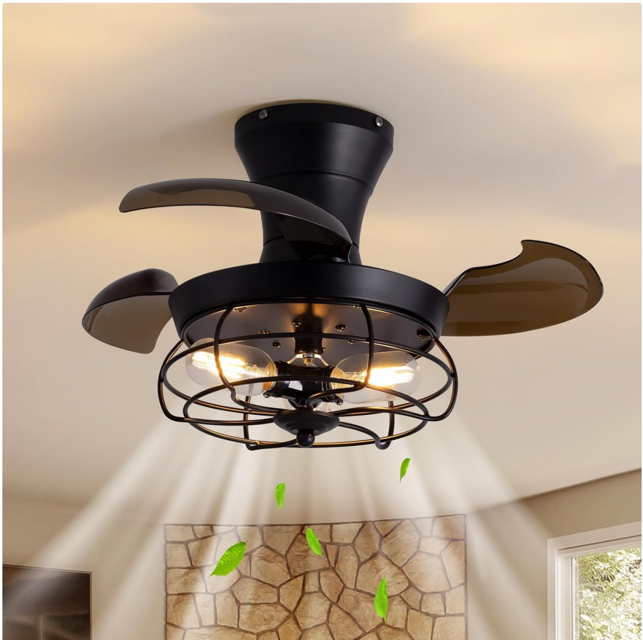
Figure 1: The CROSSIO 22-inch Retractable Ceiling Fan with Lights, showcasing its black caged design and retractable blades.