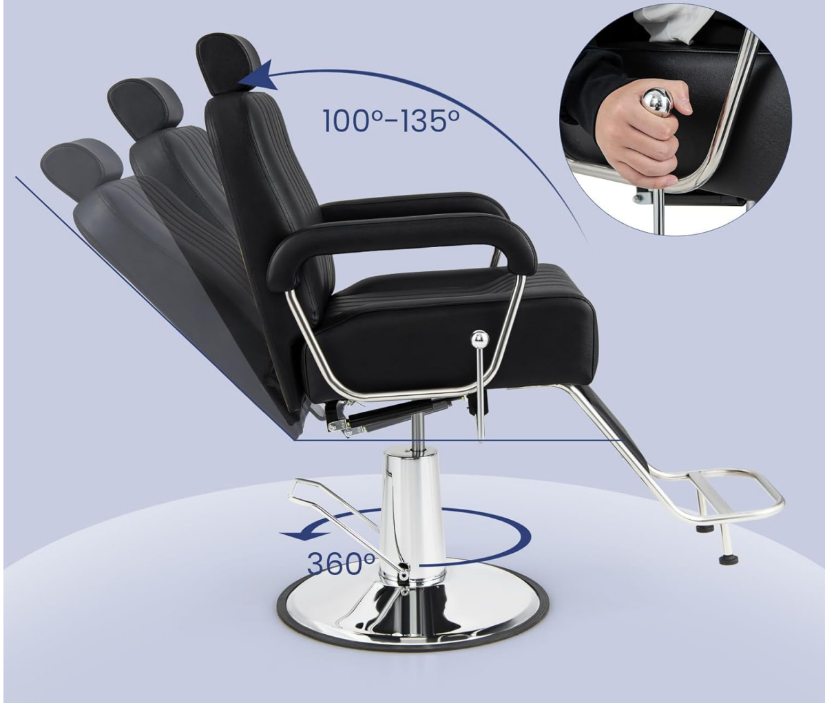
Image: The chair features a 360° swivel and a backrest that reclines from 100° to 135°.