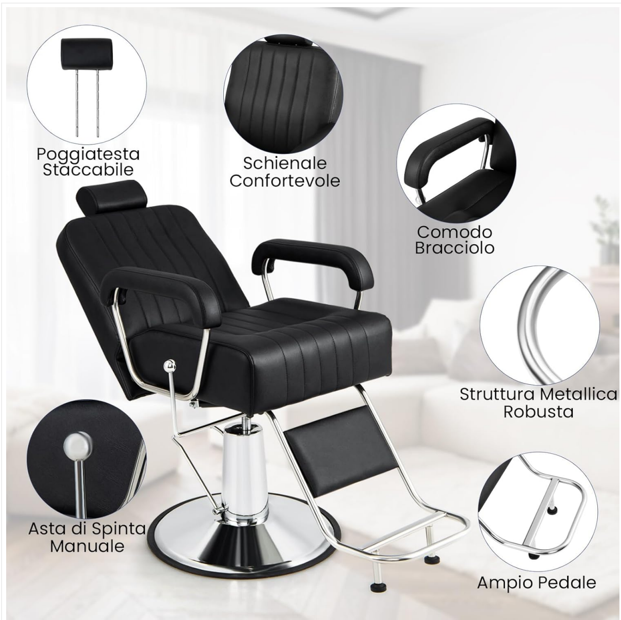
Image: Overview of RELAX4LIFE Swivel Barber Chair components. Key parts include the detachable headrest, comfortable backrest, armrest, robust metal structure, manual push rod, and wide foot pedal.