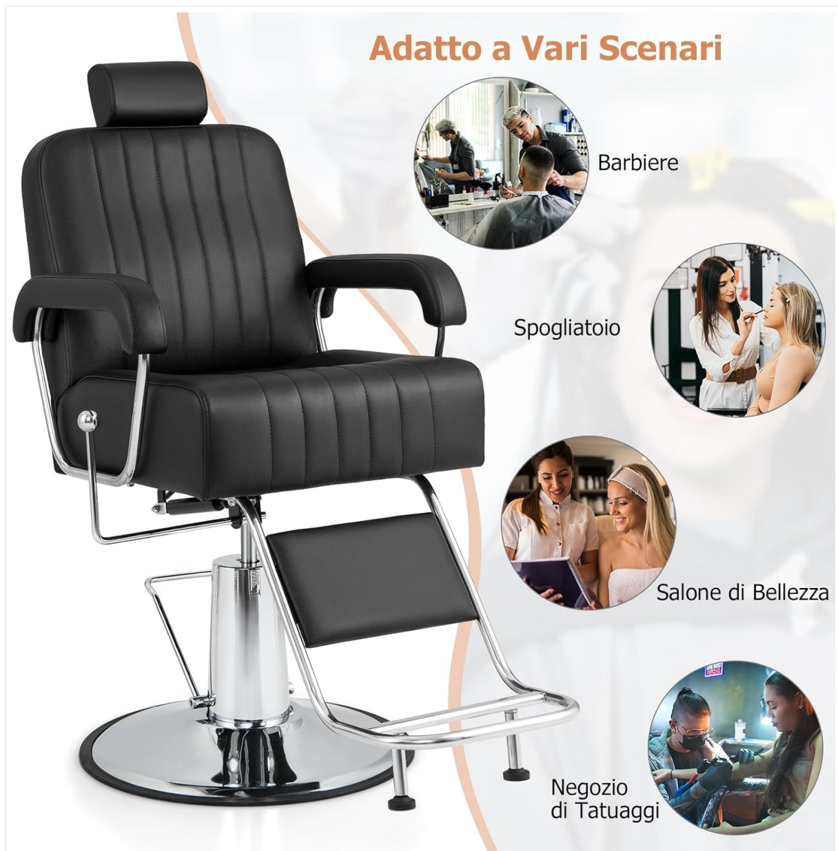
Image: The RELAX4LIFE Barber Chair is suitable for various professional scenarios, including barber shops, dressing rooms, beauty salons, and tattoo shops.

If you have any questions, require assistance with assembly, or need troubleshooting support, please contact RELAX4LIFE customer service. Refer to your purchase documentation for contact details or visit the official RELAX4LIFE website.