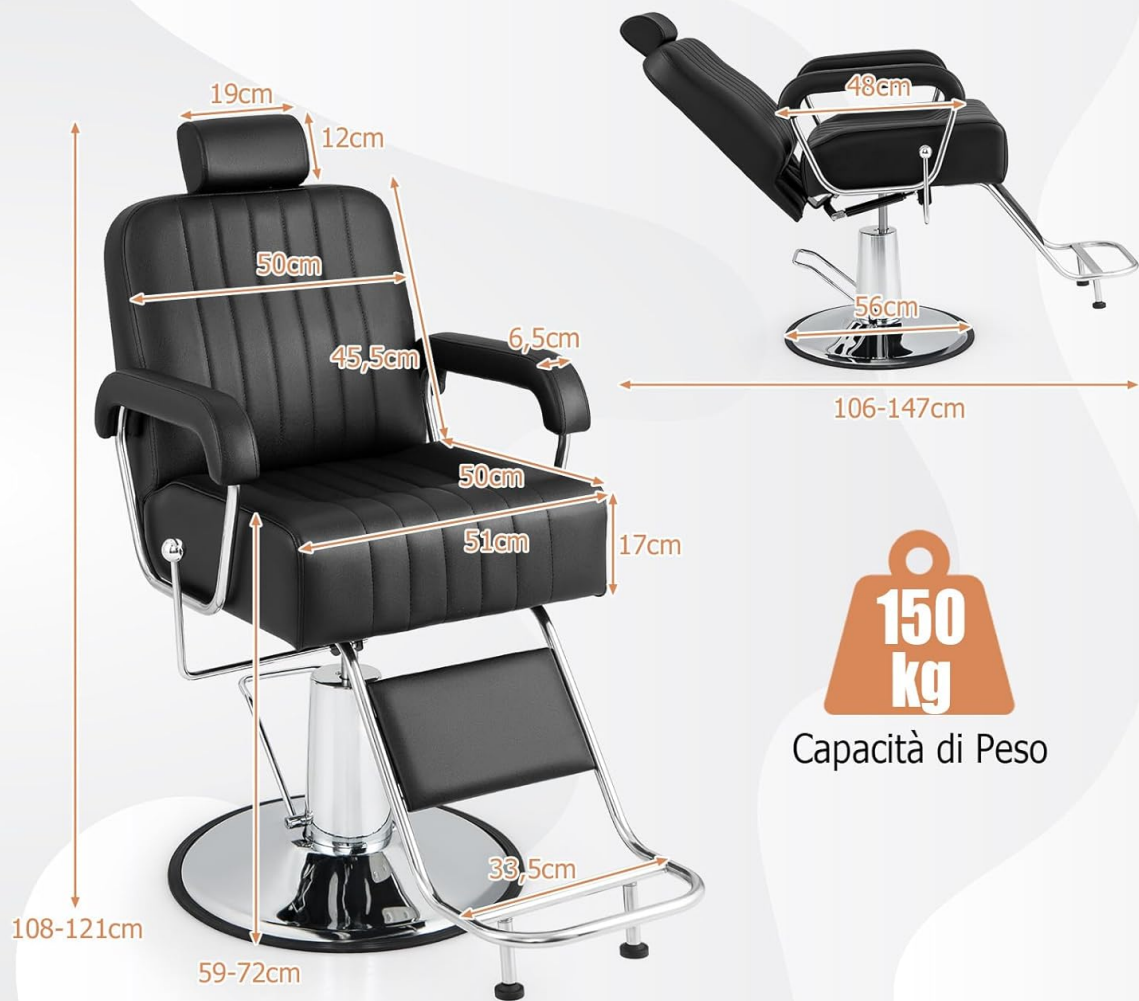
Image: Detailed product dimensions of the RELAX4LIFE Barber Chair, illustrating various measurements and indicating a 150 kg weight capacity.