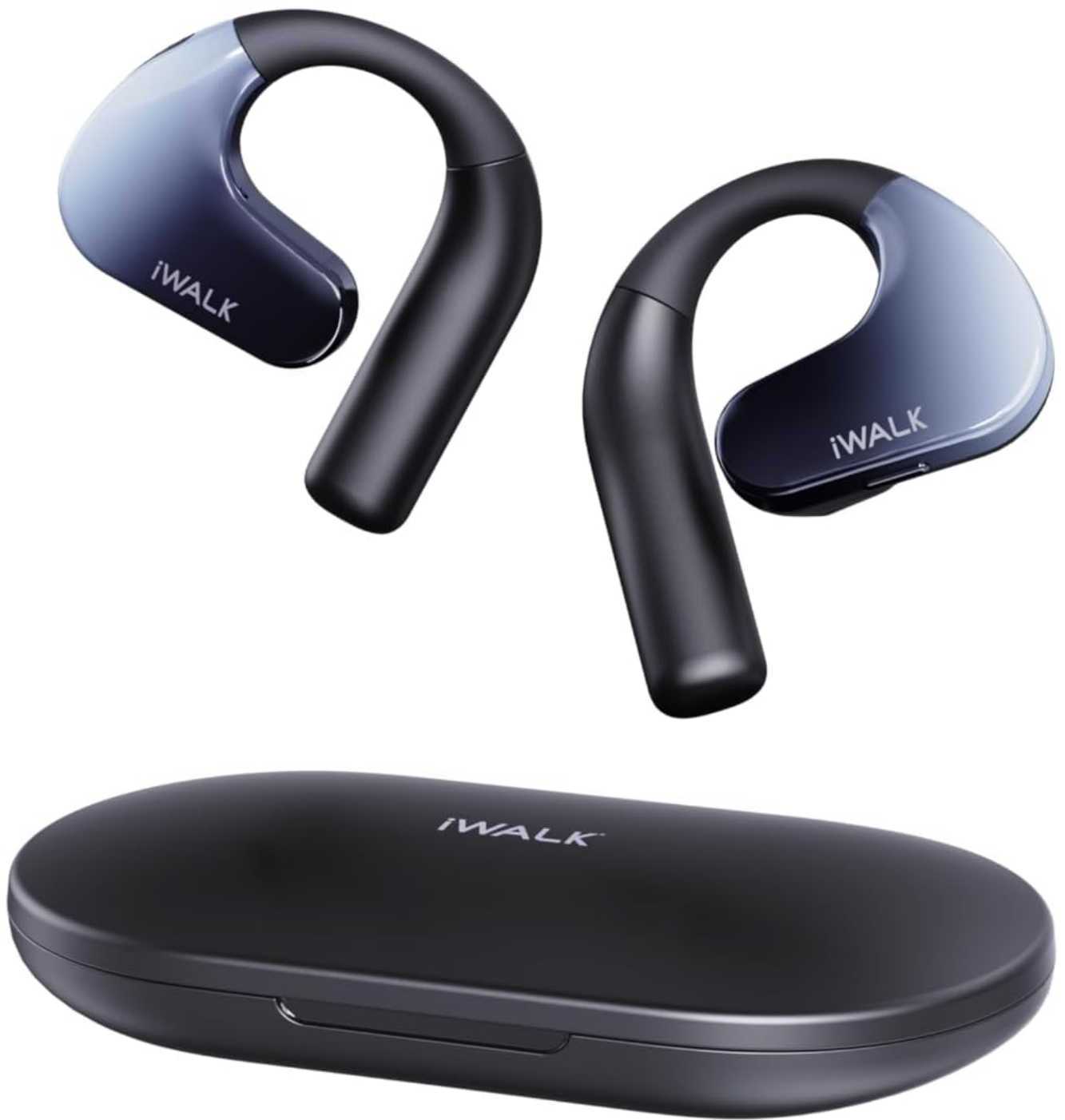
The iWALK Open Ear Headphones (Model BTC004) with their sleek design and portable charging case.