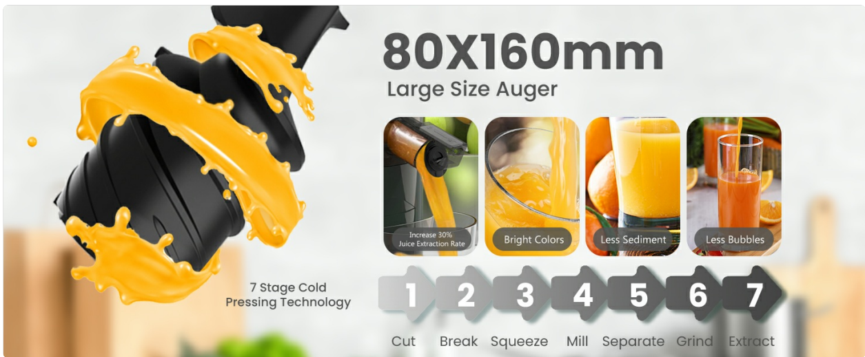
Figure 4: The 80x160mm large spiral auger uses 7-stage cold pressing technology for high juice extraction.