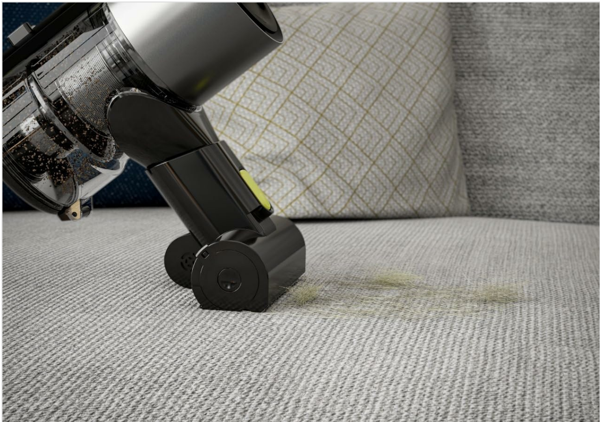
Image: The pet (mini turbo) brush attachment effectively removing pet hair from upholstered furniture.