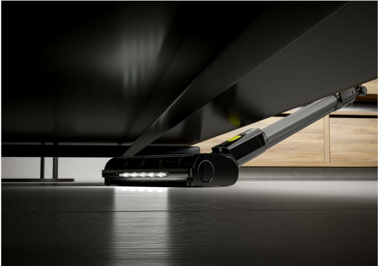
Image: The vacuum cleaner head extended flat to clean beneath a low piece of furniture.

Image: The vacuum cleaner positioned to clean under a sofa, demonstrating its flexible design.