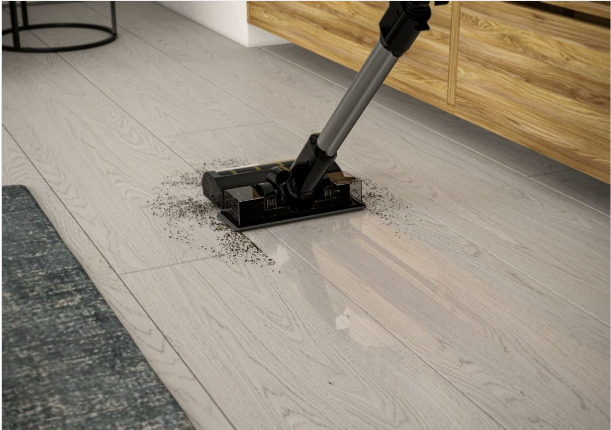
Image: The vacuum cleaner effectively removing debris from a hard floor surface.

Use the motorized floor nozzle for cleaning carpets and hard floors. The flexible design allows for easy maneuverability.