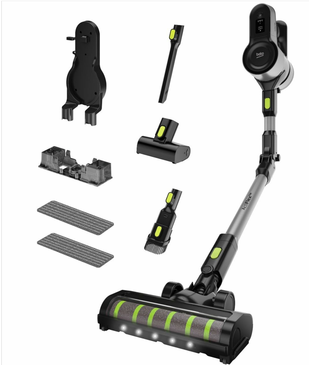
Image: All included components of the Beko Cordless Vacuum Cleaner, including the main unit, extension wand, floor nozzle, and various attachments.