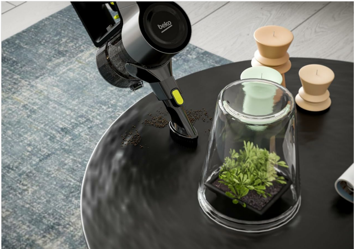
Image: The dusting brush attachment being used to clean debris from a table surface.