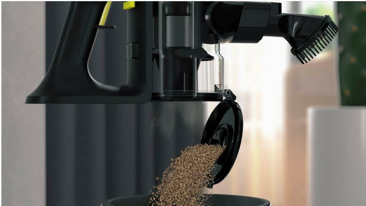
Image: The dust container being emptied into a waste bin, showing the collected debris.