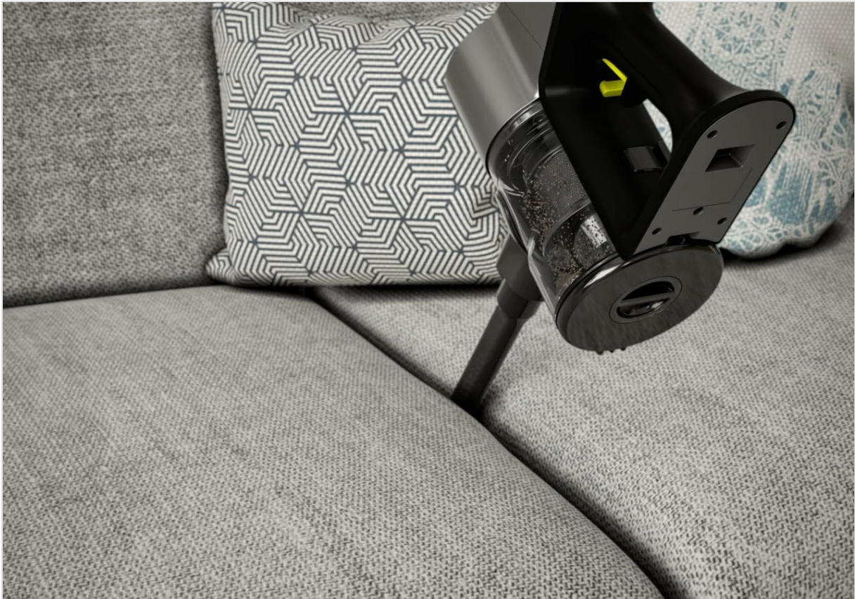
Image: The crevice tool attached to the vacuum, cleaning a narrow gap in a sofa.