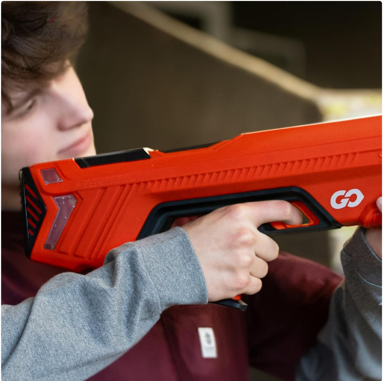
Image: A user holding and aiming the SPYRA Electric Water Gun Blaster, ready for action.

4. The blaster is capable of blasting water up to 26 feet.