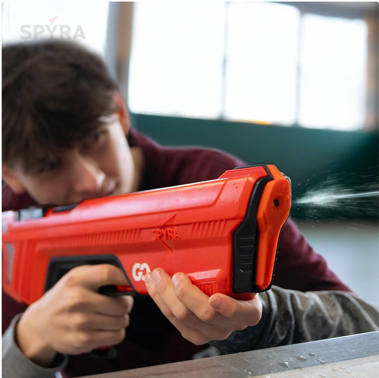
Image: A user firing the SPYRA Electric Water Gun Blaster, demonstrating its powerful water stream.