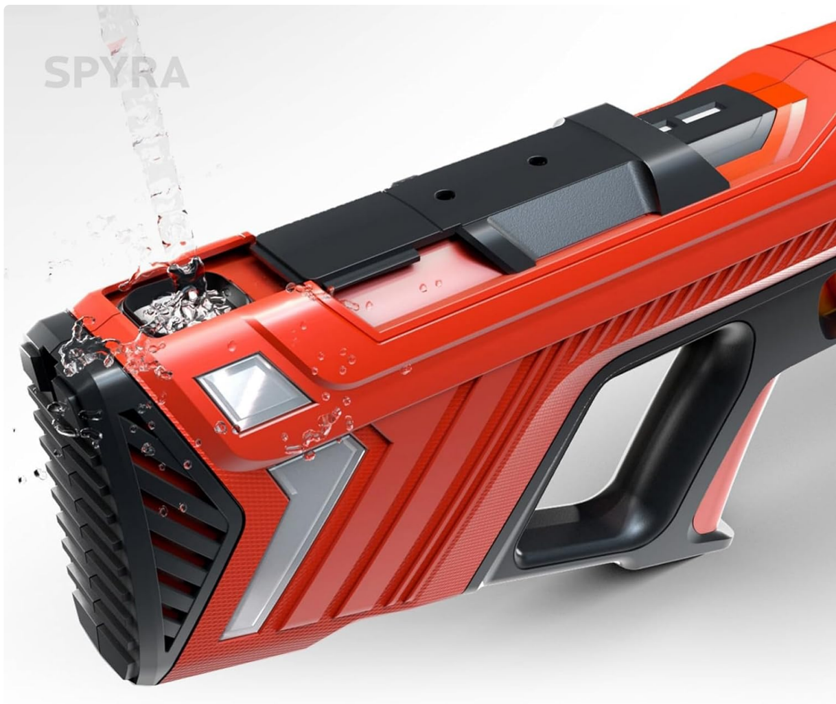
Image: The SPYRA Electric Water Gun Blaster being refilled with water using the tank slider.