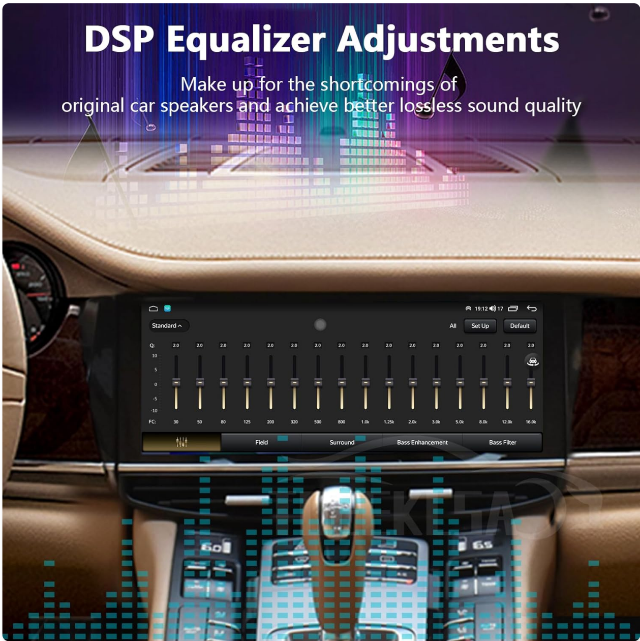
Image: The screen displaying the DSP equalizer interface with various frequency and sound enhancement controls.