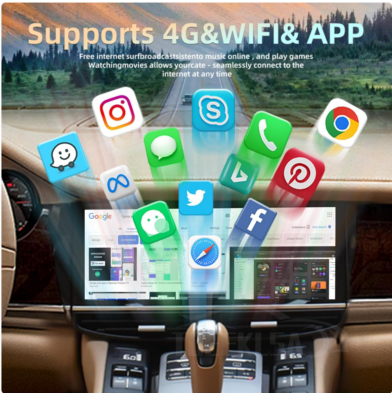
Image: The head unit screen showing various applications and a web browser, demonstrating 4G and WiFi connectivity.