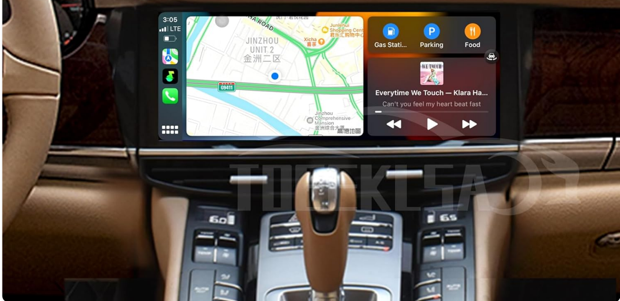
Image: The head unit displaying a GPS navigation map with various points of interest and route information.