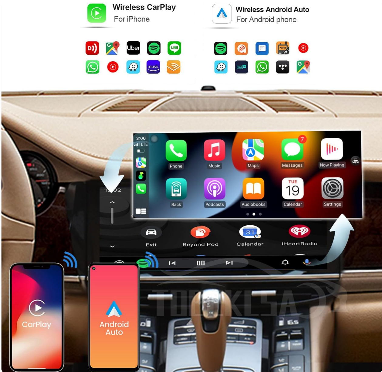
Image: The screen displaying the Wireless CarPlay and Android Auto interfaces, showing various app icons and phone connectivity options.

Video: A demonstration of how to connect and use wireless CarPlay and Android Auto with the head unit.