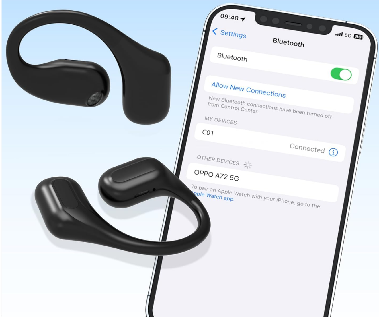
Image 2.3: Visual guide demonstrating the one-step auto-pairing process with a smartphone's Bluetooth settings.