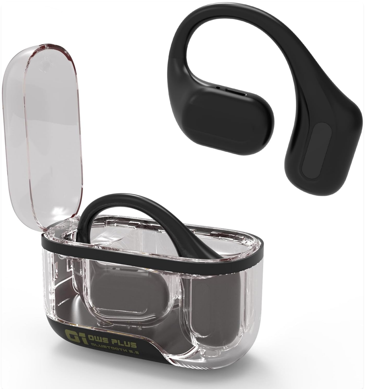
Image 1.1: AMAFACE Open Ear Headphones with their transparent charging case.