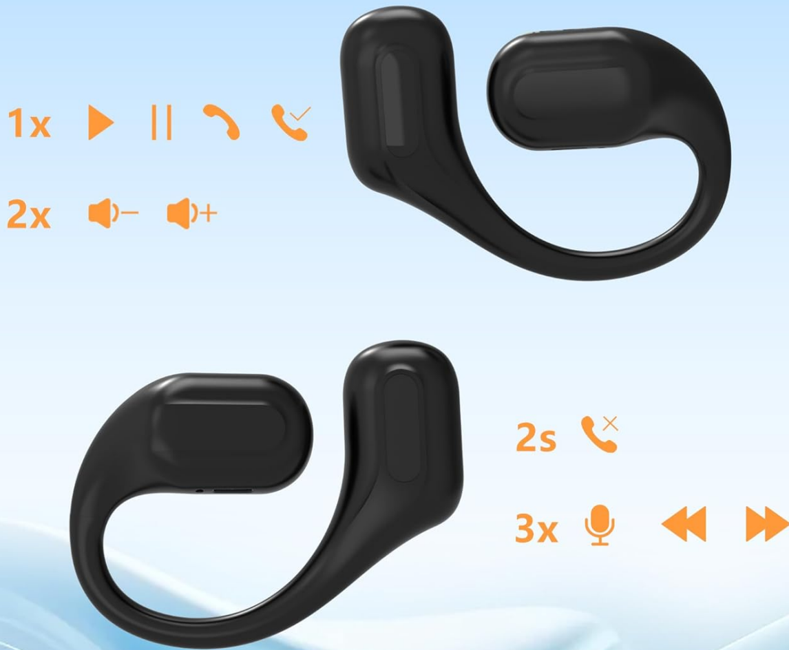
Image 3.1: Detailed guide to the touch controls for music playback and call management on the earbuds.