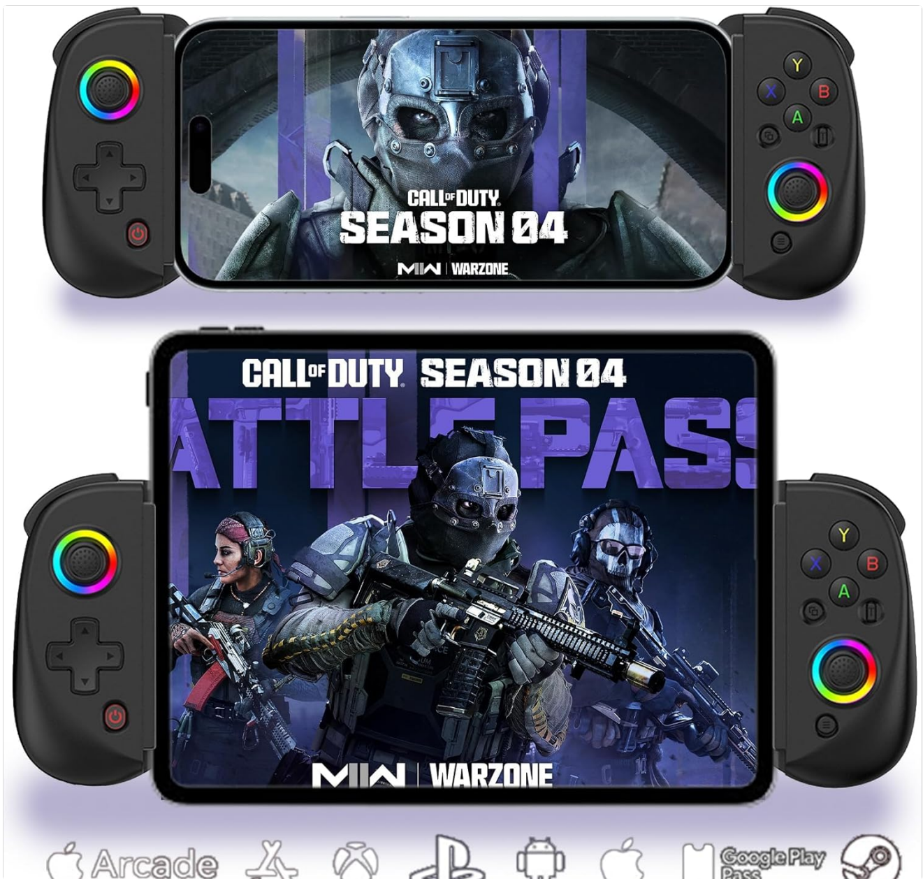
Image: The Megadream D8 Game Controller and its packaging. The image shows the controller in its box, highlighting its design and compatibility.