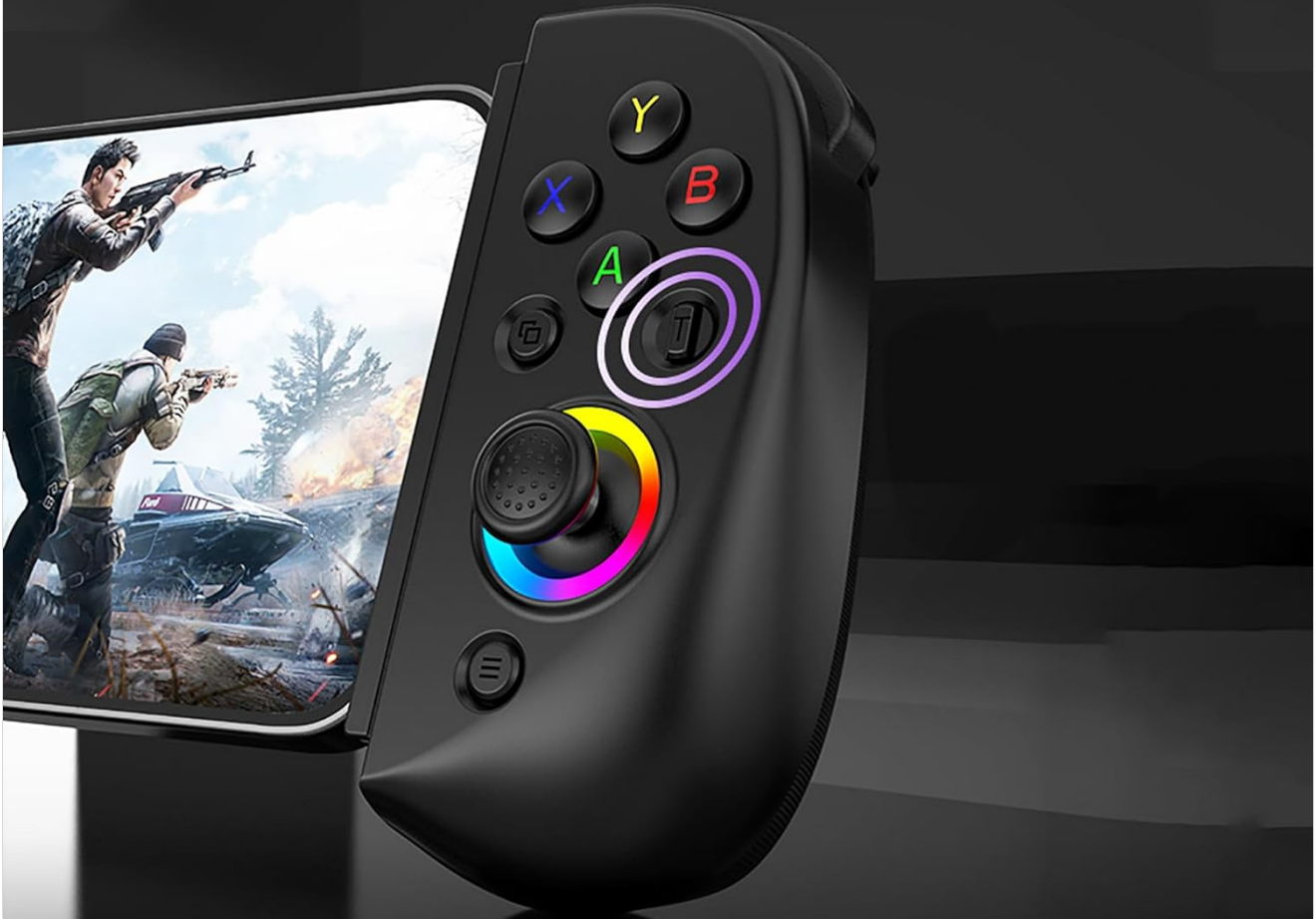
Image: A detailed view of the linear trigger (LT) button, designed for quick and precise responses in gameplay.

[ターボ+ファンクションキー]でコンボ機能を設定。 ファンクションキーを押し続けることで N回押すのと同じ効果があり、攻撃を繰り返し敵を簡単に倒すことができる。