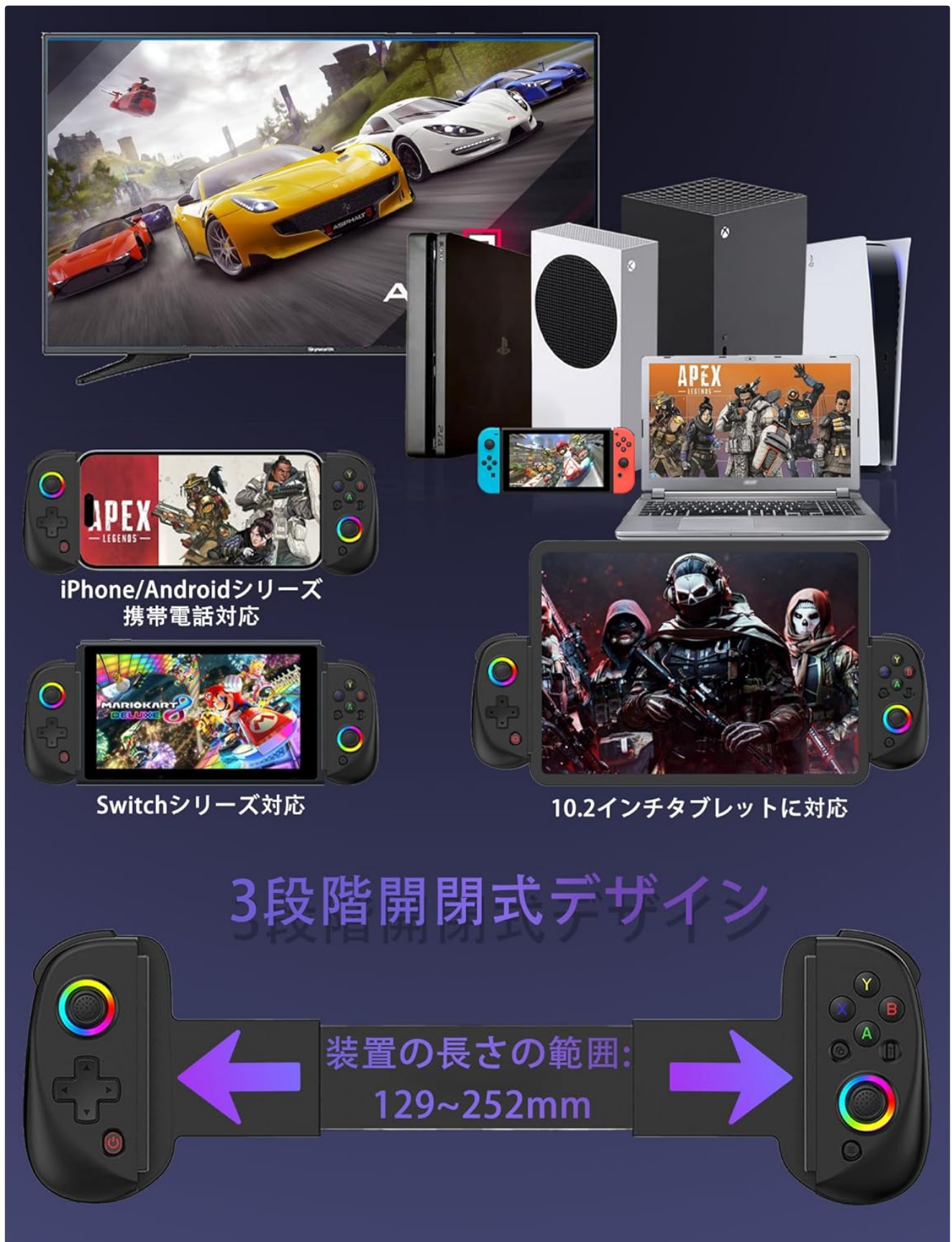
Image: The Megadream D8 controller holding a smartphone, demonstrating its adjustable length feature. The controller can extend up to 252mm.