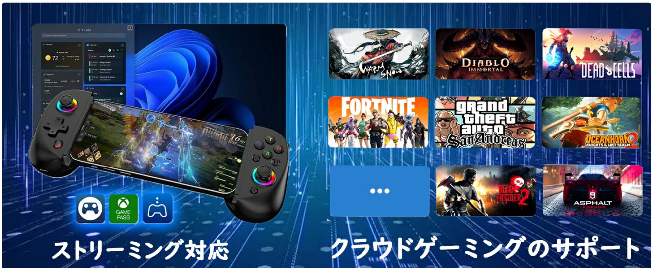
Image: The controller shown with a device displaying a game being streamed, highlighting its streaming capabilities.