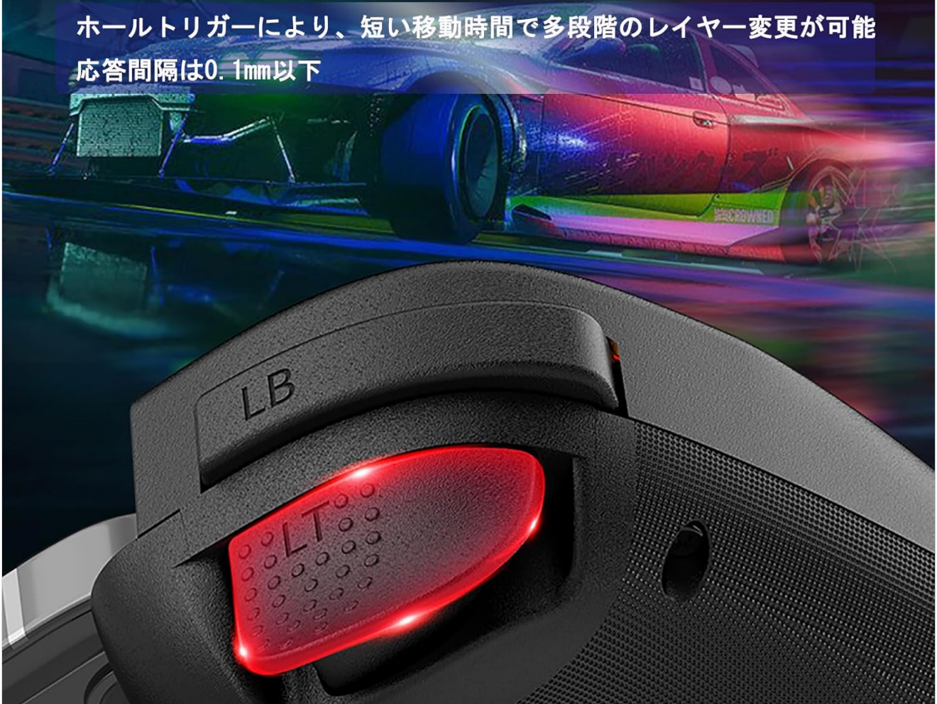
Image: The Megadream D8 controller with a Nintendo Switch inserted, ready for gameplay.

ホールトリガーにより、短い移動時間で多段階のレイヤー変更が可能 応答間隔は0.1mm以下