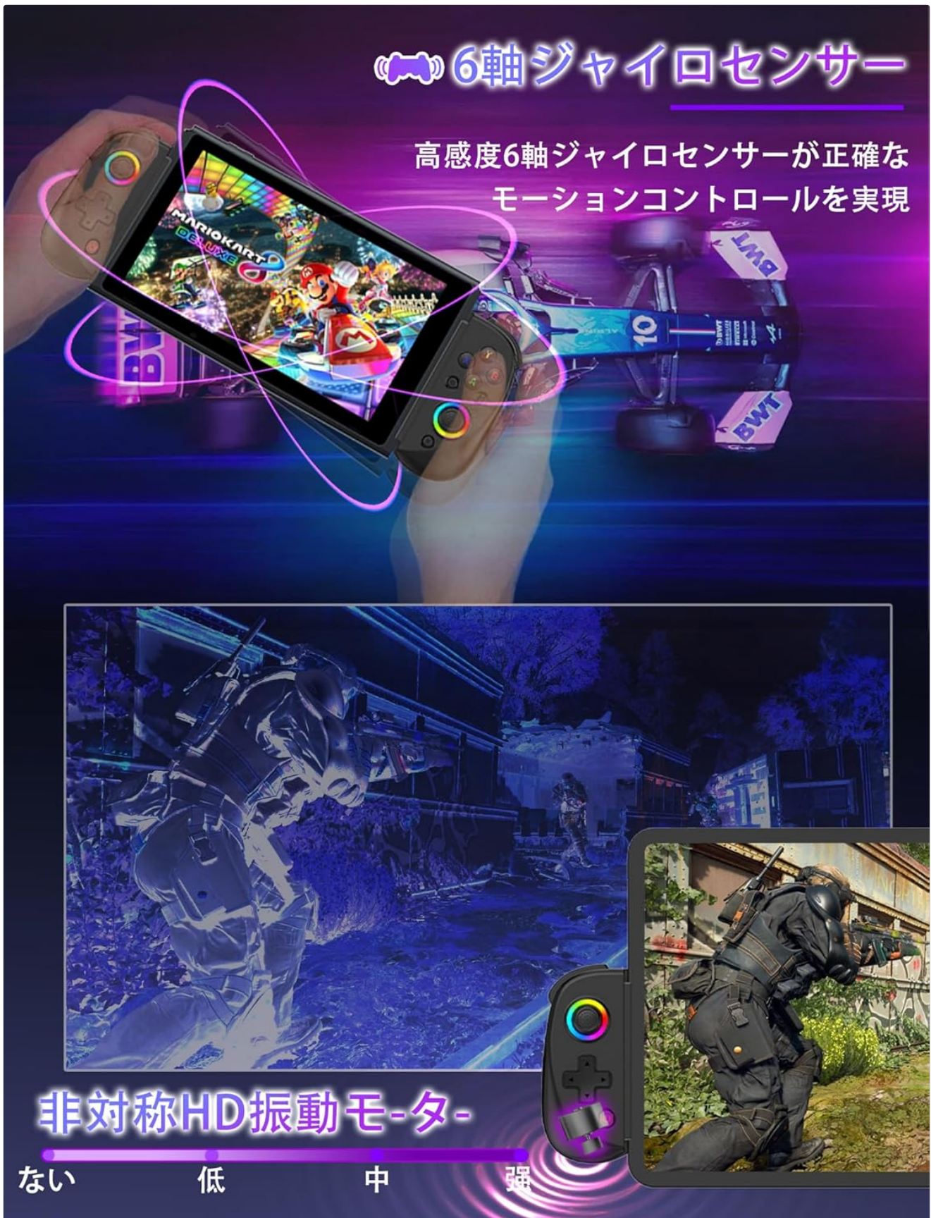
Image: This image illustrates the 6-axis gyroscope for motion control and the adjustable motor vibration feature, enhancing immersion during gameplay.

Adjust the motor vibration intensity by pressing the Turbo button and moving the right stick up or down. There are four levels: None, Weak, Medium, and Strong, providing immersive feedback. (Available for PC/N-Switch/PS4/5 only).