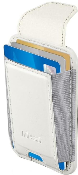
Image: The Miroddi MF38 MagSafe Wallet in White, securely attached to the back of an iPhone.