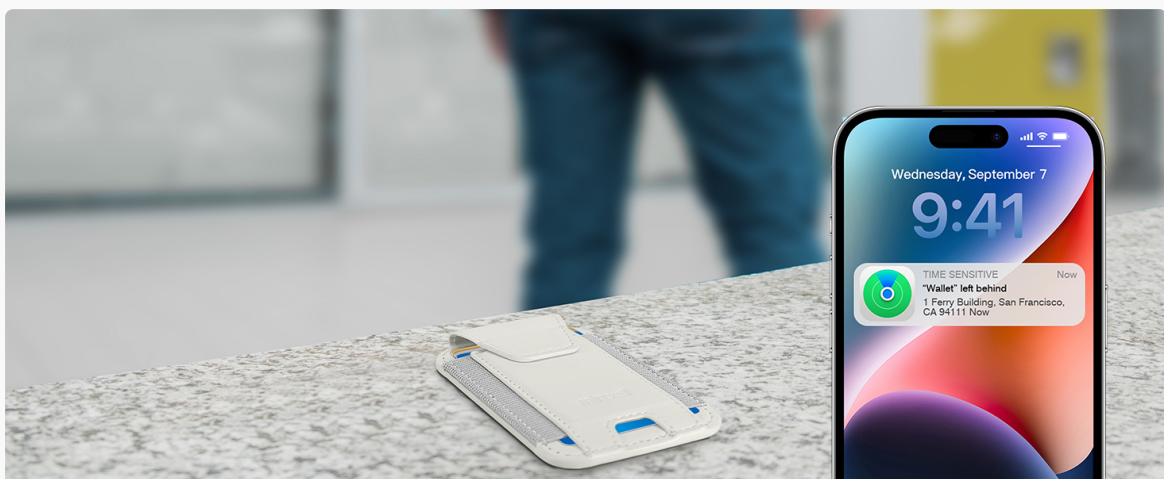
Image: Visual guide demonstrating the four steps to pair, locate, play sound, and find your Miroddi wallet using the Find My app.