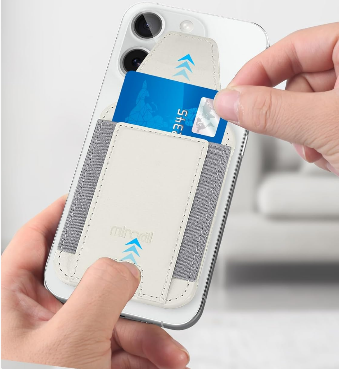
Image: The Miroddi MagSafe Wallet protecting cards from unauthorized scanning at a payment terminal.

Conveniently holds up to 7 cards and cash