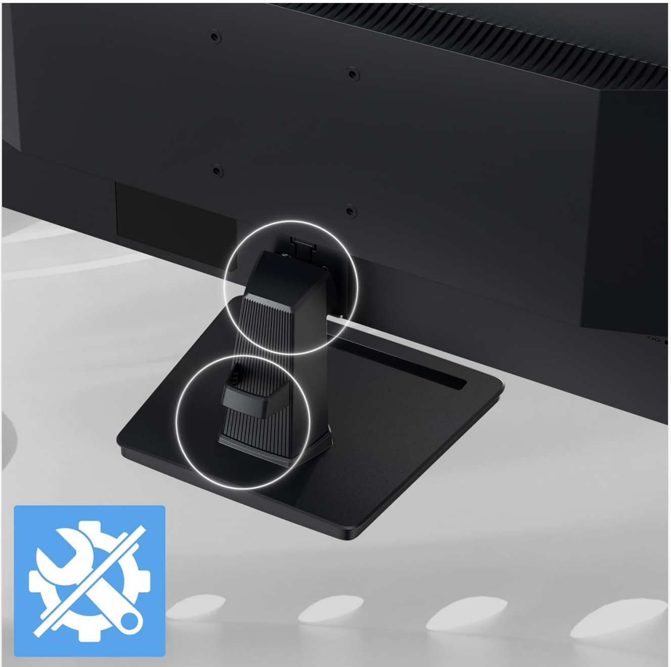
Image: Rear of the monitor indicating the 100mm VESA mounting screw holes.