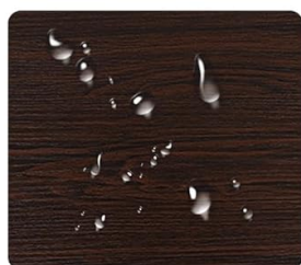
MDF Board & Waterproof