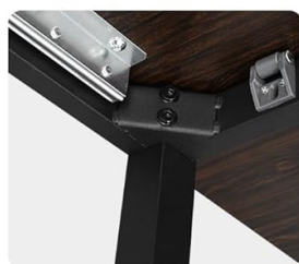
Reinforced Steel Structure