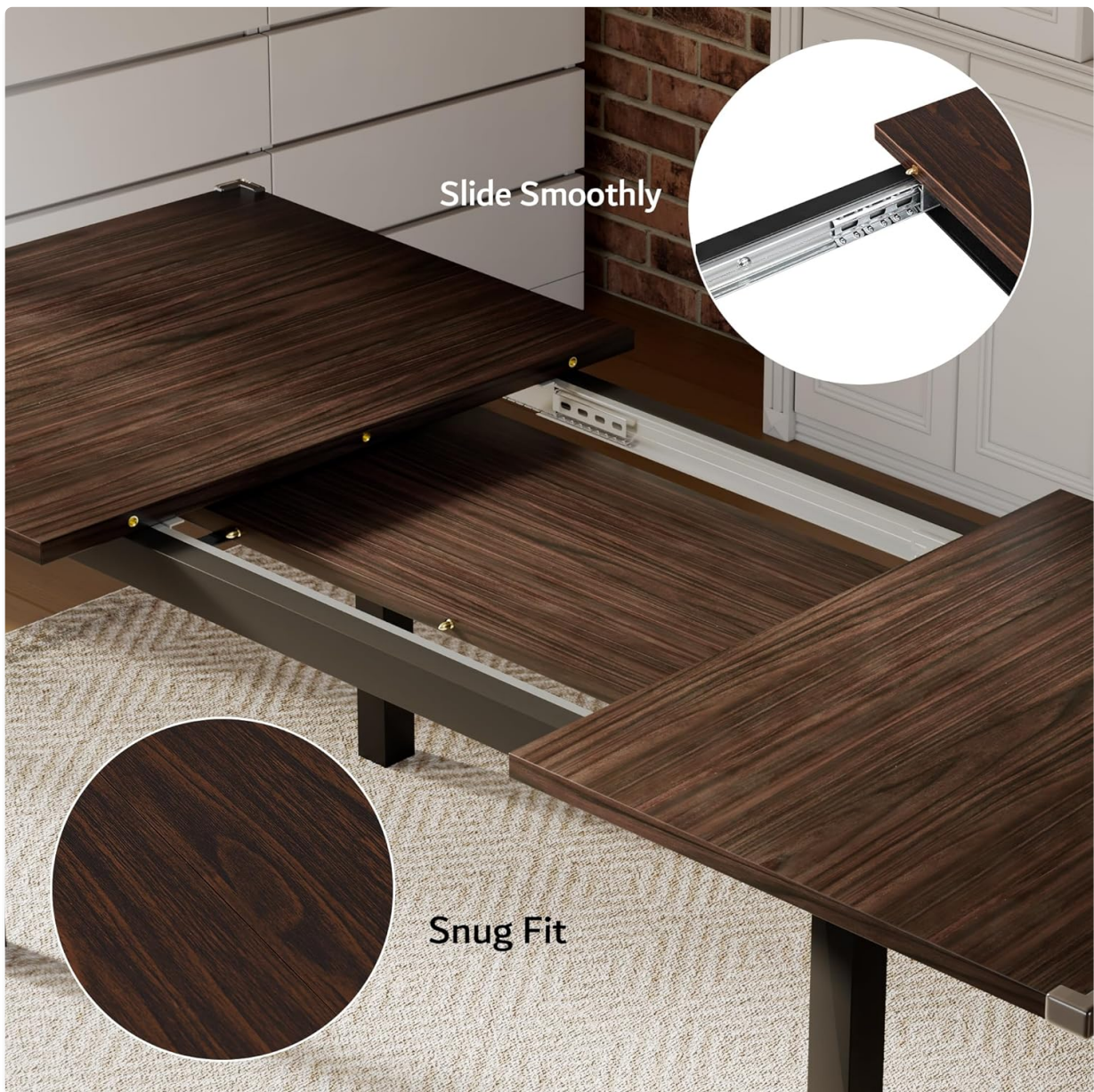
Figure 4: Smooth sliding mechanism for table extension.