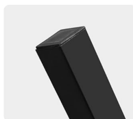
Anti-slip & Scratch resistance