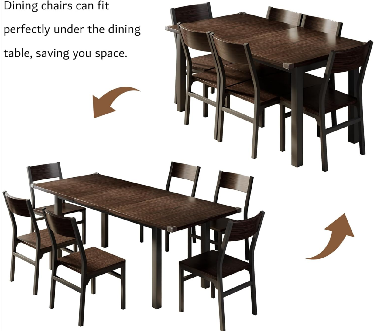
Figure 5: Chairs stored under the table for space efficiency.

Dining chairs can fit perfectly under the dining table, saving you space.