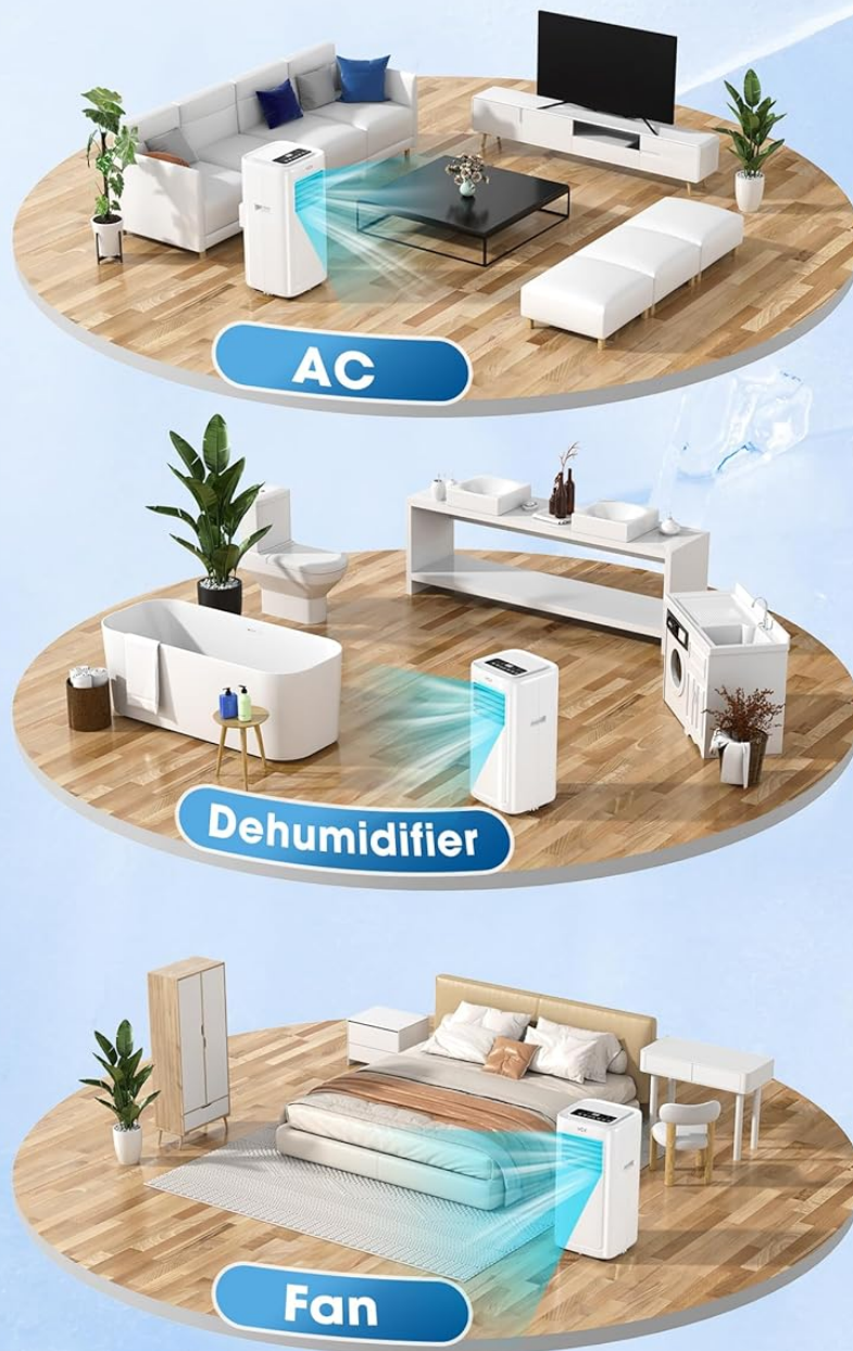
Image: An illustration demonstrating the three primary functions of the VCK Portable Air Conditioner: AC for cooling living spaces, Dehumidifier for bathrooms or laundry areas, and Fan for bedrooms, highlighting its versatility.

Anti Virus Filter can be used for a long time, easy to disassemble and easy to clean