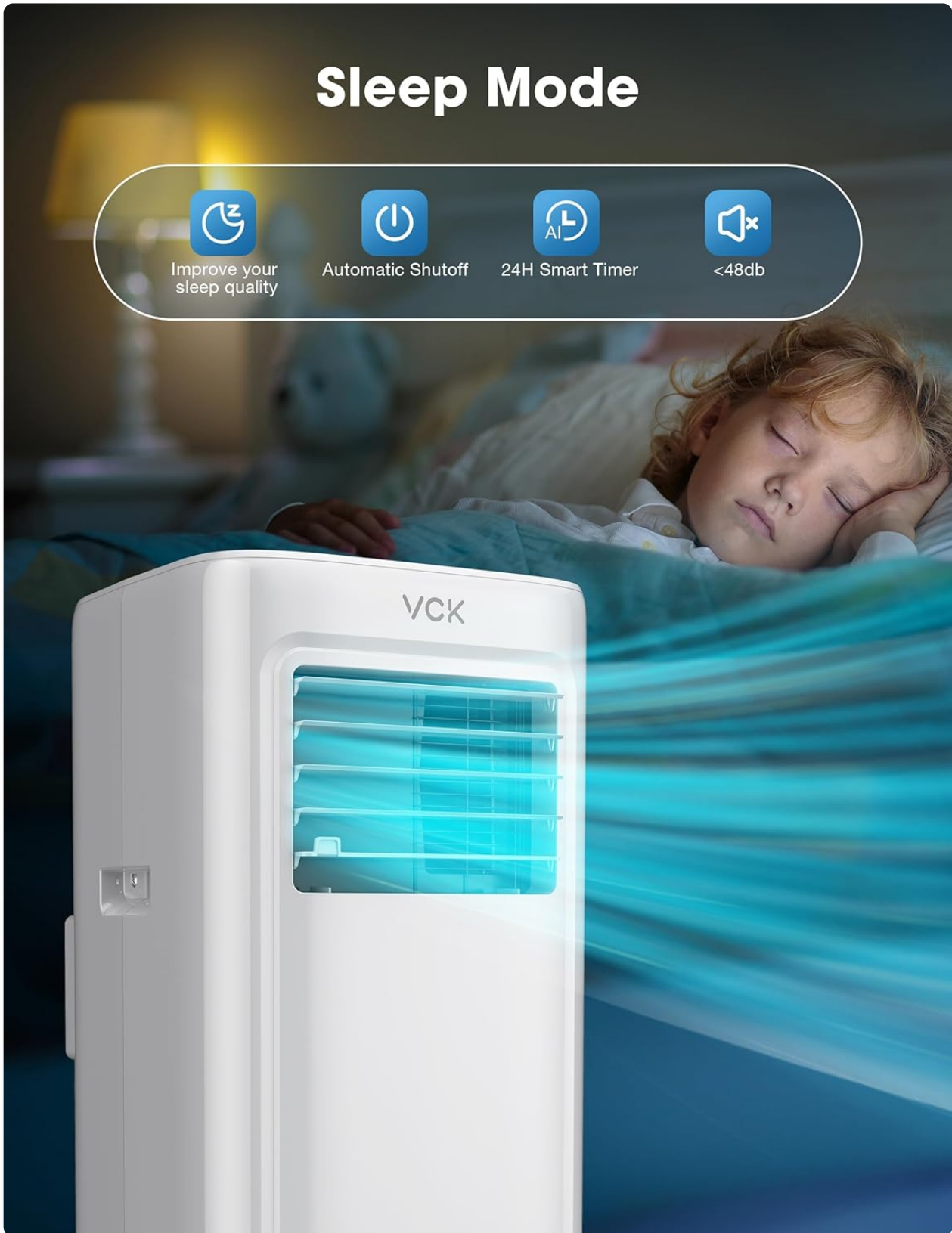
Image: The VCK Portable Air Conditioner operating in Sleep Mode, designed to improve sleep quality with automatic shutoff, 24-hour smart timer, and ultra-low noise levels below 48dB.

covering up to 300 sq. ft. with 8000 BTU/h cooling capacity and up to 50 Pints/day dehumidification.