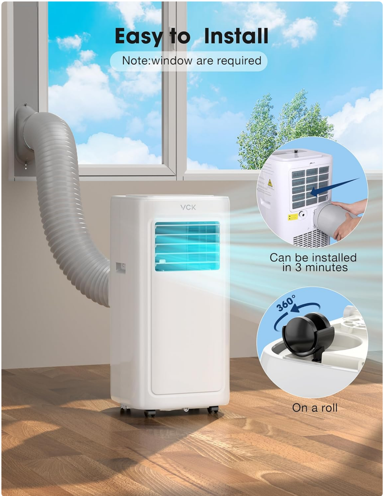
Image: The VCK Portable Air Conditioner connected to a window with its exhaust hose, demonstrating its easy installation process which can be completed in minutes. The unit also features 360-degree universal wheels for easy movement.