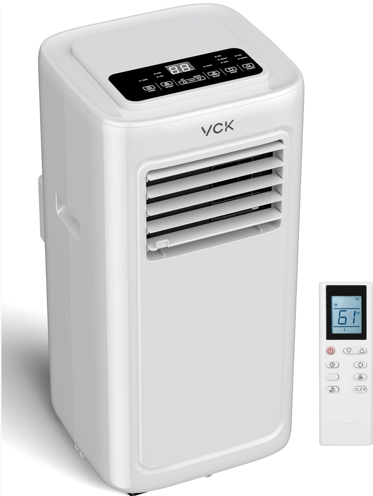
Image: The VCK Portable Air Conditioner unit shown with its remote control, highlighting its sleek design and compact form factor.