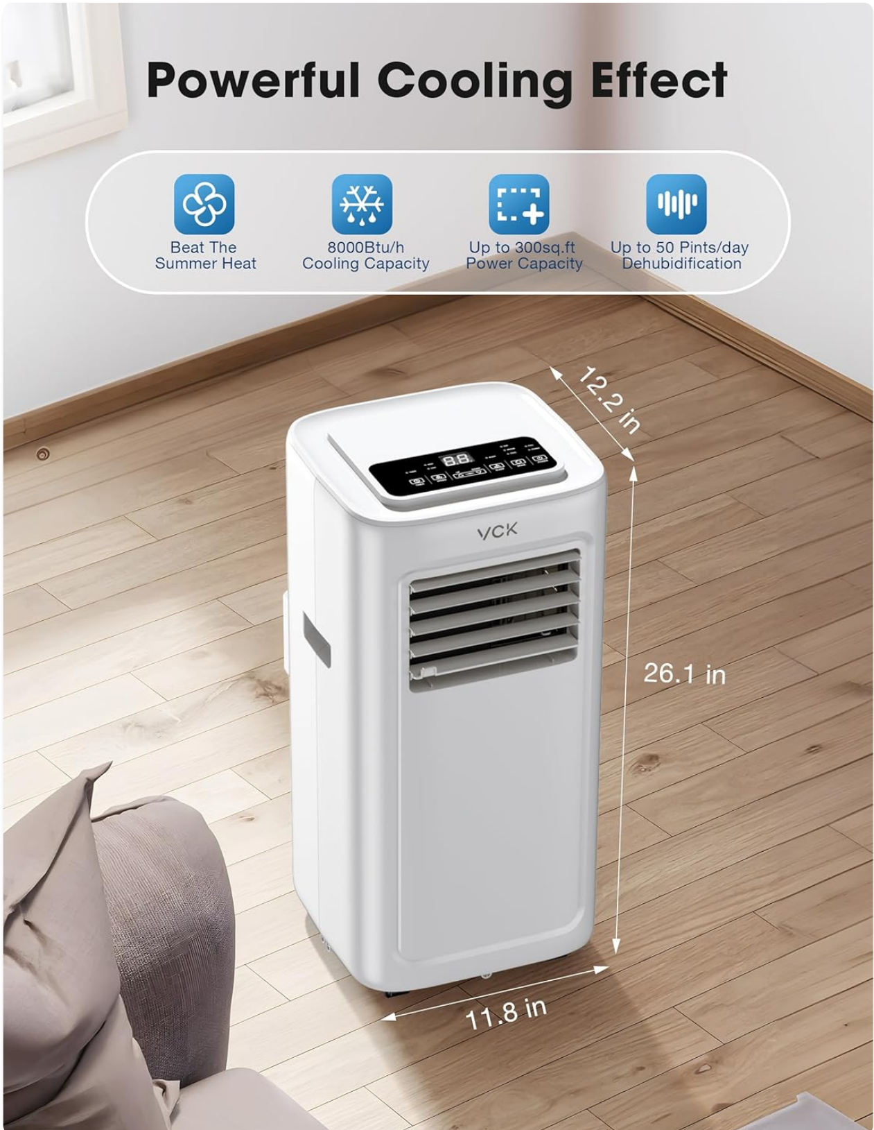
Image: Illustration showing the compact dimensions of the VCK Portable Air Conditioner and its powerful cooling effect,