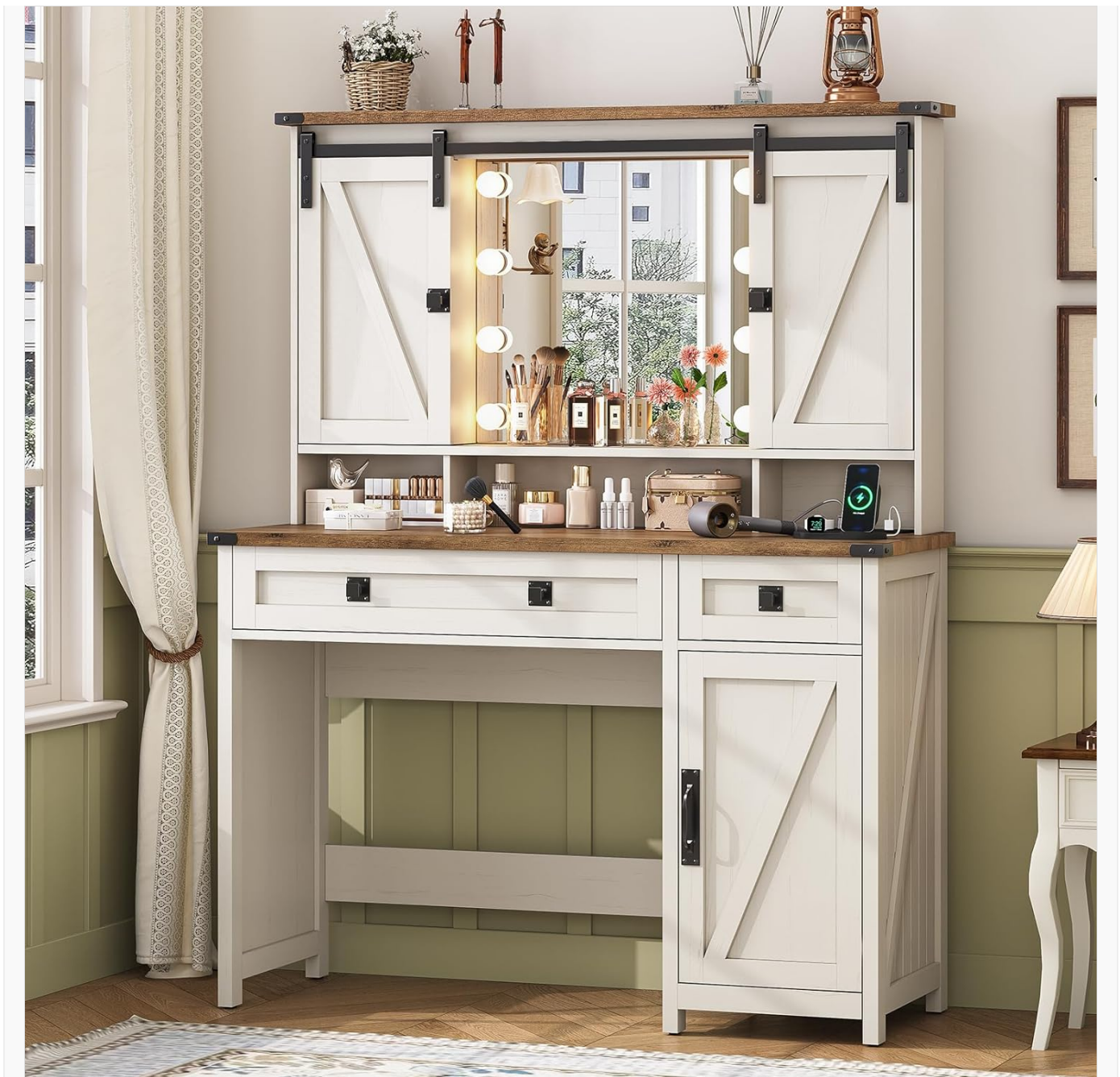
Image: The MSmask Farmhouse Vanity Desk in Antique White, showcasing its overall design with the mirror and lights exposed.