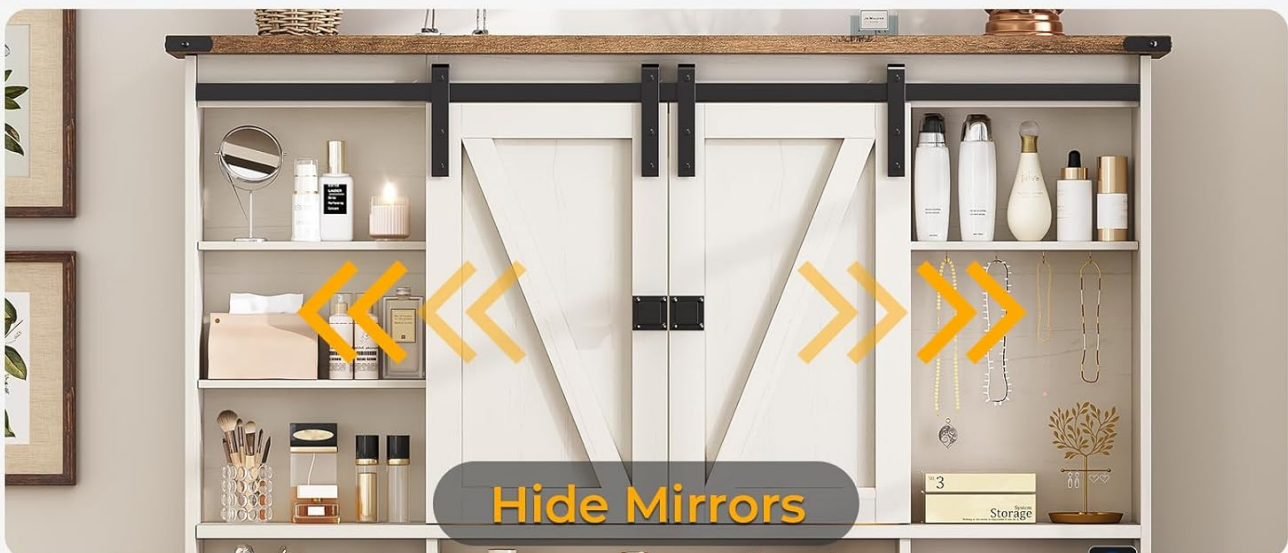
Image: The unique sliding barn door design of the vanity, illustrating how the doors can be positioned to hide either the mirror or the side storage shelves.