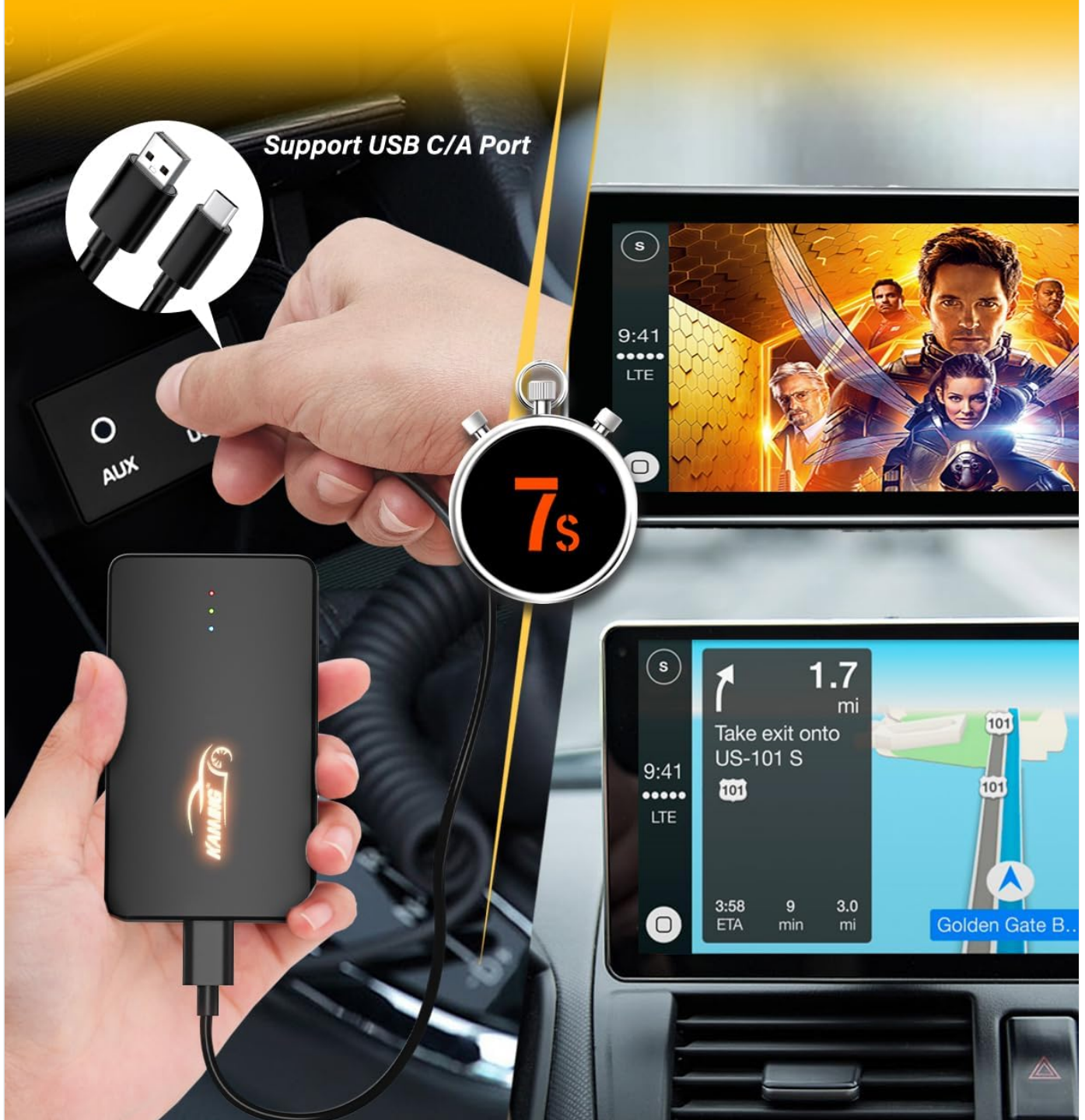
Image: The KAMING Wireless CarPlay Adapter connected to a car's USB port, highlighting its plug-and-play and auto-connect functionality, with a stopwatch indicating a 7-second connection time.

Once pair first time, it will auto-connect after that.