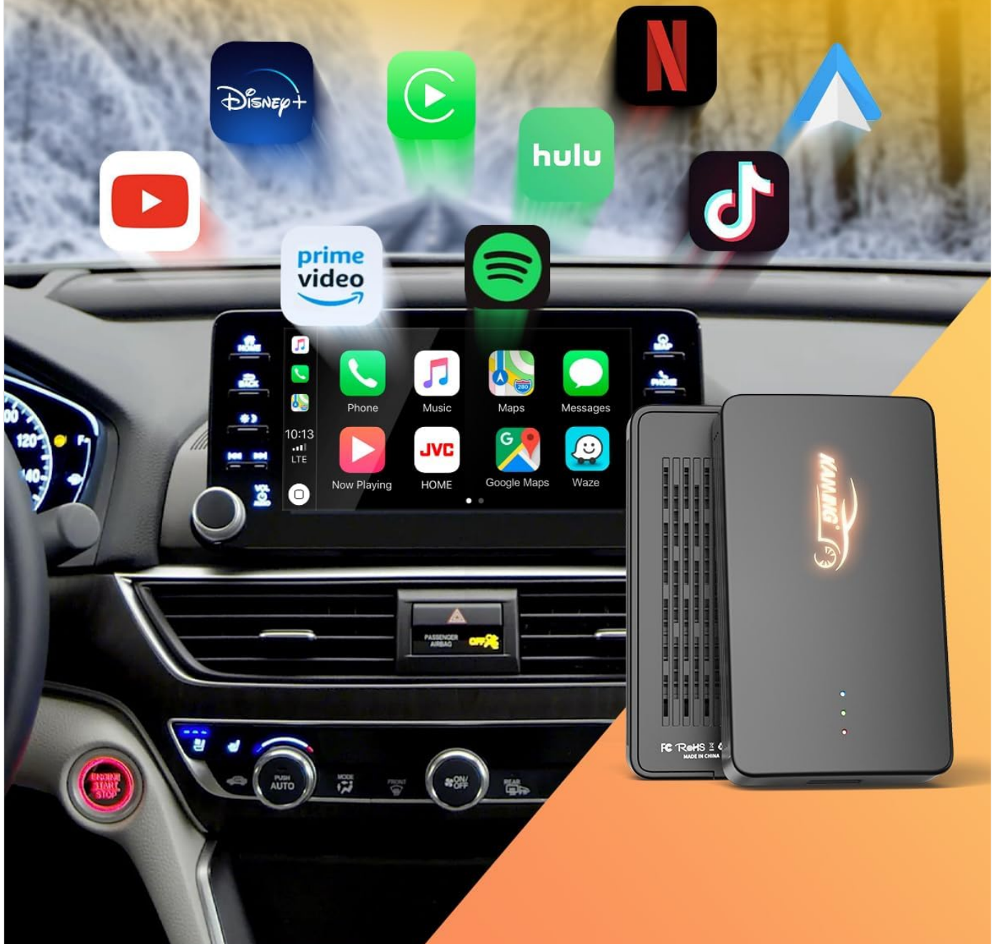
Image: A view inside a car, demonstrating the adapter's ability to enable streaming services like Netflix and YouTube directly on the car's display, enhancing in-car entertainment.

Support Netflix, Tiktok, Disney YouTubeTV and more