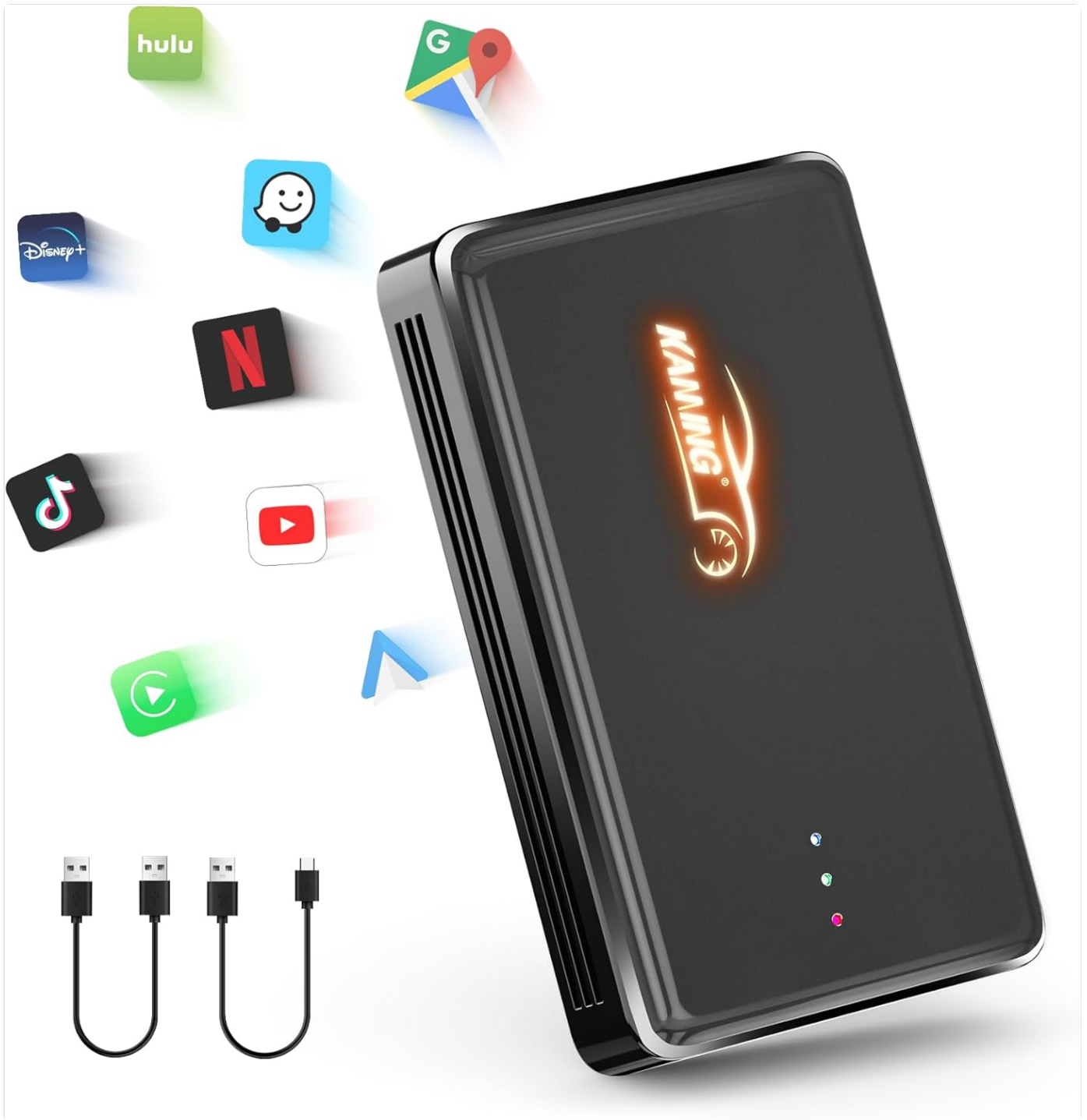
Image: The KAMING Wireless CarPlay Adapter displayed alongside icons of popular streaming and navigation apps, illustrating its broad compatibility and entertainment capabilities.