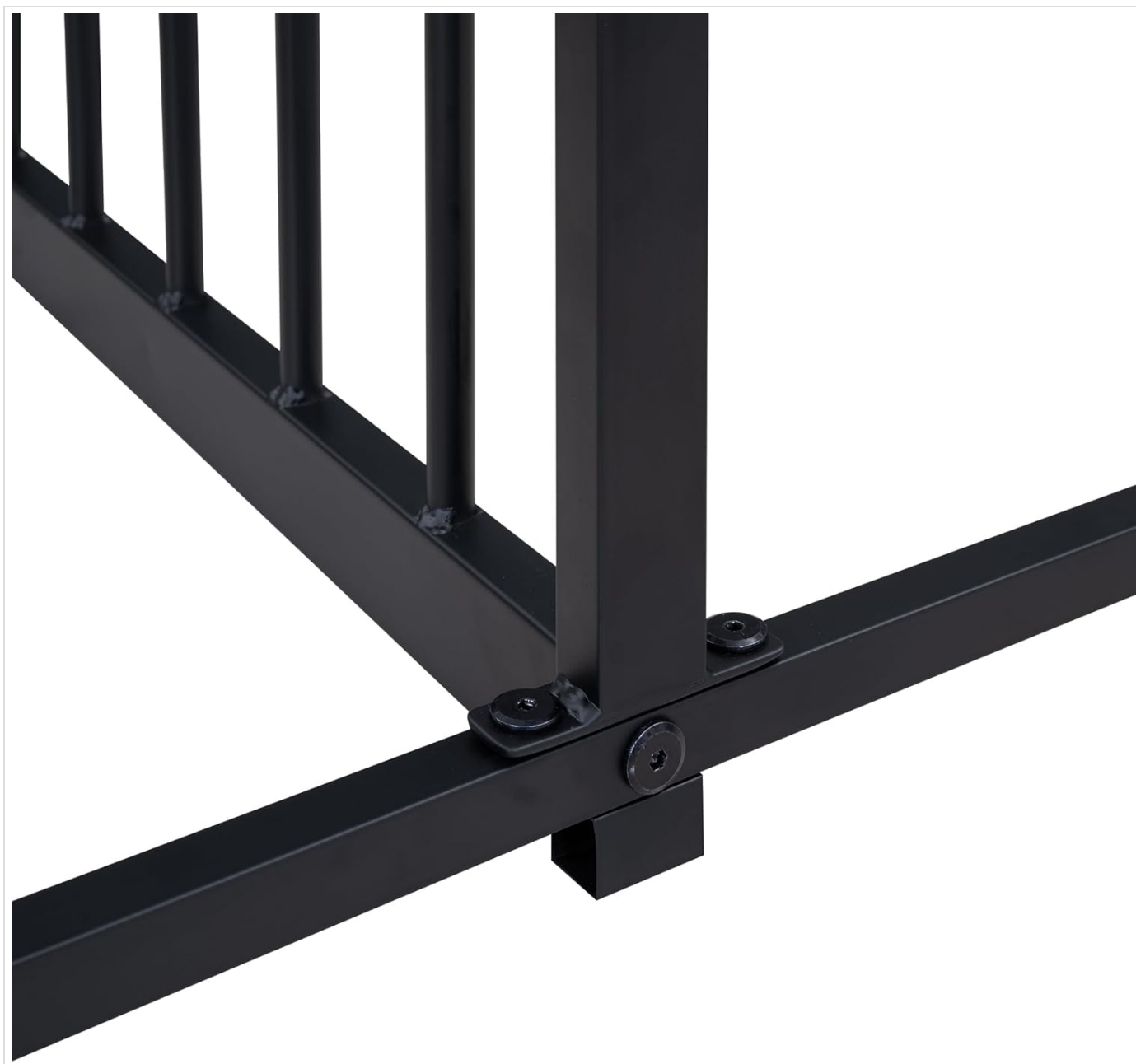
Figure 3: Detail of a typical joint connection, illustrating how components are secured during assembly.