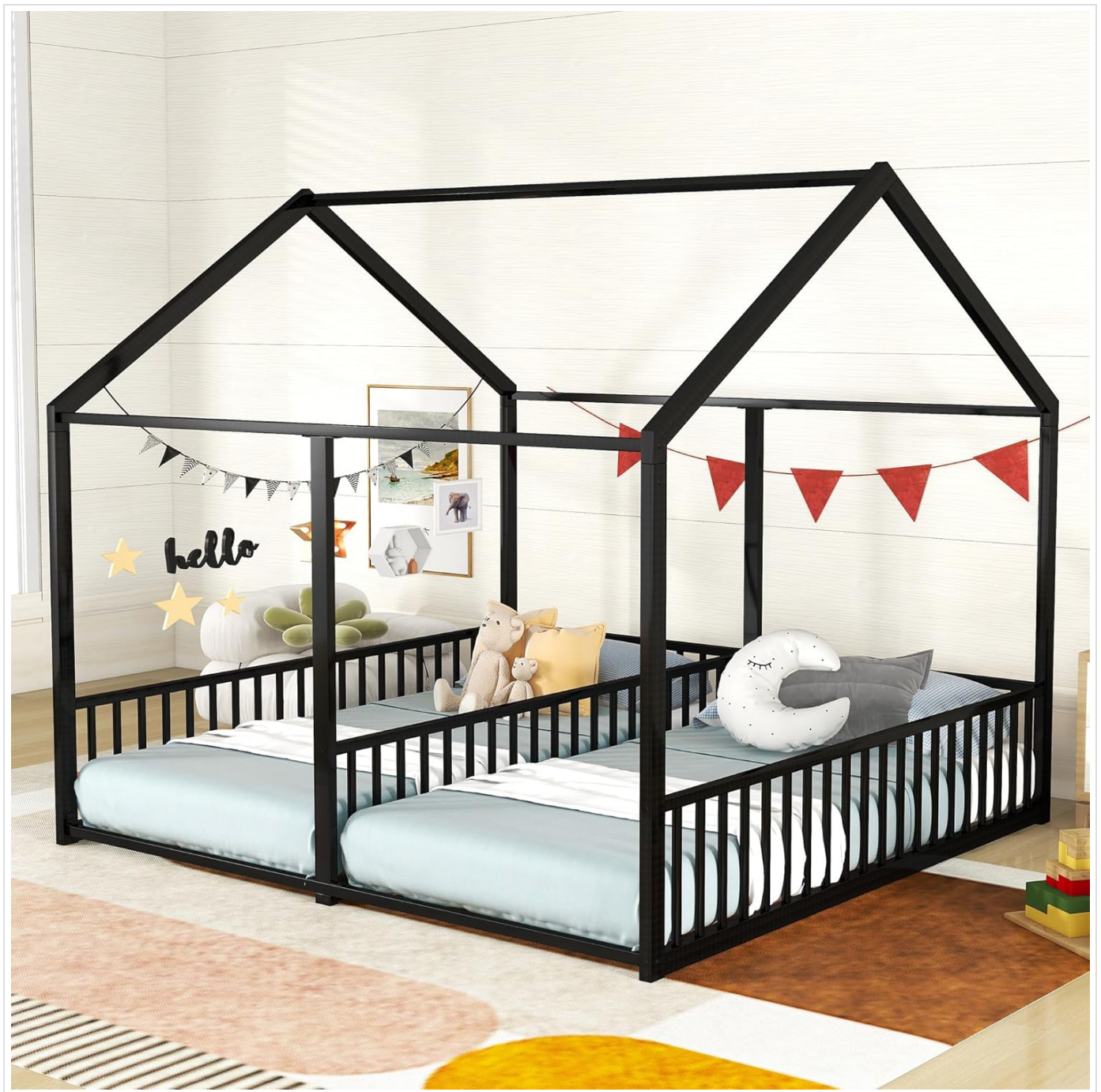
Figure 1: Fully assembled Bellemave Double Floor Bed for Twins, showcasing its house-shaped design and dual sleeping areas.

Video 1: A brief display video of the Bellemave Double Floor Bed, illustrating its design and potential room setup.